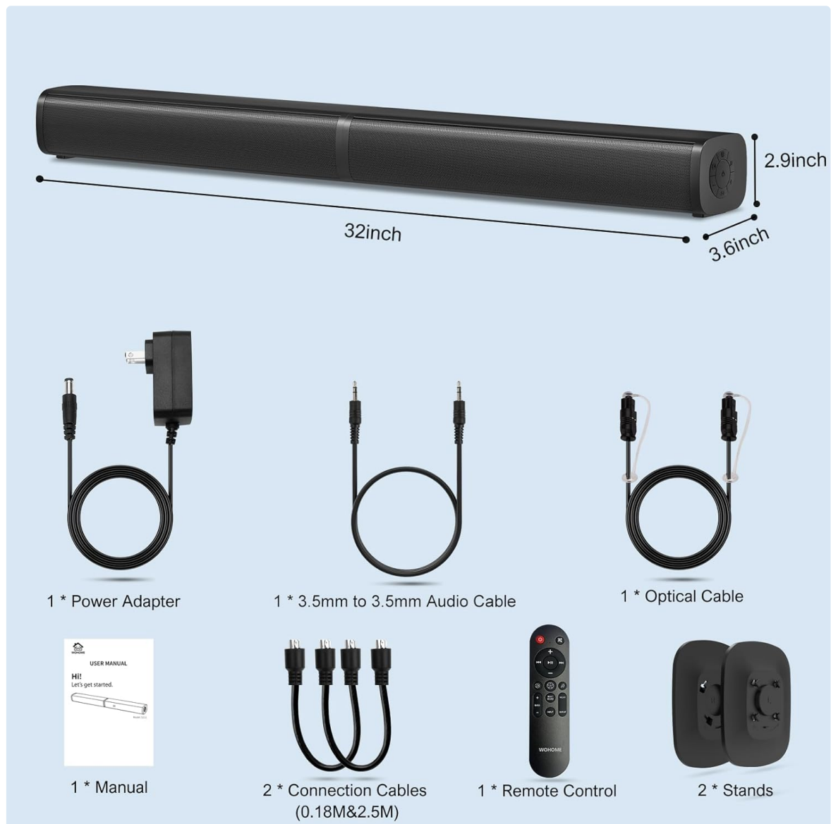
Image: All items included in the Wohome Sound Bar package.