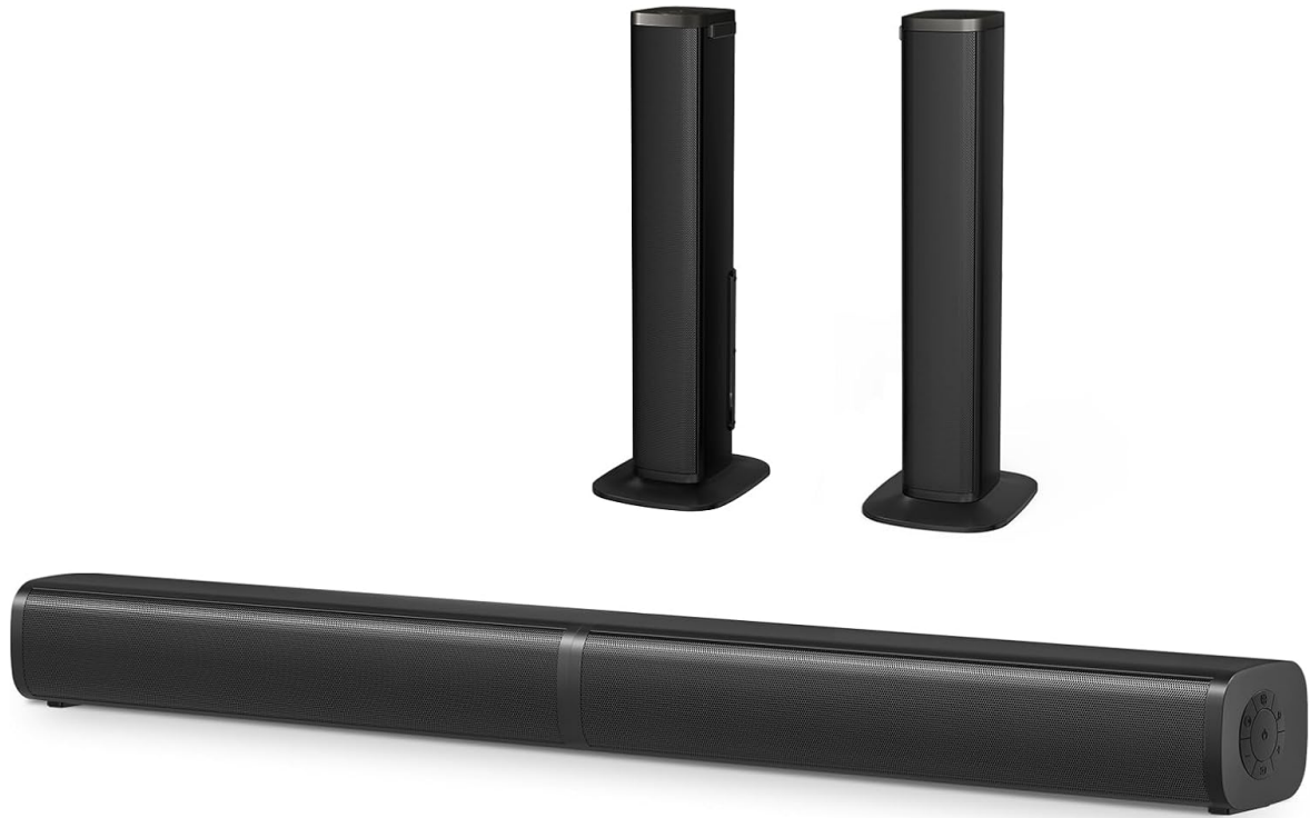
Image: The soundbar shown in its assembled horizontal form and as two separate vertical towers with stands.

The soundbar comes in two detachable pieces. To assemble, align the ends and twist to secure. For vertical setup, attach the provided stands to the bottom of each piece by aligning the grooves and twisting until secure. This allows for flexible placement options.