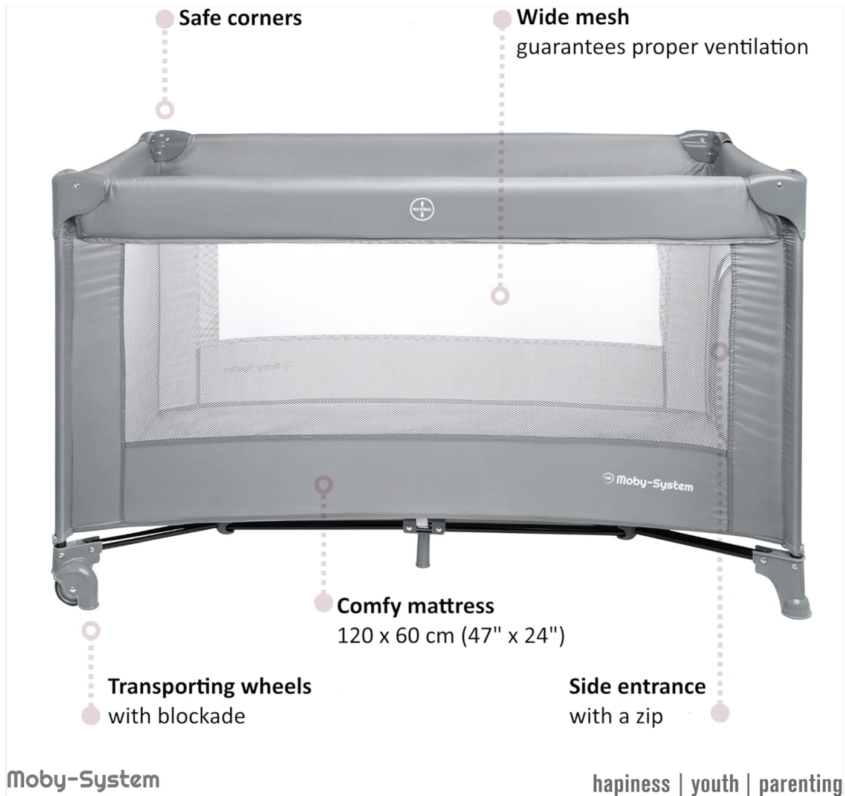
Image: Overview of the Moby-System Basic Travel Cot highlighting features like safe corners, wide mesh for ventilation, comfy mattress, transporting wheels, and side entrance.