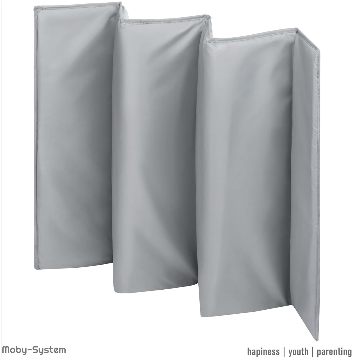
Image: The foldable mattress, a key component of the travel cot.