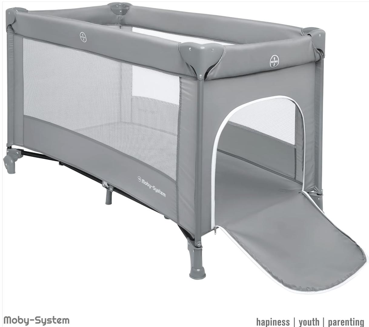
Image: The travel cot with its side entrance unzipped and open, providing easy access.

The travel cot features a zippered side entrance, allowing older children to enter and exit independently. Ensure the zipper is fully closed when the child is sleeping or unsupervised to prevent accidental falls.