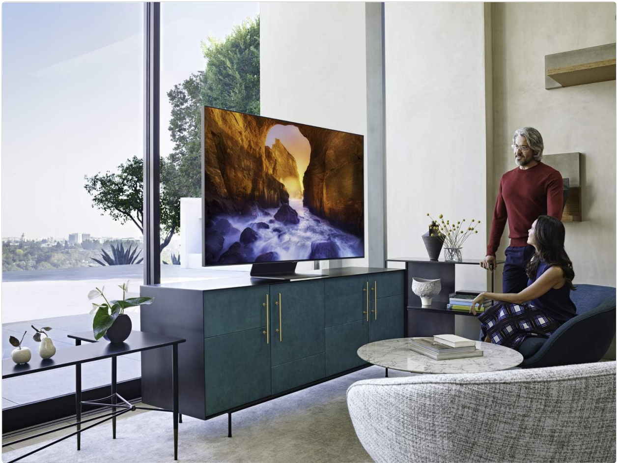
Figure 4.1: The Samsung Q90 Series TV integrated into a modern living room, showcasing its sleek design and how Ambient Mode can make it blend into the environment.