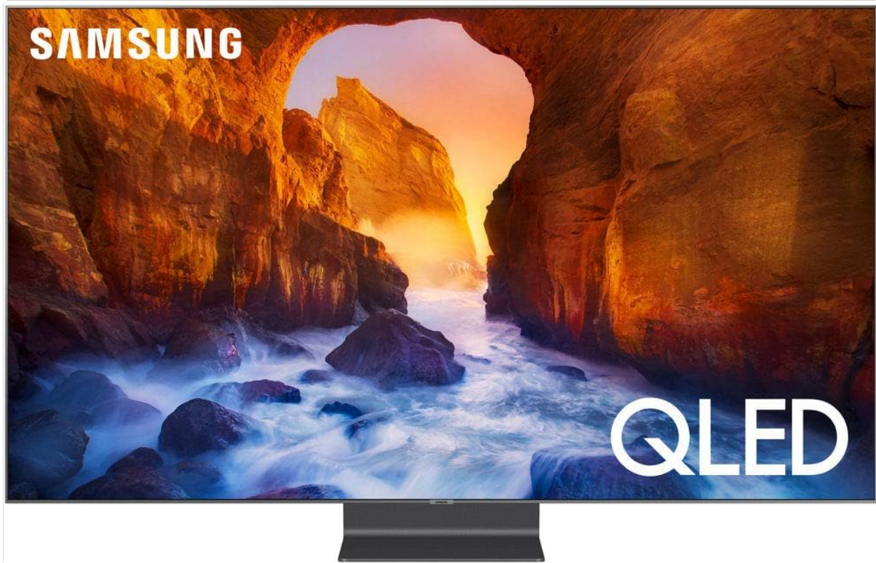
Figure 1.1: Samsung Q90 Series 65-Inch QLED 4K UHD Smart TV. This image displays the television unit with its sleek design and minimal bezels, showcasing the vibrant display.