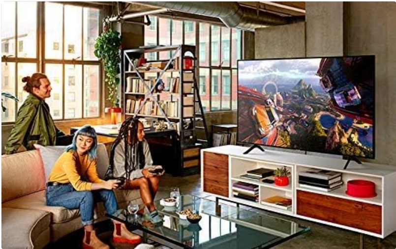
Image: A Samsung QLED TV integrated into a modern living room, showing people engaged in gaming, illustrating the TV's suitability for entertainment.