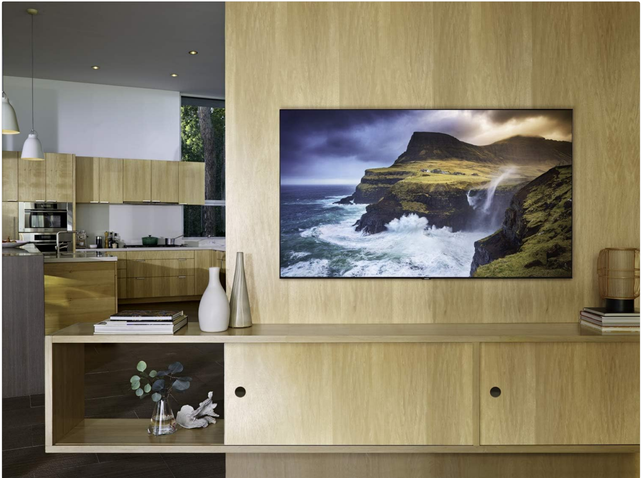
Image: The Samsung Q70 Series TV seamlessly integrated into a living room, demonstrating its suitability for wall mounting.

Your TV can be placed on a stand or mounted on a wall. For stand installation, carefully follow the instructions provided in the separate stand assembly guide. For wall mounting, the TV is compatible with Mini Wall and VESA (400 x 300) mounts. Ensure you use appropriate screws and mounting hardware for your chosen method. It is recommended to have two people for safe installation.