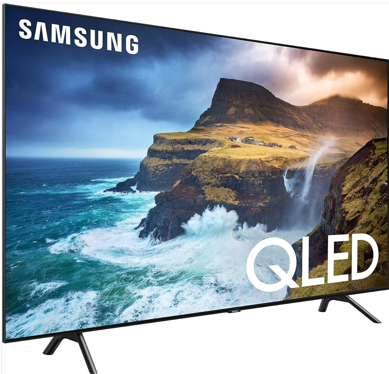
Image: A side profile of the Samsung Q70 Series TV, illustrating its thin design.