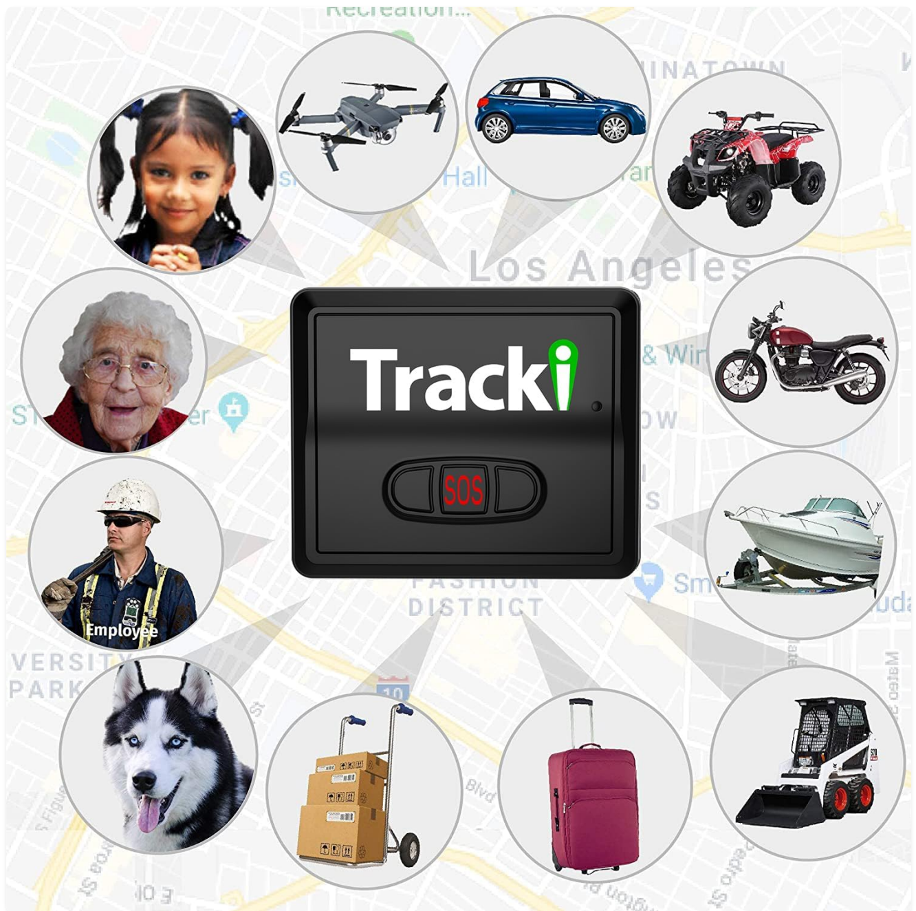
Figure 5: Versatile applications of the Tracki GPS Tracker.

Your browser does not support the video tag.