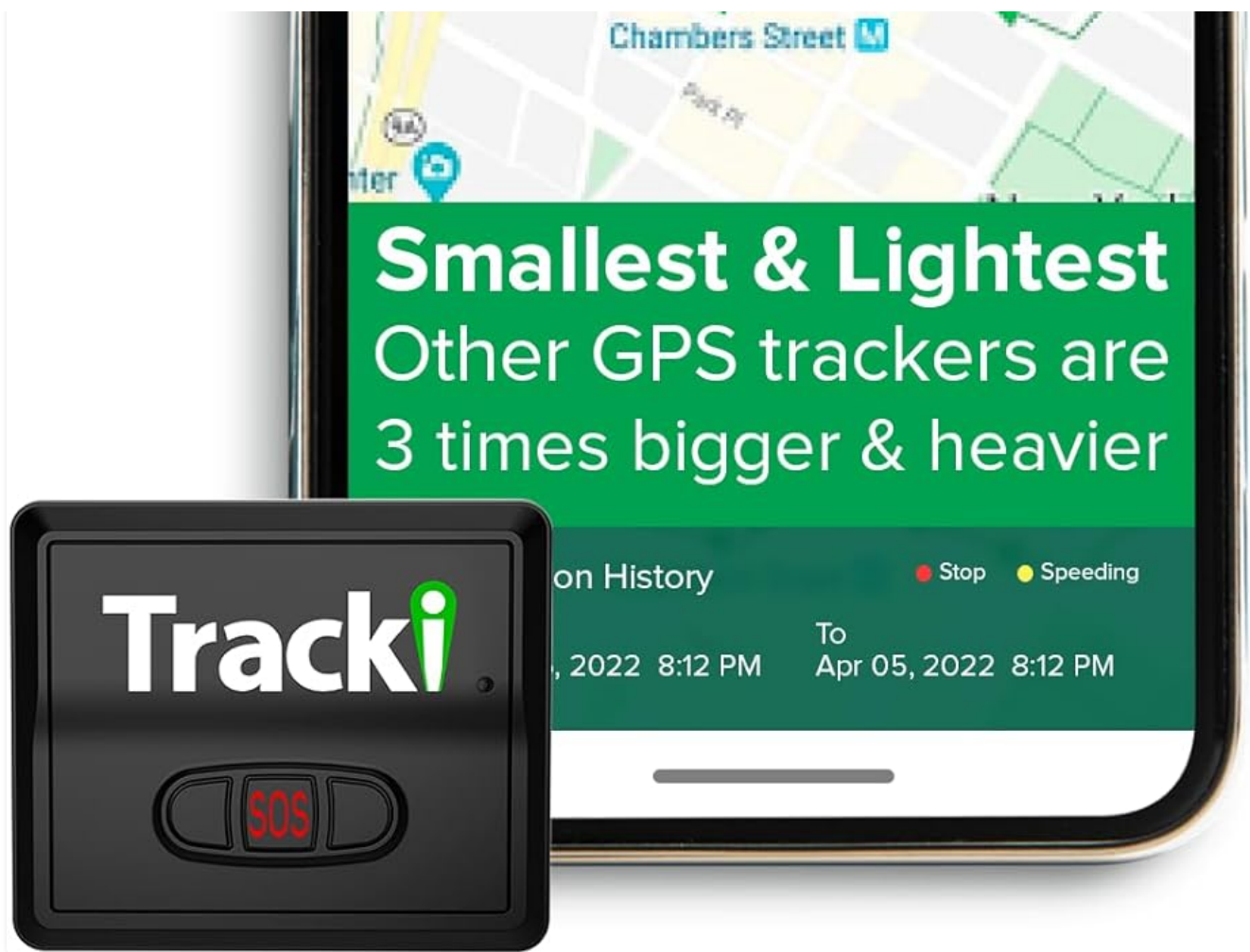
Figure 1: Tracki GPS Tracker and Mobile Application Interface.