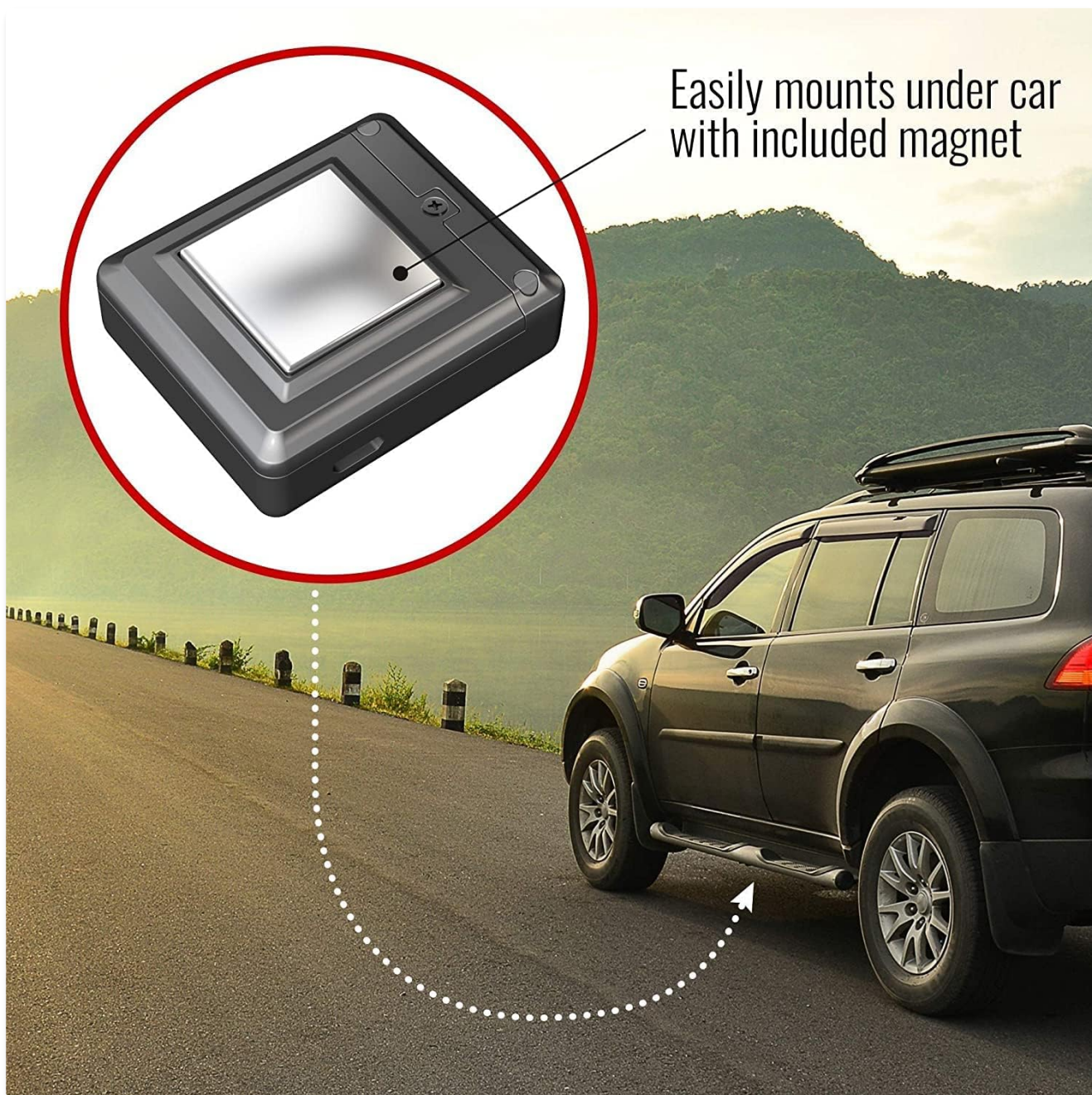
Figure 3: Magnetic attachment for vehicle tracking.