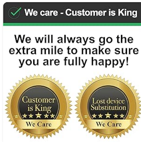
Figure 7: Tracki - Your partner in unlimited distance GPS tracking.