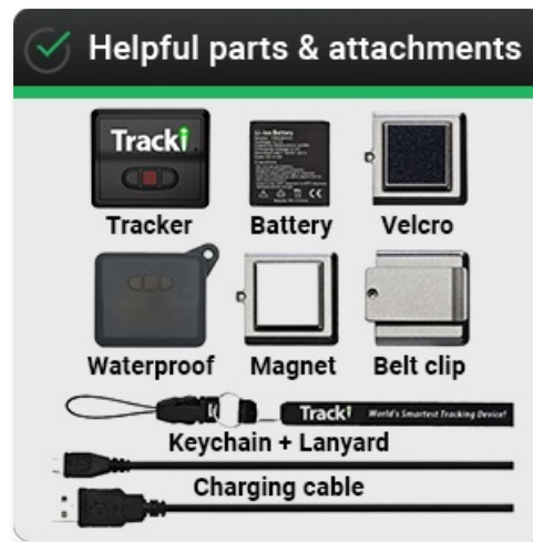
Figure 2: Included accessories for versatile use.