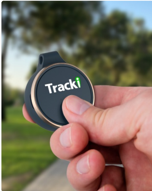
Figure 6: The Tracki GPS Tracker is notably small and lightweight.