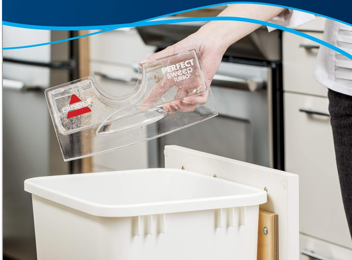
Image: A hand demonstrating the easy-to-empty dirt cup of the Bissell Perfect Sweep Turbo.