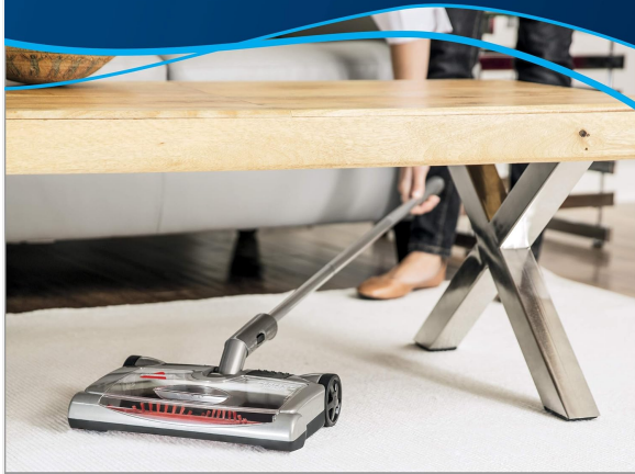
Image: The lightweight and versatile design allows the sweeper to easily clean under furniture.