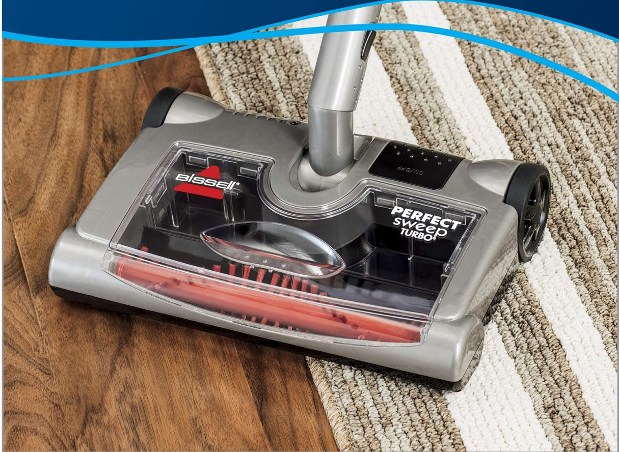
Image: A close-up view of the easy-glide rubber wheels, which should be kept clean for smooth operation.