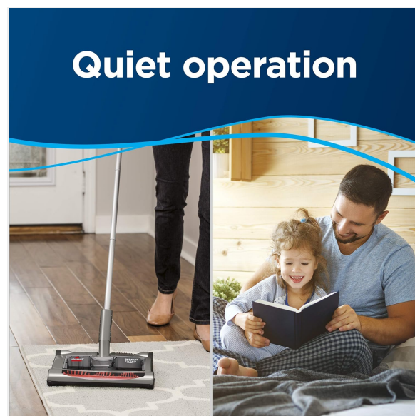
Image: A user operating the Bissell Perfect Sweep Turbo on a carpet, highlighting its powerful cordless cleaning.

with a long-lasting battery and powered brush