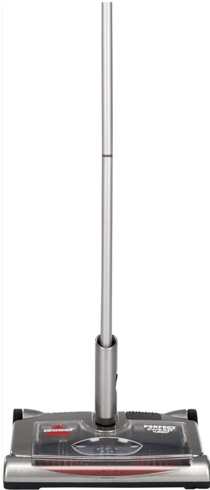
Image: The Bissell Perfect Sweep Turbo in action, demonstrating its cordless cleaning capability on a rug.