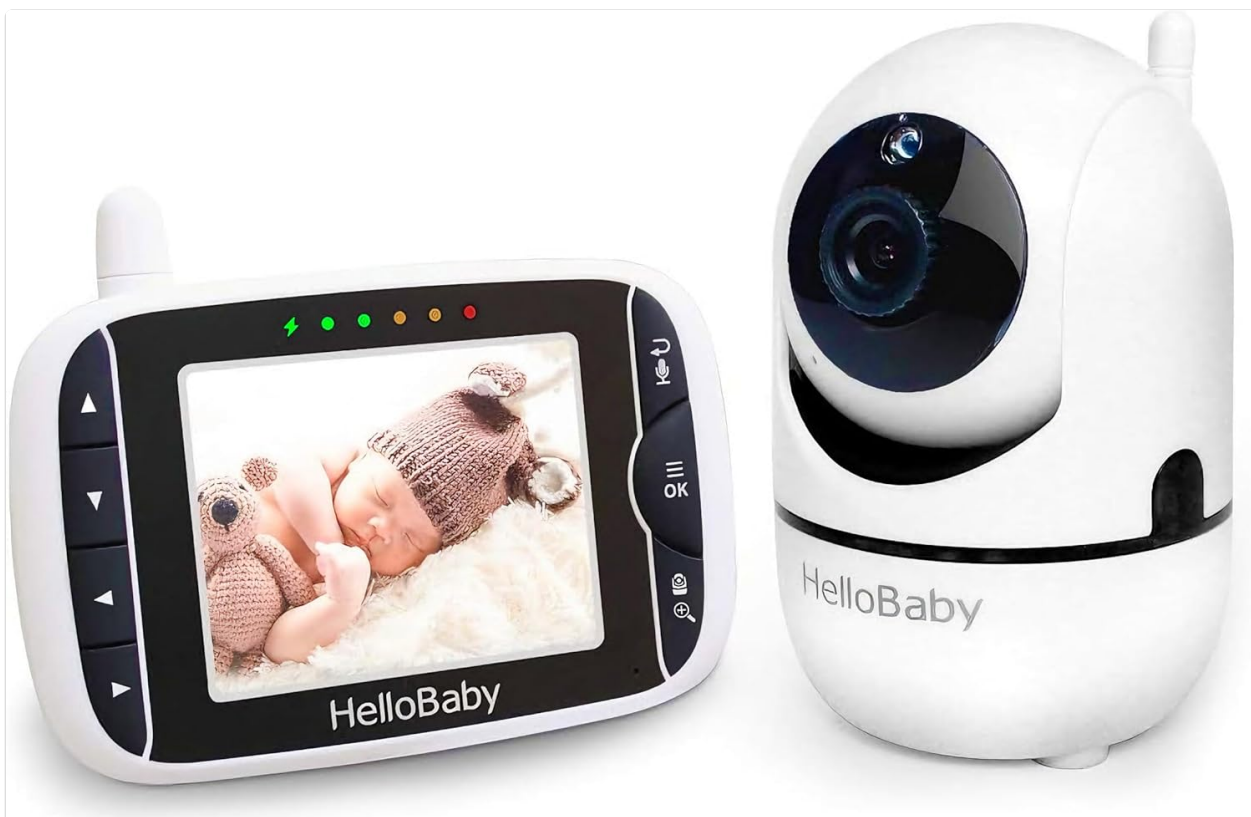
The HelloBaby Baby Monitor system, including the parent unit and baby camera.

Thank you for choosing the HelloBaby Baby Monitor HB65. This monitor is designed to provide parents with peace of mind, offering a clear view and audio of their baby from anywhere in the home. Featuring advanced wireless technology, remote camera control, and smart features, it ensures a secure and reliable connection to your little one.