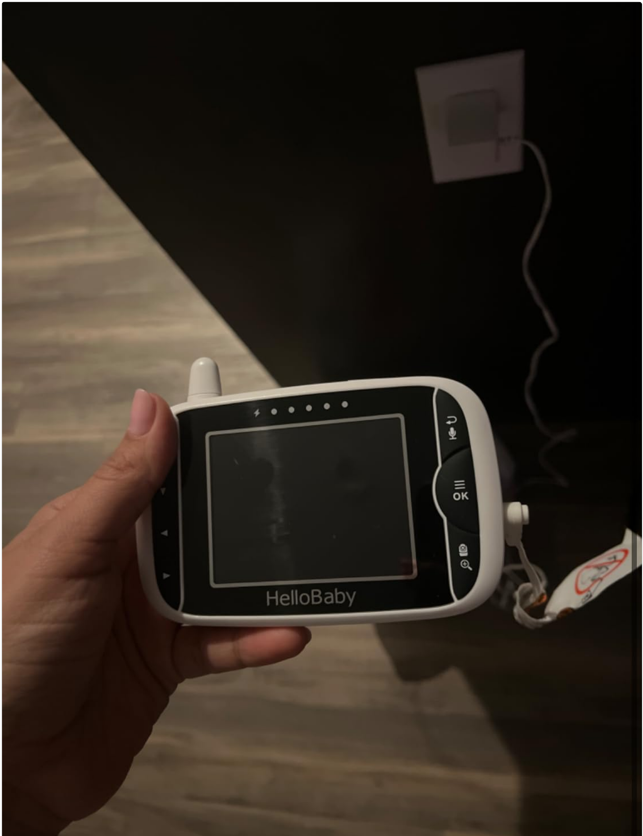
The portable parent unit, ready for use after charging.