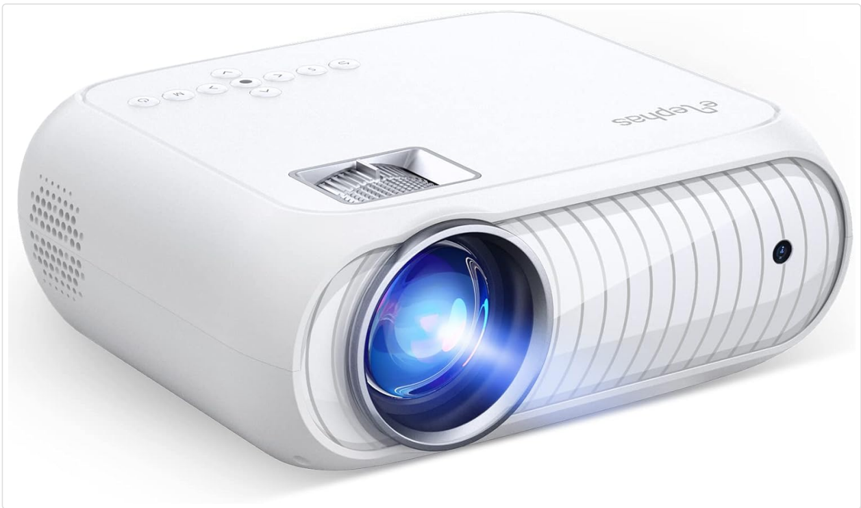
Figure 3.1: Front view of the ELEPHAS Mini Portable Projector, showcasing the lens, focus wheel, and control buttons on top.