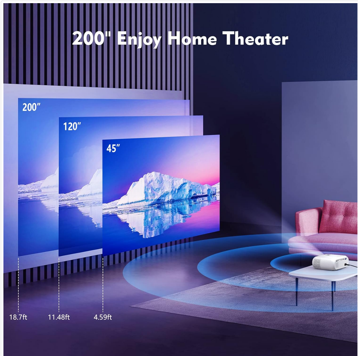
Figure 5.1: This diagram illustrates recommended projection distances for various screen sizes, showing 45" at 4.59ft, 120" at 11.48ft, and 200" at 18.7ft.

The optimal projection size depends on the distance between the projector and the screen. Refer to the following general guidelines: