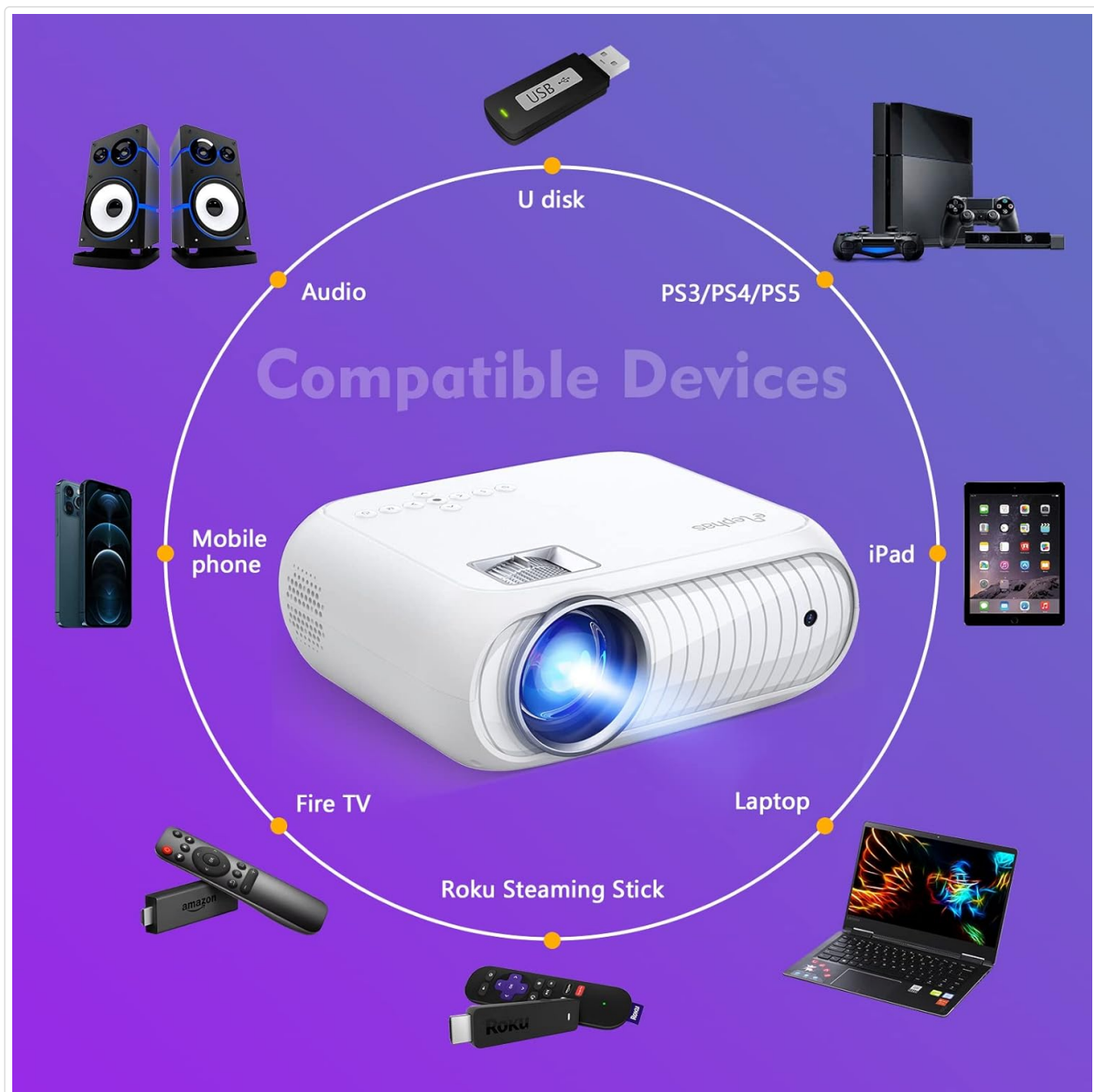
Figure 3.3: Illustration of various devices compatible with the projector, including mobile phones, iPads, laptops, Fire TV, Roku Streaming Stick, PS3/PS4/PS5, USB disks, and external audio systems.