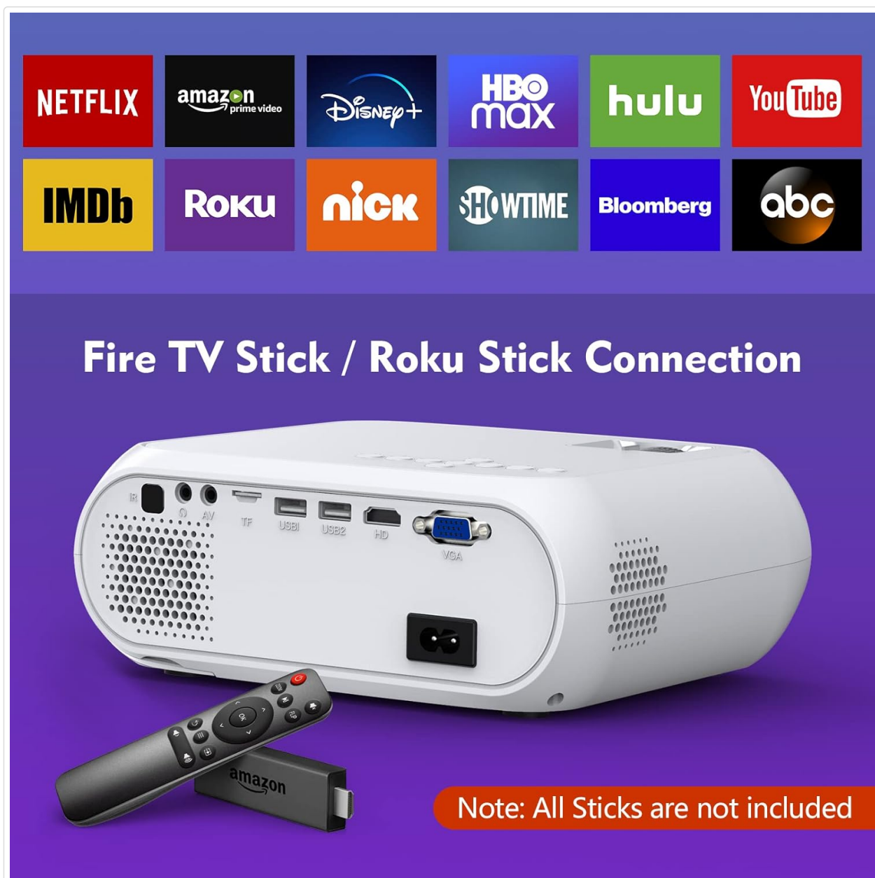
Figure 6.1: Close-up of the projector's rear panel, highlighting the various input ports for different connection types.

Note: For streaming devices like Fire TV Stick or Roku Stick, ensure they are powered separately if needed, as the projector's USB port might not provide sufficient power for all devices.