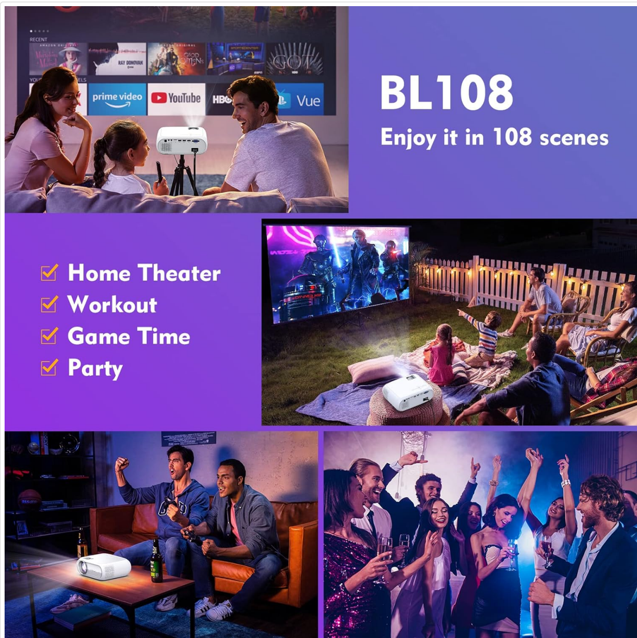
Figure 5.2: Examples of projector use, including home theater, workout sessions, game time, and parties, demonstrating its adaptability for different entertainment needs.