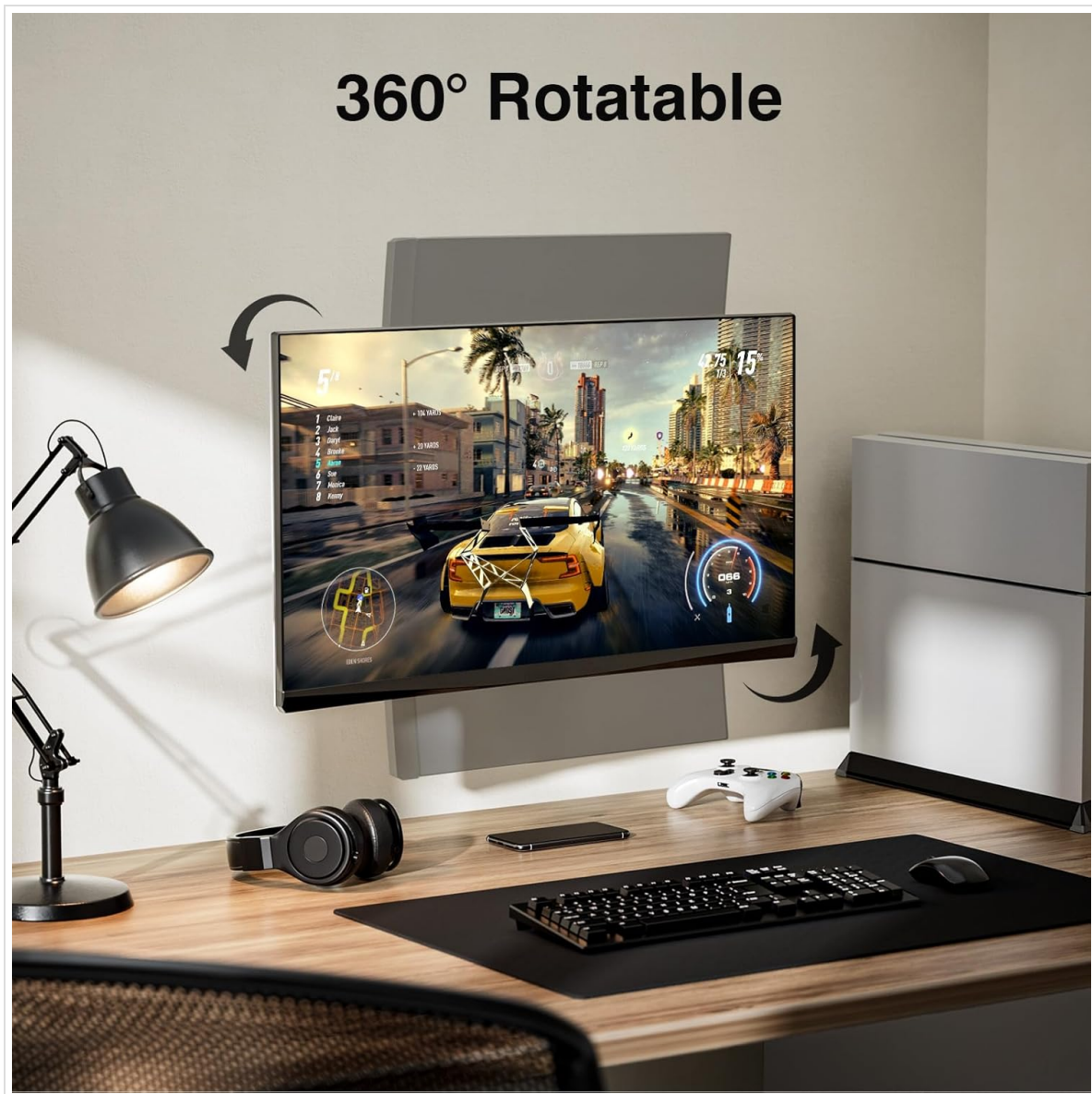
Figure 6.3: Rotate the TV 360 degrees for flexible orientation.