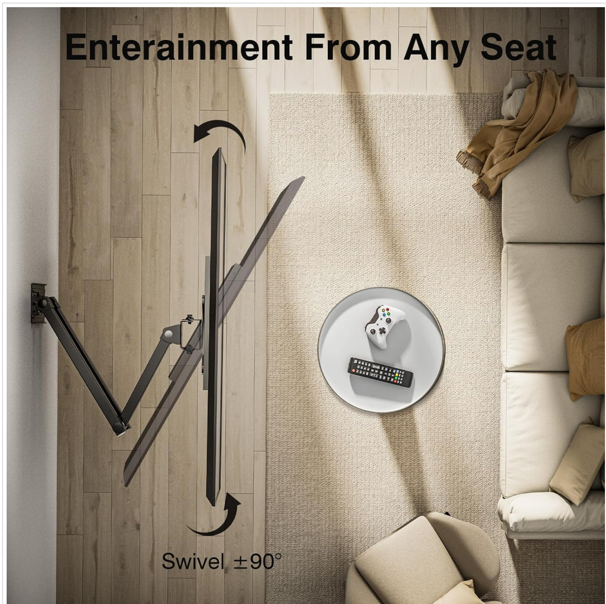
Figure 6.1: Swivel the TV left or right for optimal viewing.