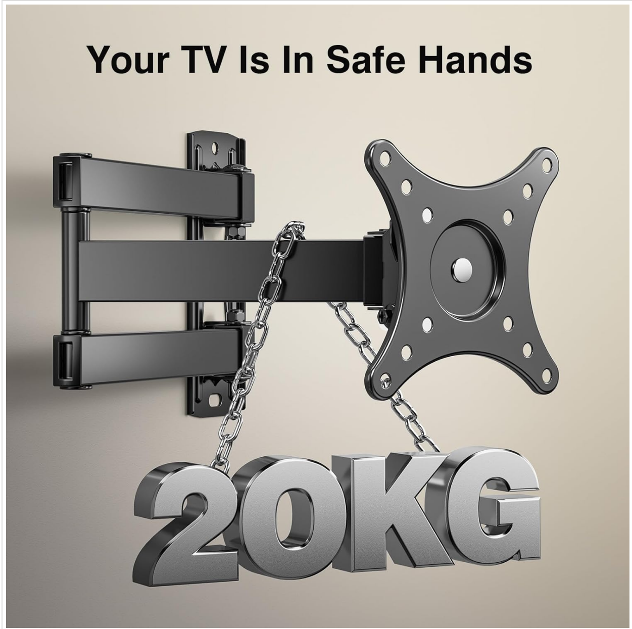
Figure 2.3: The mount is tested to support up to 20 kg (44 lbs).