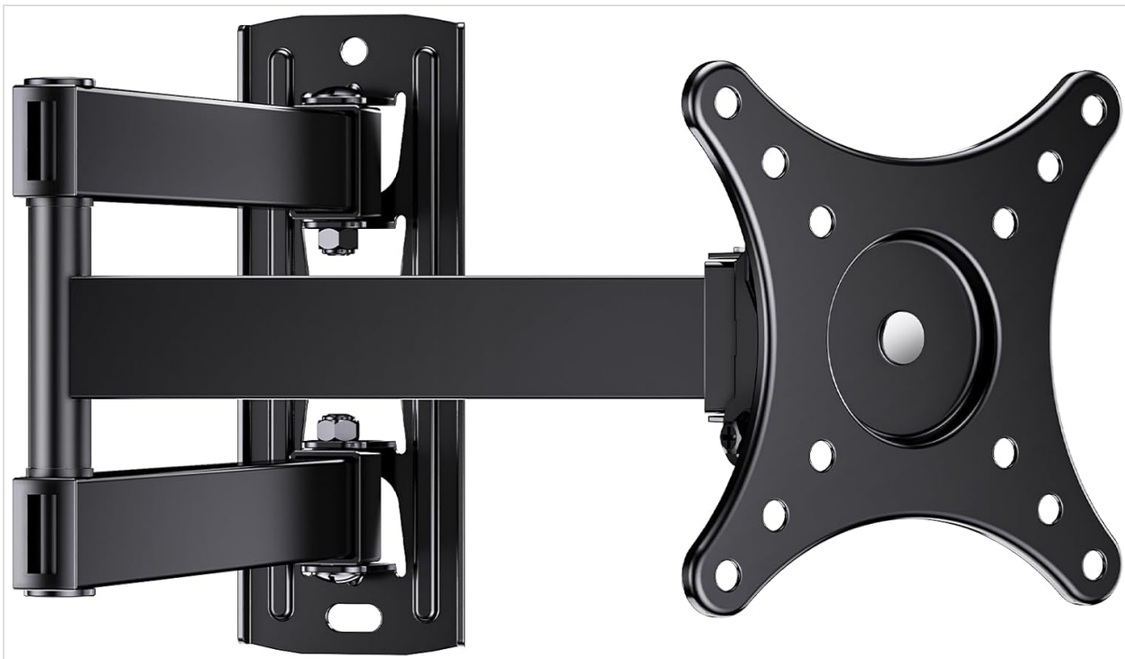
Figure 2.1: Main view of the Perlegear PGXSF1 TV Wall Mount.