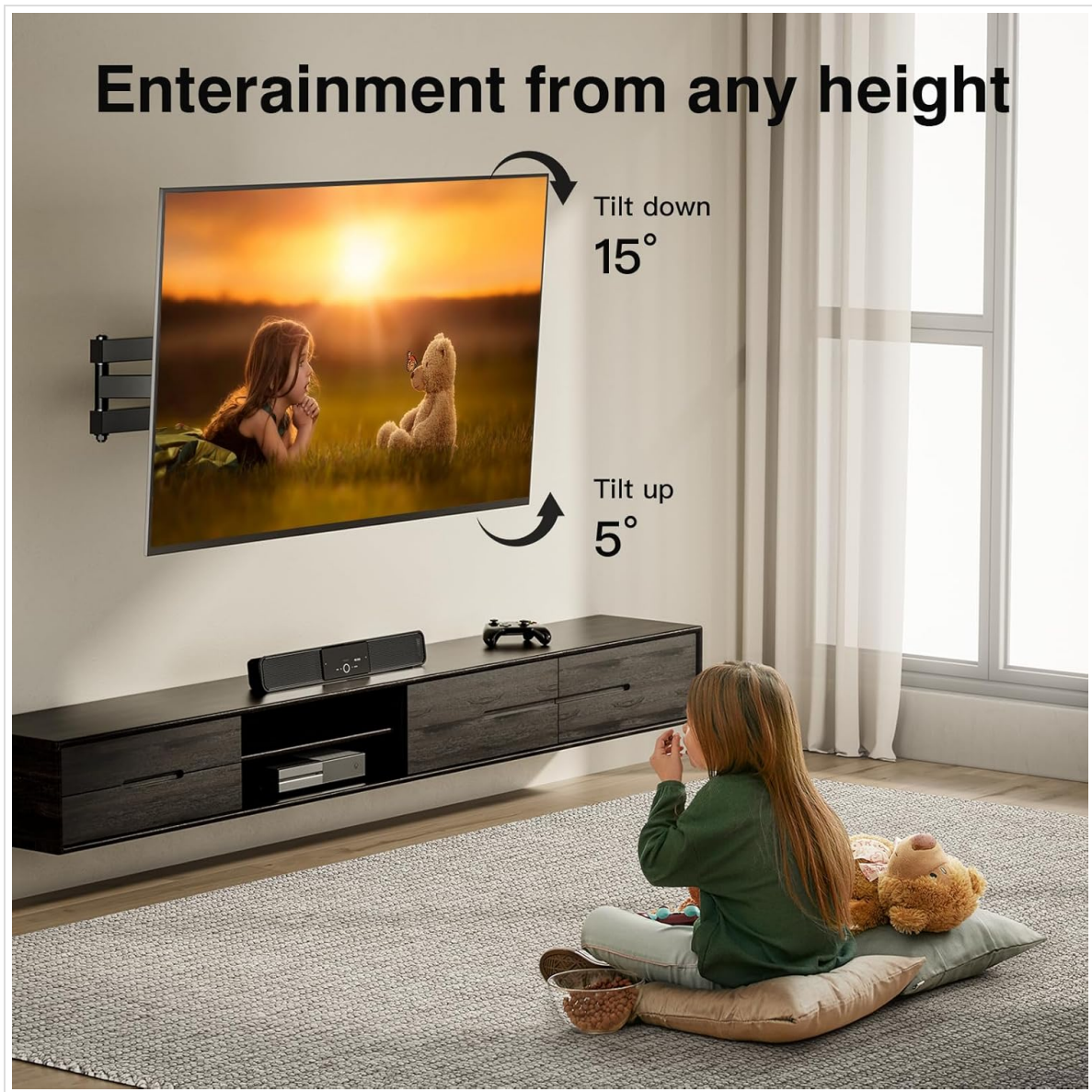
Figure 6.2: Tilt the TV up or down to reduce glare or adjust viewing height.