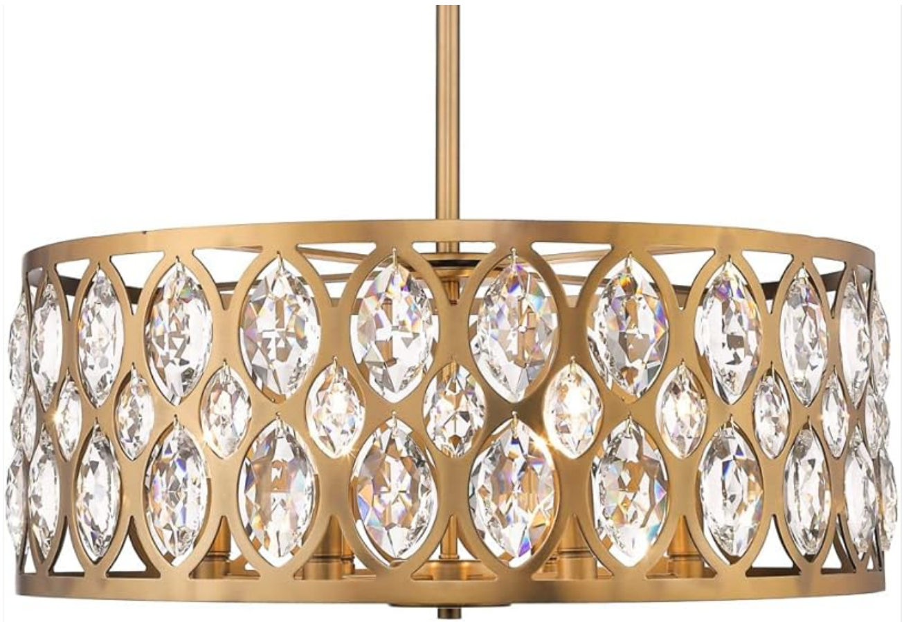
Image: The Z-Lite 6 Light Chandelier 6010-24HB in Heirloom Brass, fully assembled and ready for bulb installation.