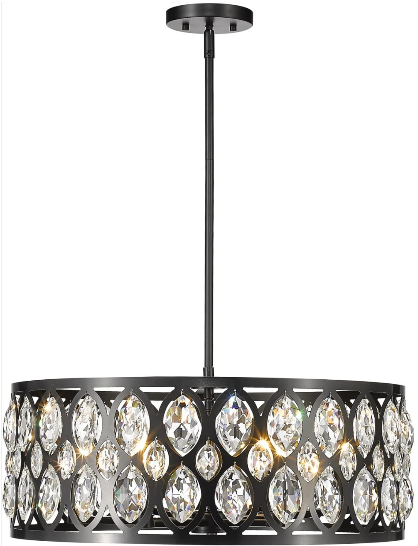
Image: The Z-Lite 6 Light Chandelier 6010-24HB in Heirloom Brass finish, showcasing its design and crystal accents.