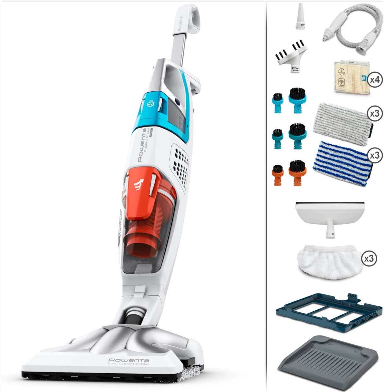
Figure 3.1: Main unit of the Rowenta Clean & Steam Multi.