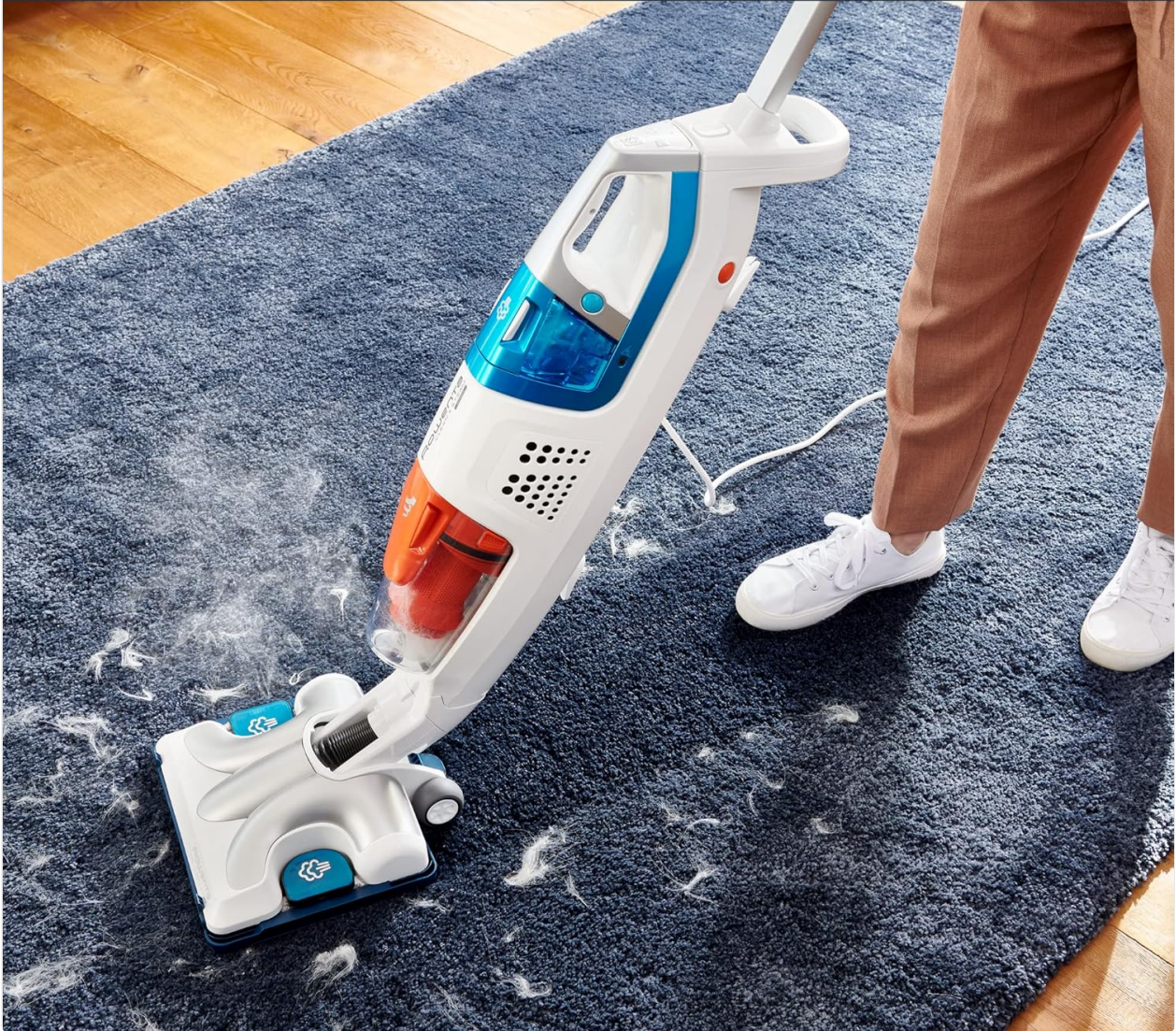
Figure 5.1: Cleaning a carpet with the integrated vacuum and steam function.