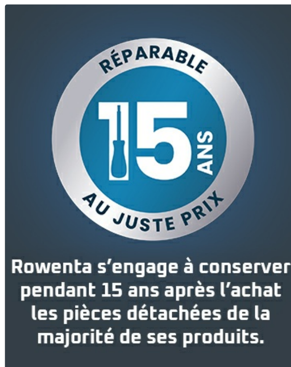
Figure 9.1: Rowenta's commitment to providing spare parts for 15 years.

Rowenta is committed to product durability and reparability. This appliance is designed for a long lifespan, with spare parts available for 15 years after purchase.