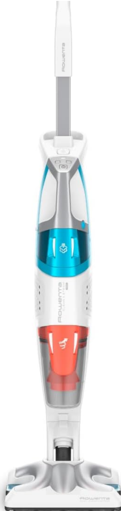
Figure 8.1: Product dimensions for the Rowenta Clean & Steam Multi.