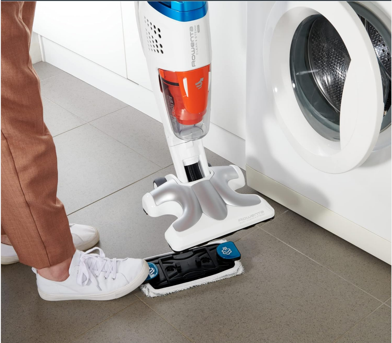
Figure 6.1: Microfiber pads are easily removable and washable for repeated use.