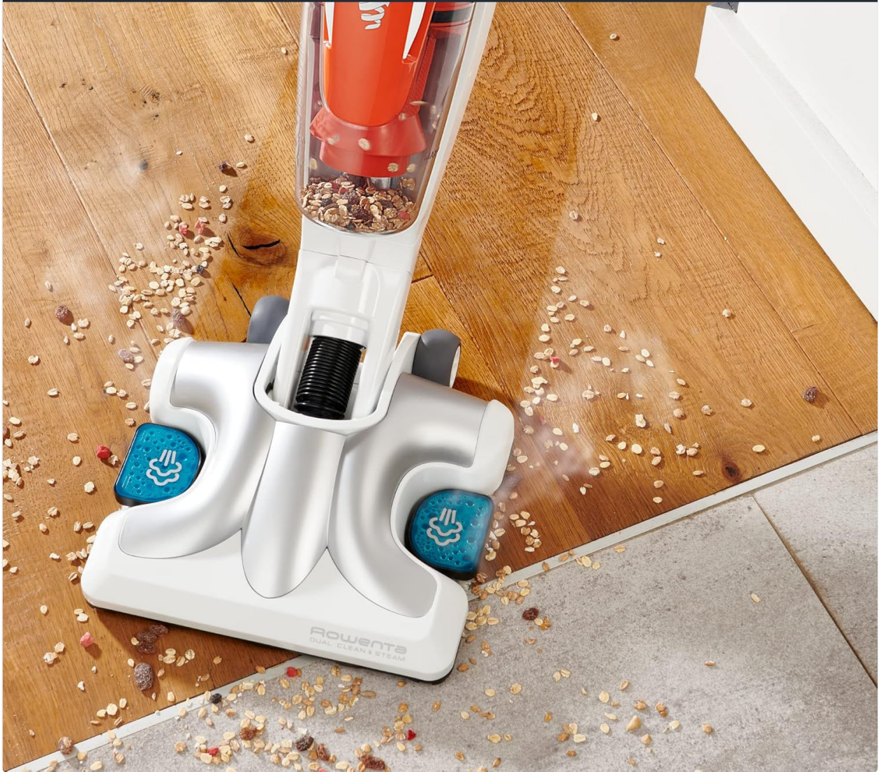
Figure 5.2: Deep cleaning on hard floors, effectively removing debris and sanitizing.