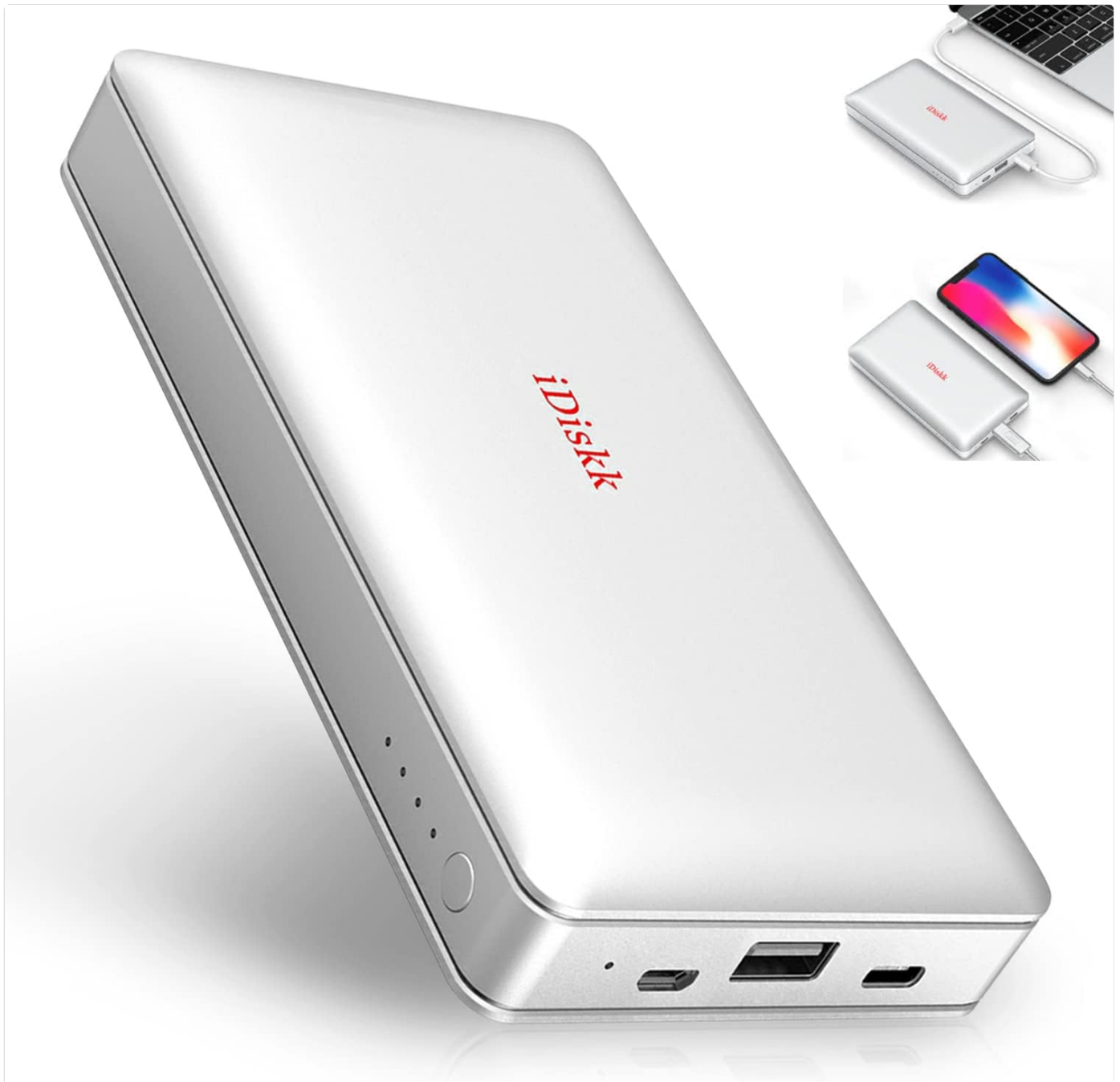
Image: The iDiskk 1TB External Hard Drive shown with its included MFi charging cable and Type-C cable, illustrating the complete package contents.