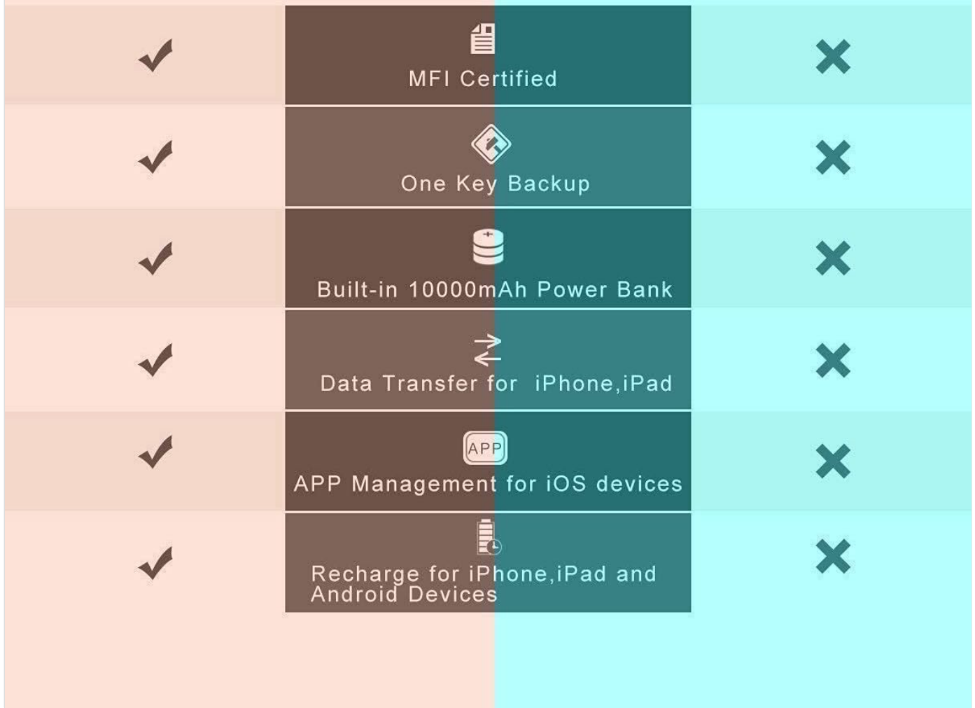
Image: A comparison chart illustrating the features of the iDiskk Hard Drive (MFi Certified, One Key Backup, Built-in 10000mAh Power Bank, Data Transfer for iPhone/iPad, APP Management for iOS devices, Recharge for iPhone/iPad/Android Devices) against a normal hard drive.