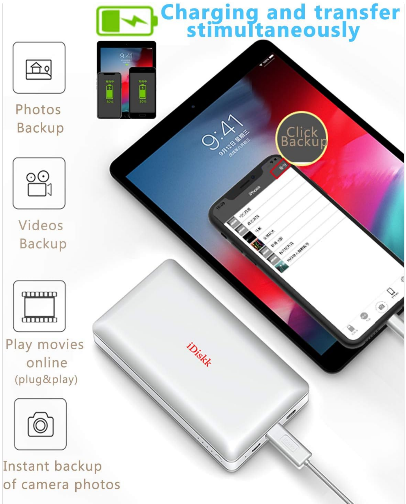
Image: An iPhone connected to the iDiskk Hard Drive via a Lightning cable, illustrating simultaneous data transfer and charging capabilities.

For Android/PC/Mac: Use the Type-C cable or a standard USB cable (if applicable) to connect the iDiskk device to your Android phone, PC, or Mac. The device will appear as an external storage drive.