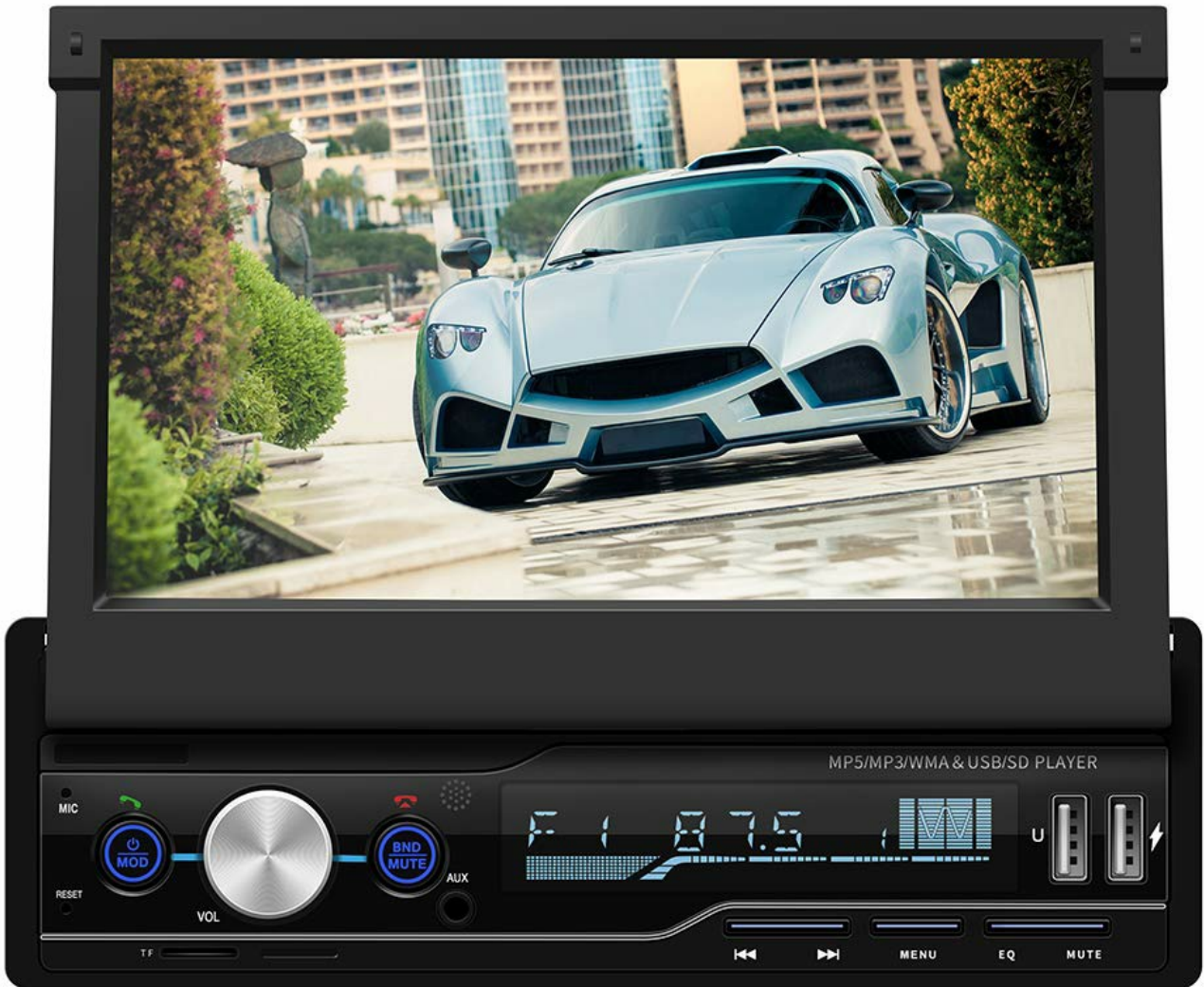
Image: Front view of the T100 Car Stereo with its 7-inch screen extended, displaying an image of a car. This illustrates the primary function and appearance of the device.