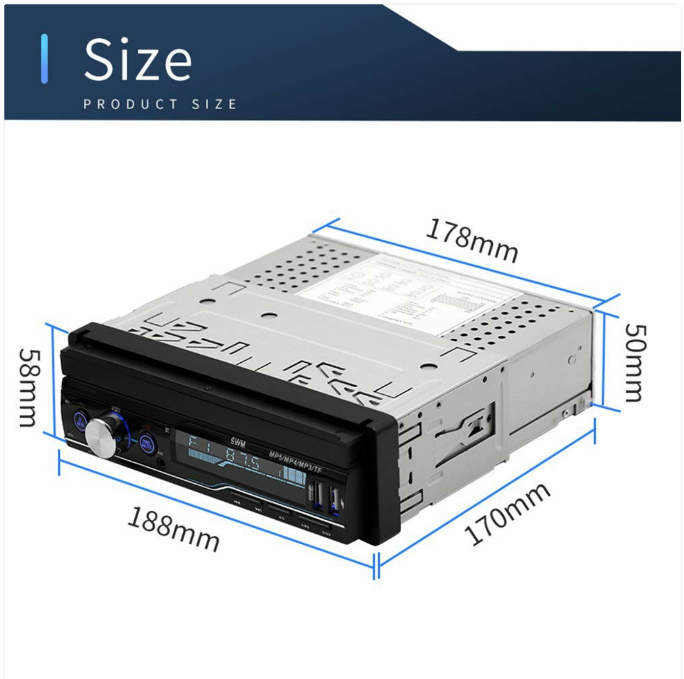
Image: Diagram showing the dimensions of the T100 Car Stereo. The unit measures 178mm in width, 50mm in height, and 170mm in depth, with the front panel measuring 188mm in width and 58mm in height. This is crucial for ensuring compatibility with your vehicle's dashboard opening.

The T100 unit has specific dimensions for installation. Refer to the diagram below for product size specifications: