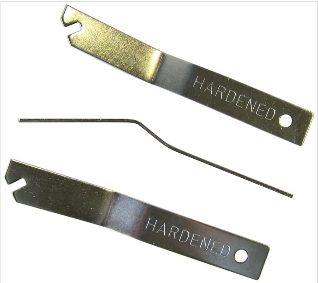
Image 2: Three T-Screw Security Picture Hanger Wrenches, illustrating the quantity provided in a pack and their consistent design. One wrench is shown from the side, highlighting its slim profile.