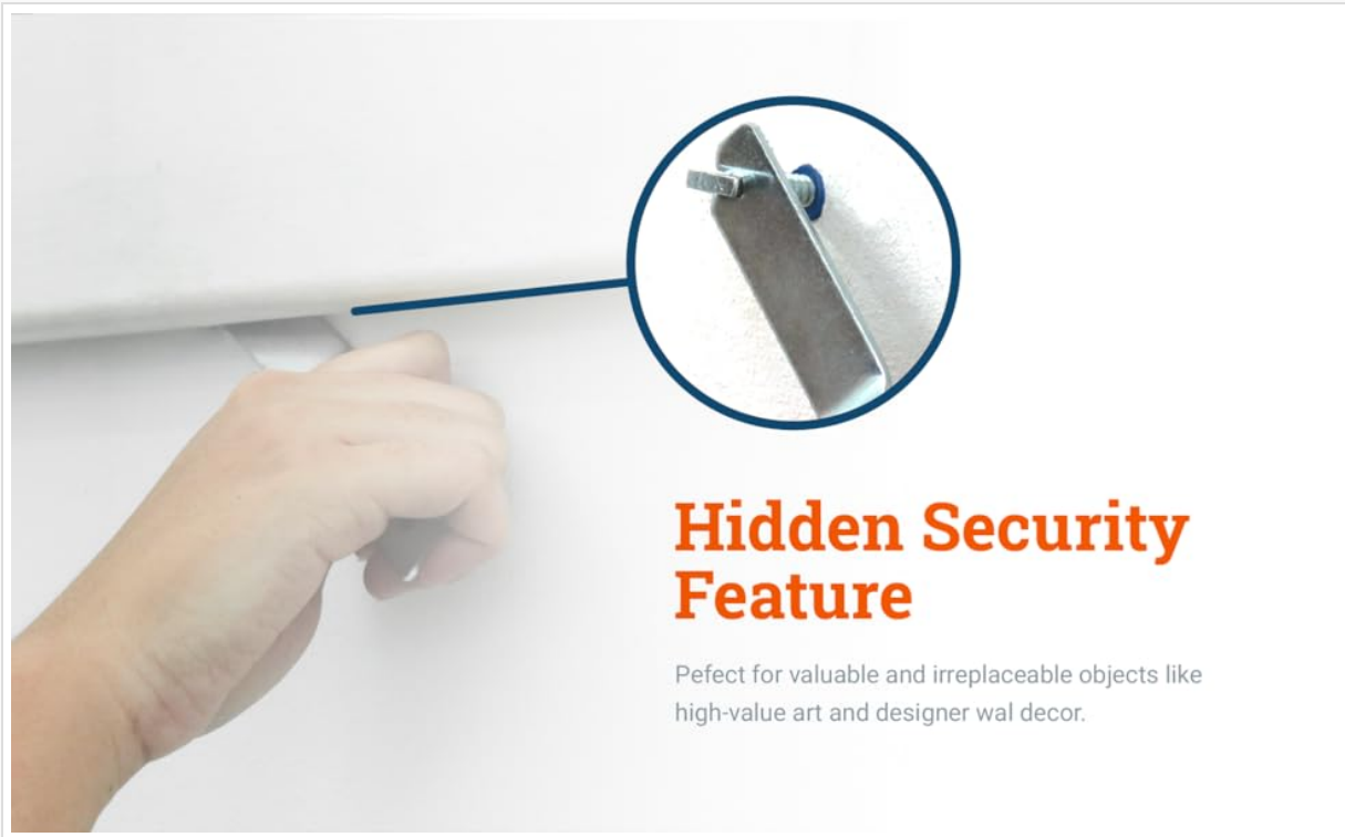
Image 7: A close-up view of a hand using the T-Screw wrench to operate a hidden security feature behind a picture frame, demonstrating its discreet application.

with an arrow indicating a rightward turn to transition from a 'Locked' to an 'Unlocked' position.