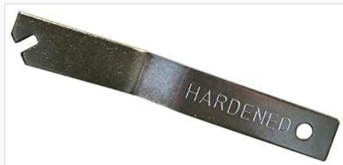
Image 1: A single T-Screw Security Picture Hanger Wrench, showing its hardened tip and overall design. The word "HARDENED" is visible on the shaft.

The T-Screw Security Picture Hanger Wrench is a specialized tool crafted from alloy steel, featuring a hardened tip designed to engage with T-Head security screws. Its slim profile allows it to reach up to 2 inches behind a framed item, facilitating discreet operation of security hardware.