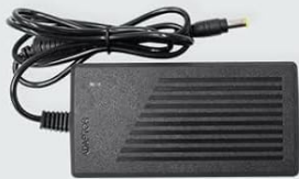
Power Adapter * 1