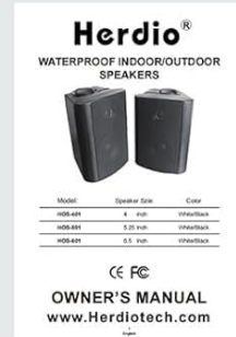
Manual * 1