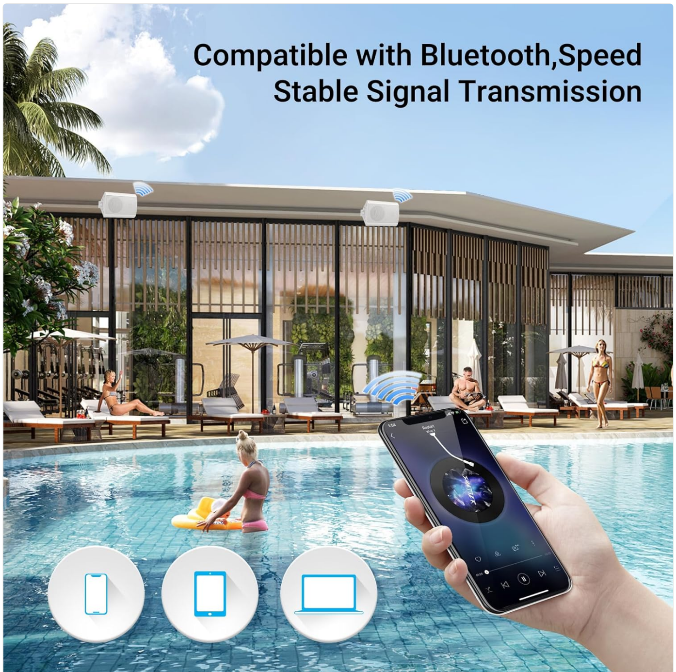
Figure 5.1: Bluetooth Compatibility. This image shows the speakers connected wirelessly to a smartphone, tablet, and laptop, highlighting their broad Bluetooth compatibility.