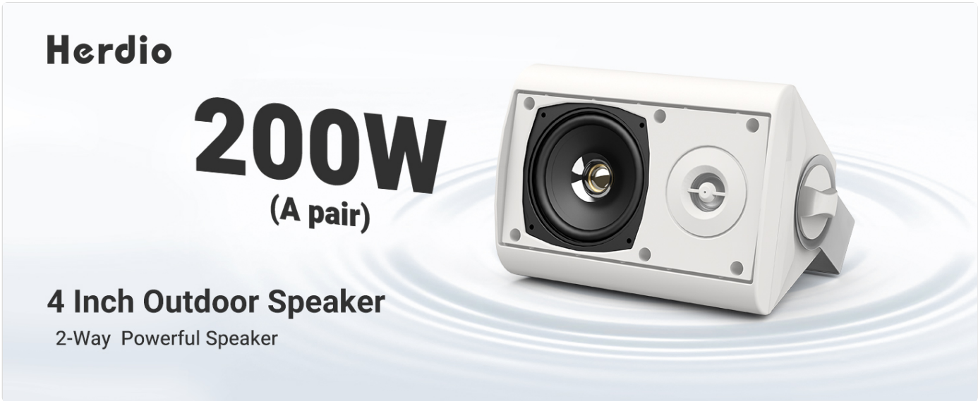
Figure 6.1: All Weather Resistant Coating. This image shows the speakers with water droplets, demonstrating their IP66 weather-resistant coating, suitable for outdoor environments.