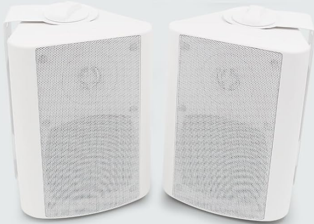
Outdoor Speakers * 2