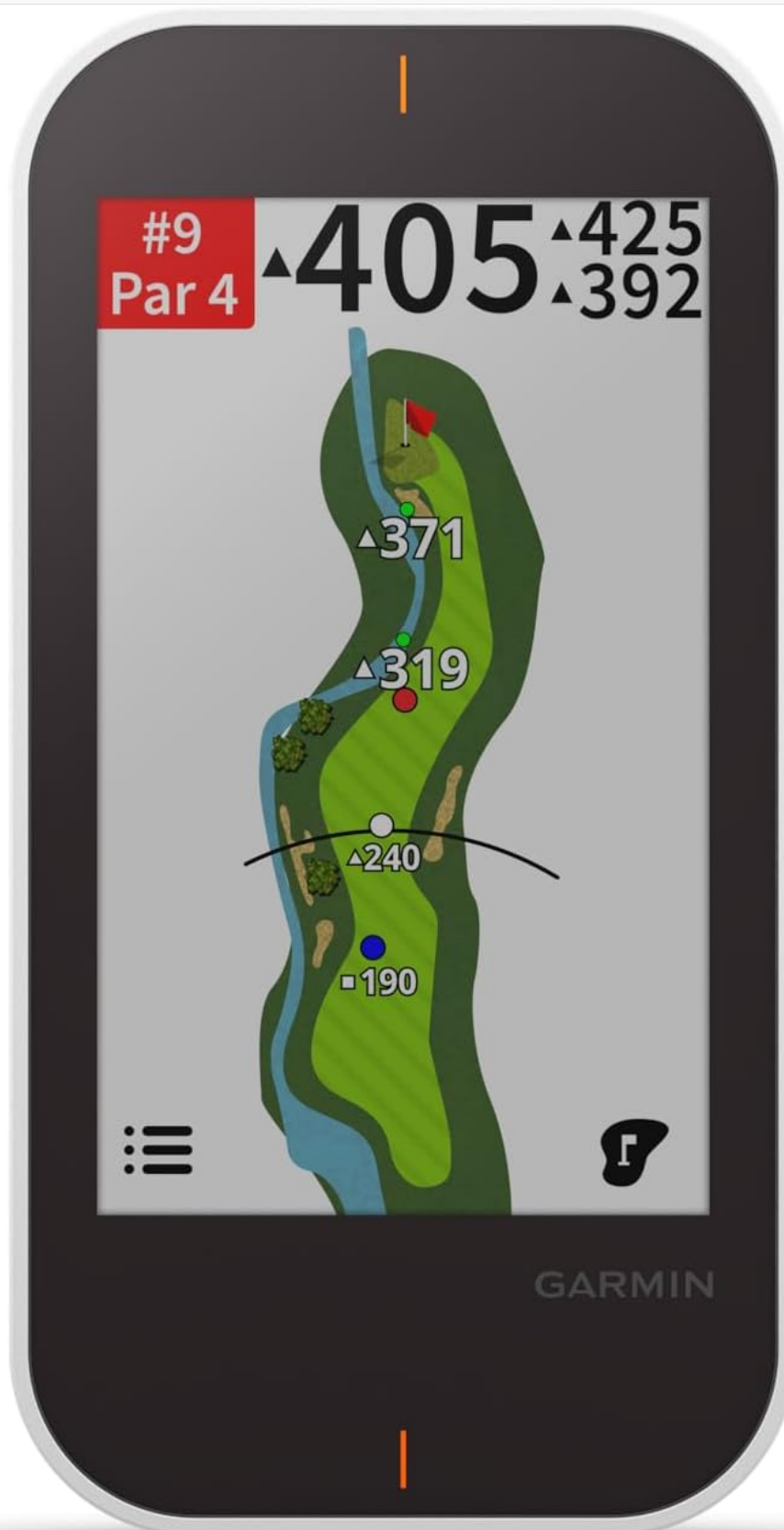
Image: The Garmin Approach G80 screen showing a detailed golf course map, indicating distances to the pin and other key locations on the hole.

4. Tap on the map to measure distances to any point on the course, such as hazards or layups.