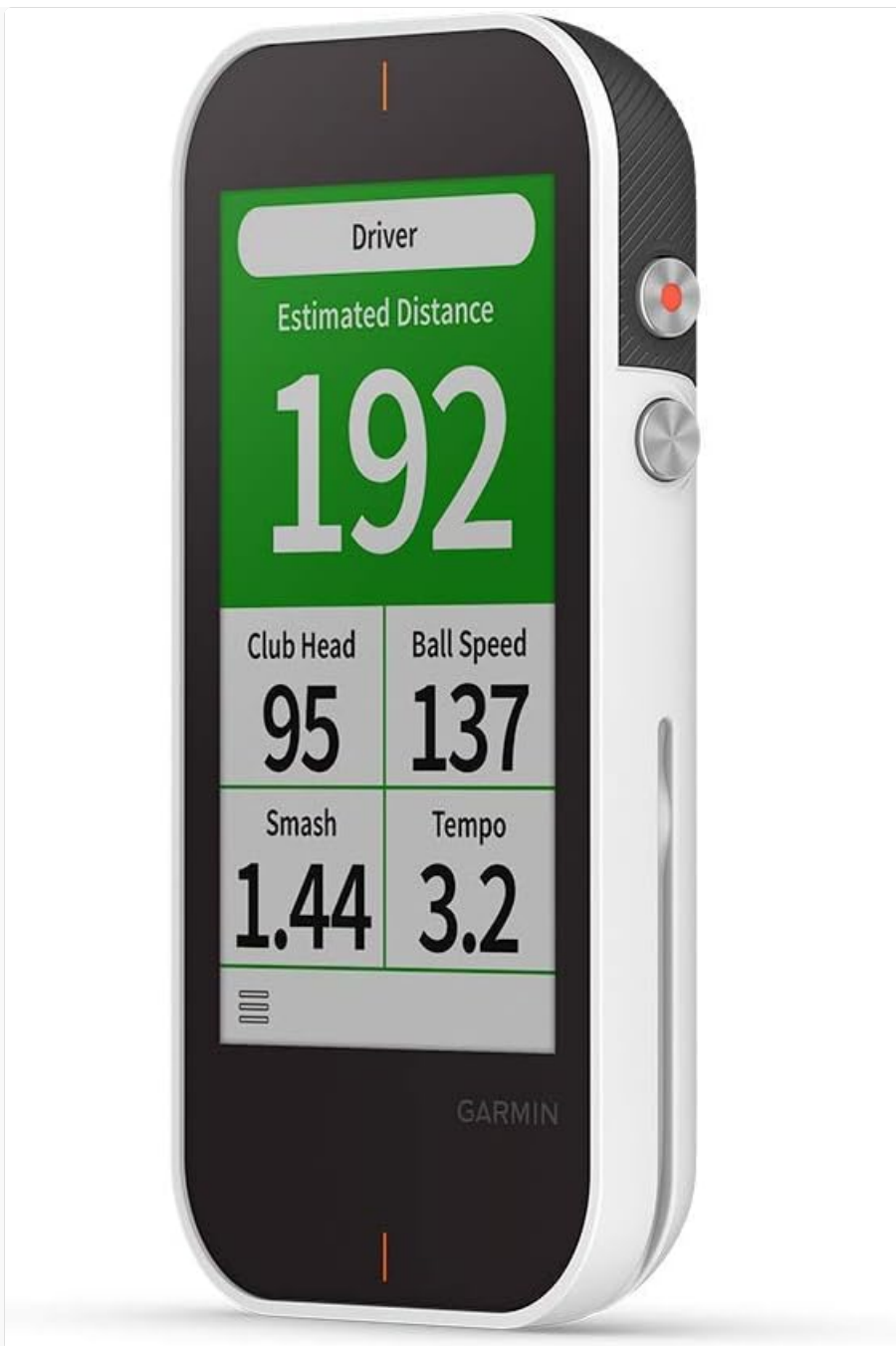
Image: The Garmin Approach G80 displaying detailed launch monitor metrics such as estimated distance, club head speed, ball speed, smash factor, and swing tempo.