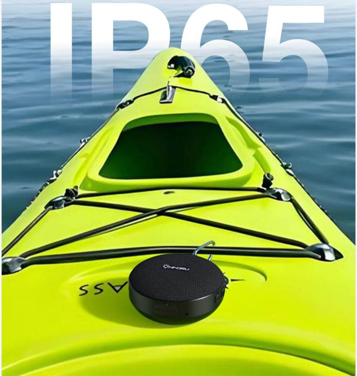
Image: The speaker on a kayak, highlighting its IP65 waterproof capability for water-related activities.

Perfect for riding, kayaking, beach, pool, bathroom