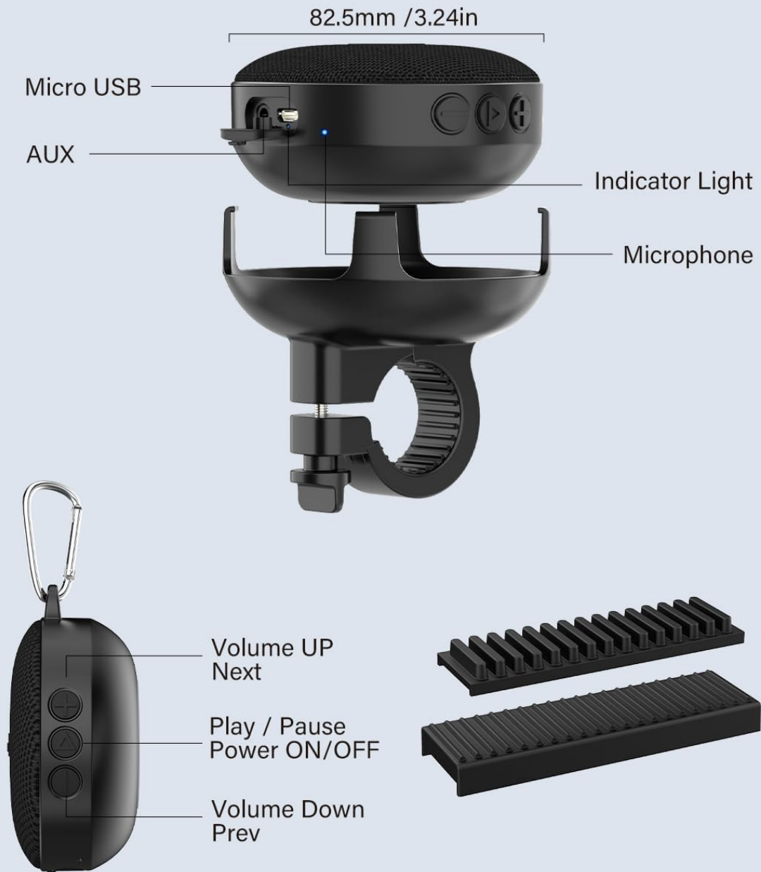
Image: Detailed diagram showing the Micro USB port, AUX port, Indicator Light, Microphone, Cycling Mount, Volume Up/Next button, Play/Pause/Power ON/OFF button, and Volume Down/Previous button.