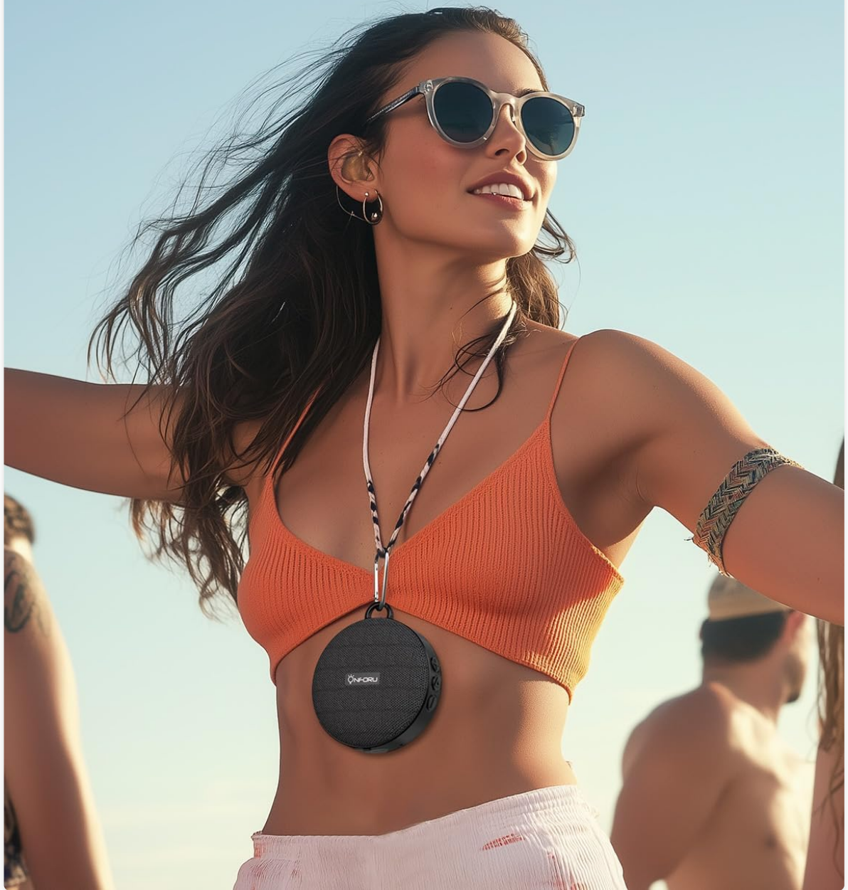
Image: A woman at the beach wearing the compact Onforu speaker around her neck, highlighting its small size and portability.

Portable, just 3.24 inches and 163 g weight