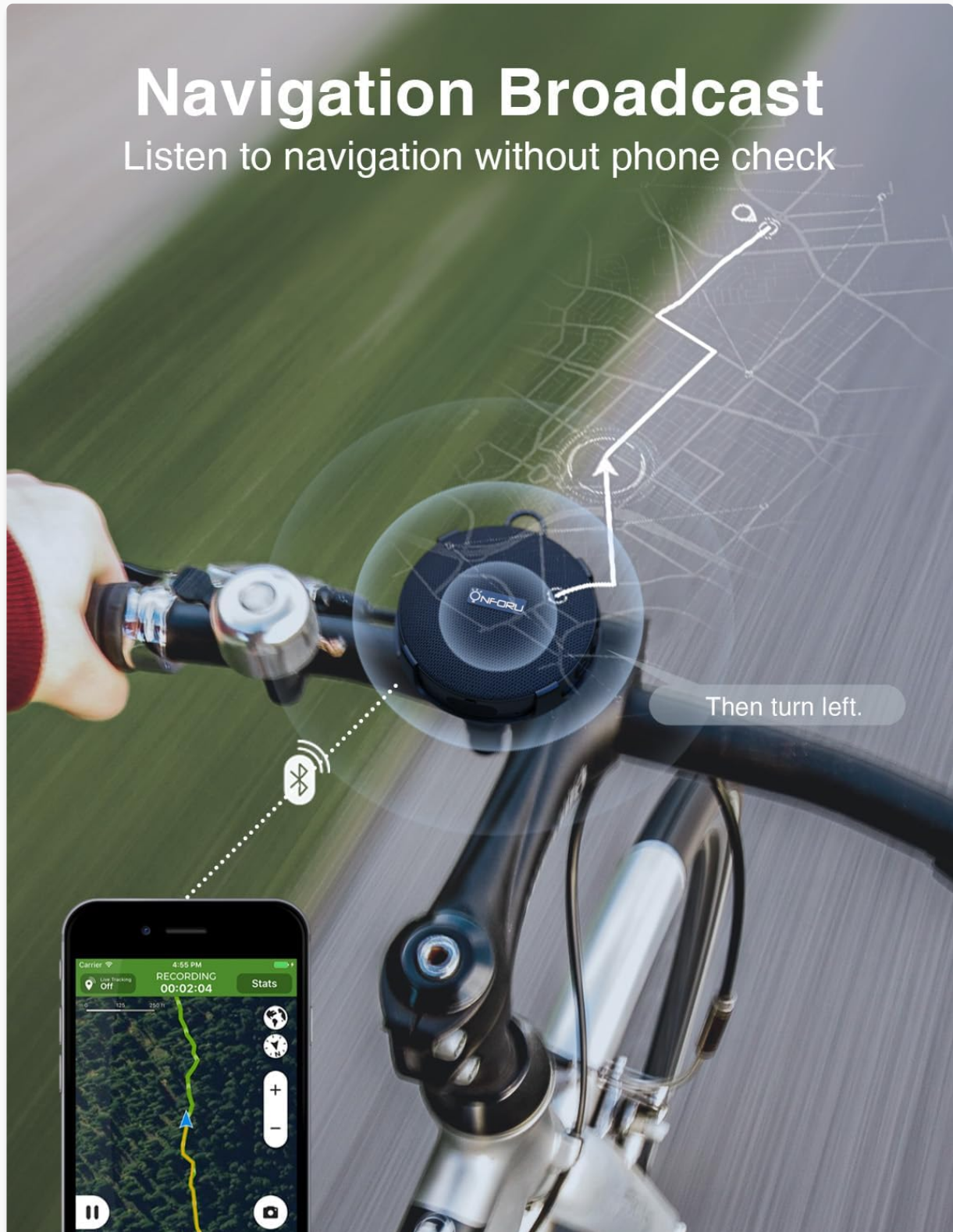
Image: A cyclist using the Onforu speaker to listen to navigation broadcasts from a connected smartphone, enhancing