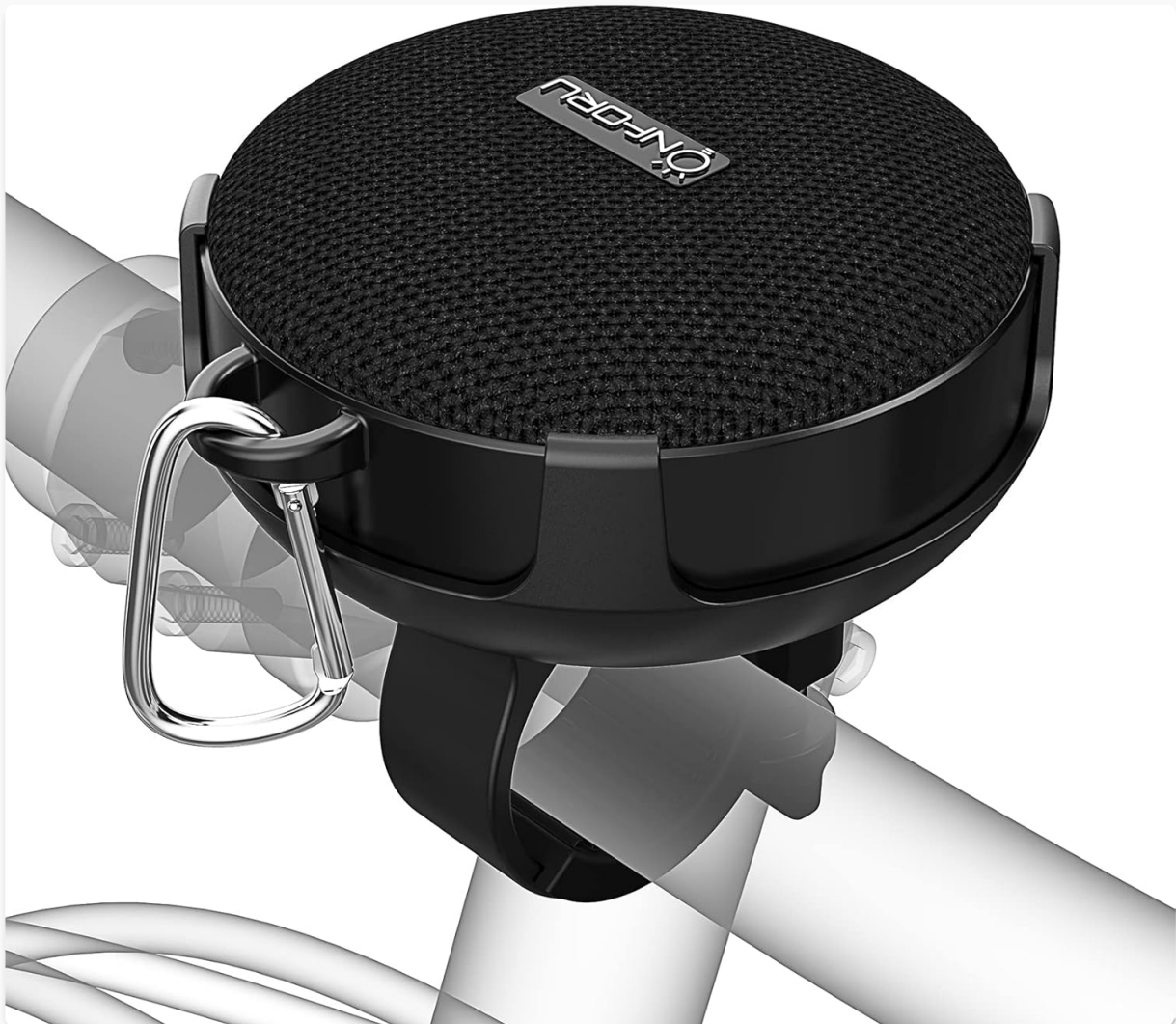
Image: The Onforu speaker attached to a bicycle handlebar using its dedicated mount, ready for use.