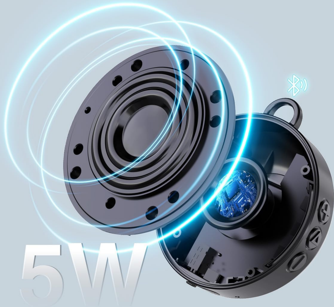
Image: An exploded view of the speaker, illustrating its internal components and emphasizing its 5W loud volume output.

High sound quality, perfect for outdoor or indoor