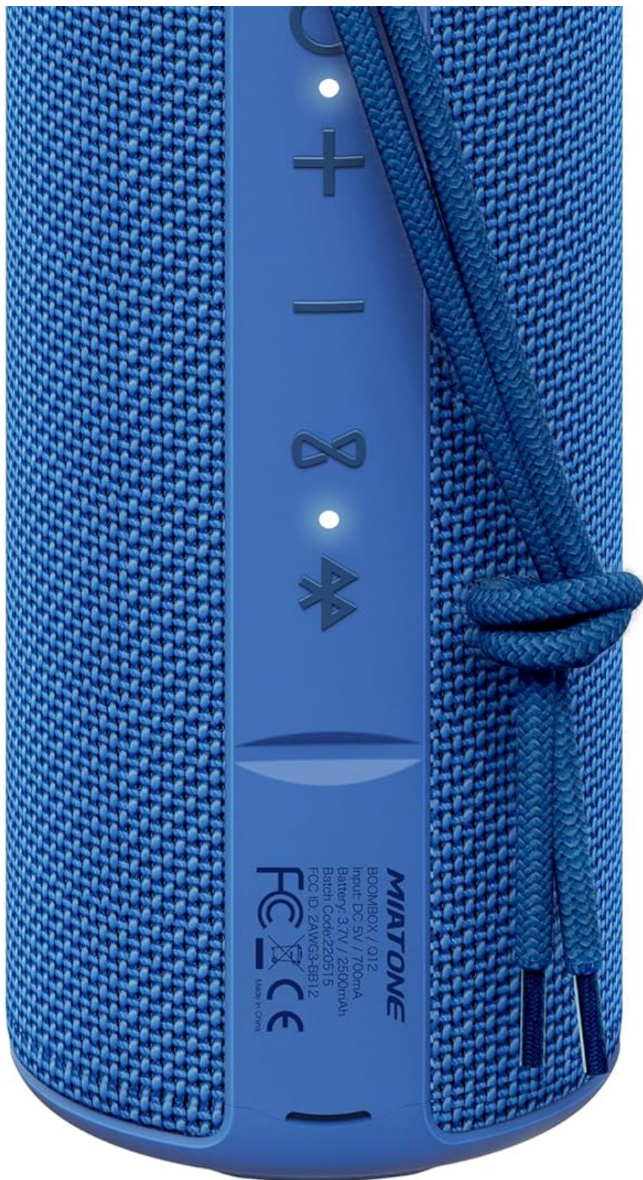
Image: MIATONE Boombox speaker in blue, shown with its charging cable and aux-in cable.