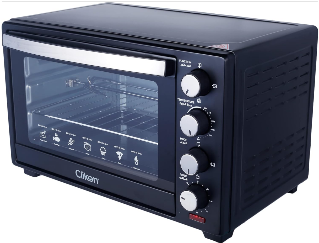
Angled view of the Clikon 48 Liter Convection Toaster Oven, showcasing the exterior design, glass door, and control panel.