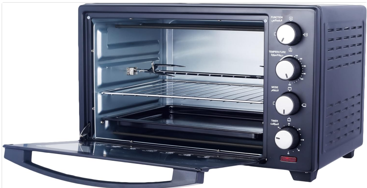
Front view of the Clikon 48 Liter Convection Toaster Oven with the door open, showing the interior, baking tray, and wire rack. Control knobs are visible on the right side.