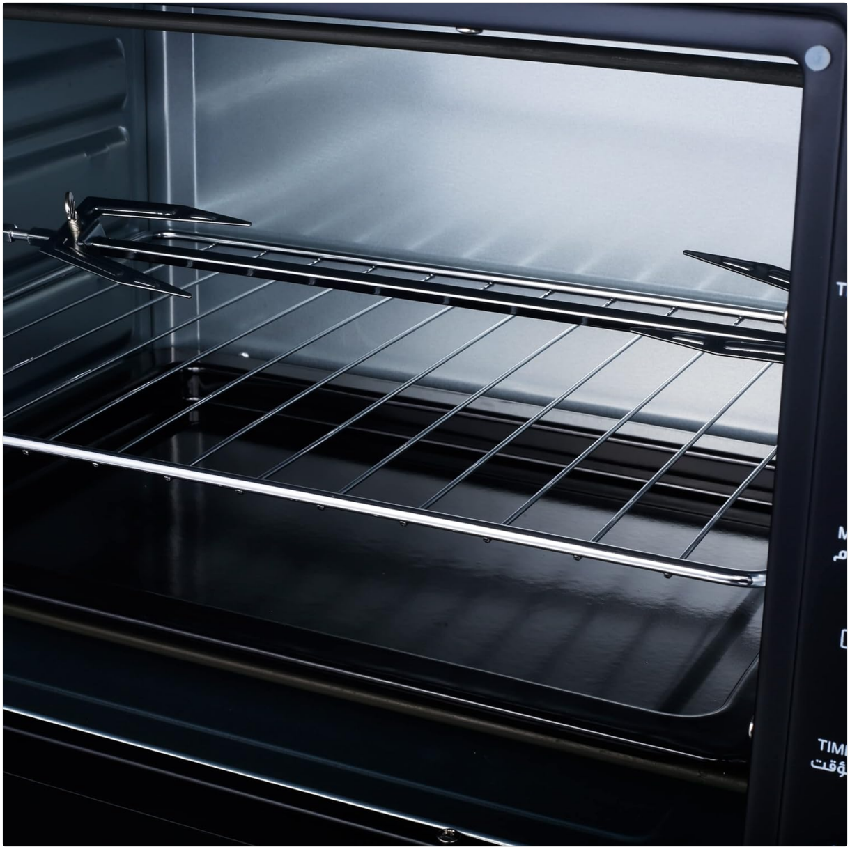
Detailed view of the interior of the Clikon Toaster Oven, highlighting the heating elements, wire rack, and baking tray.