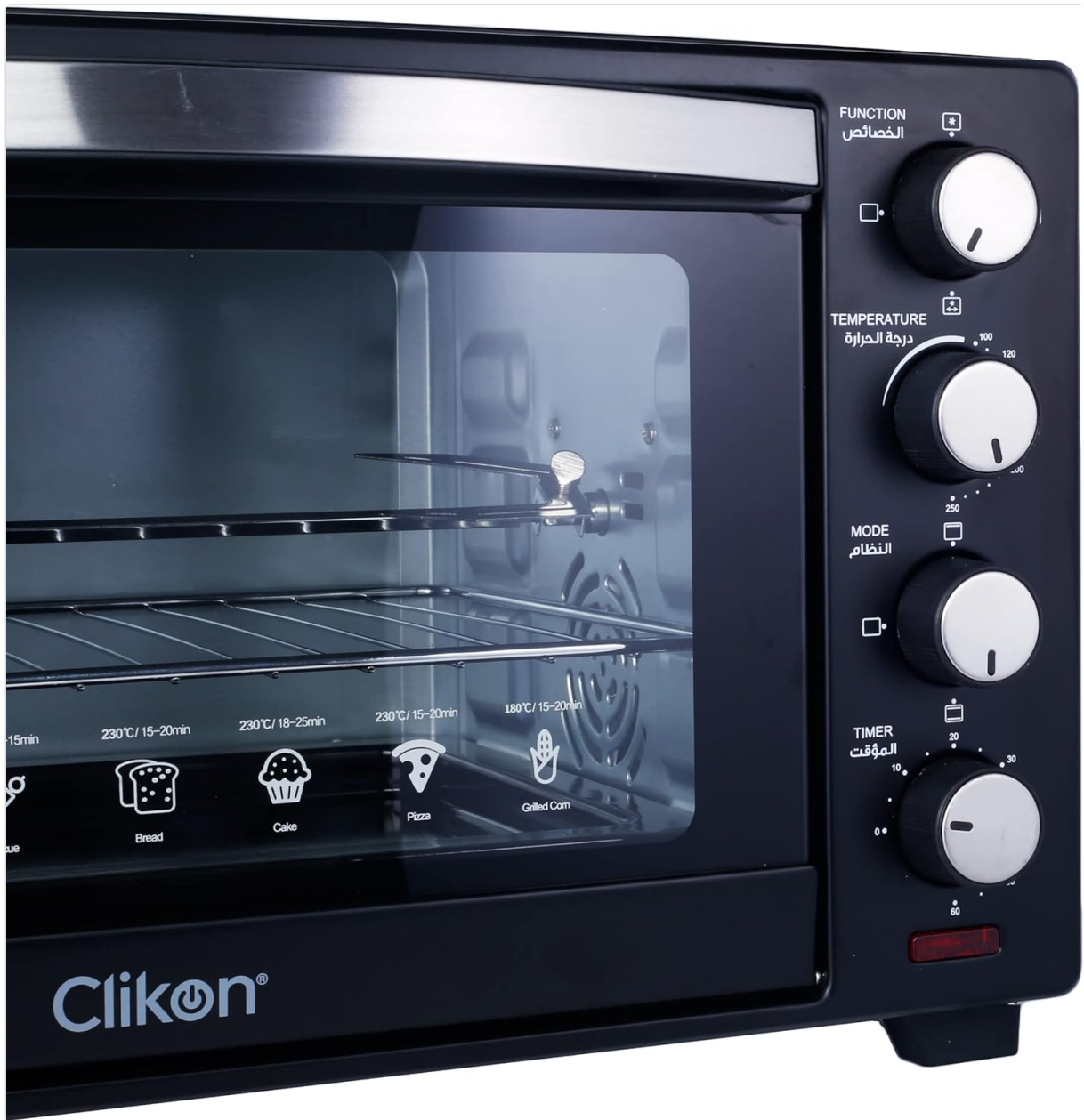
Close-up of the control panel on the Clikon Toaster Oven, displaying the Function, Temperature, Mode, and Timer knobs with their respective settings.