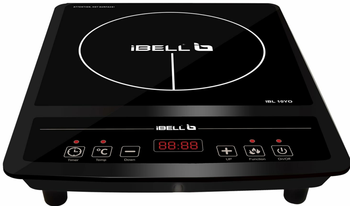
Image: IBELL 10YO Induction Cooktop with key components labeled.