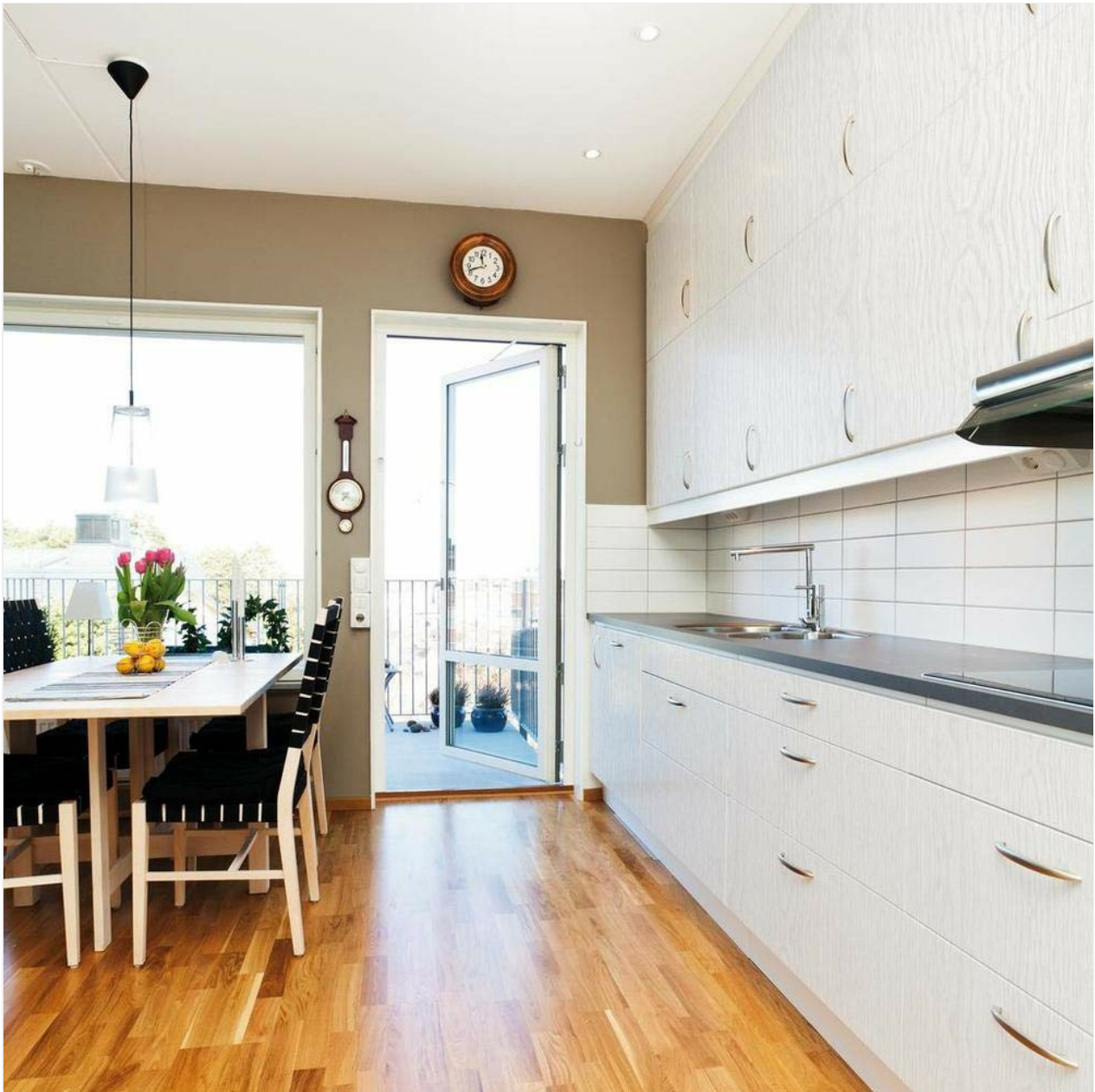
Image: Example of d-c-fix Whitewood film applied to kitchen cabinets, showcasing its transformative effect.