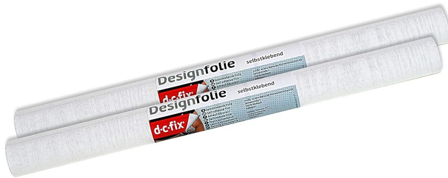
Image: Two rolls of d-c-fix Whitewood self-adhesive film, as typically found in the product packaging.