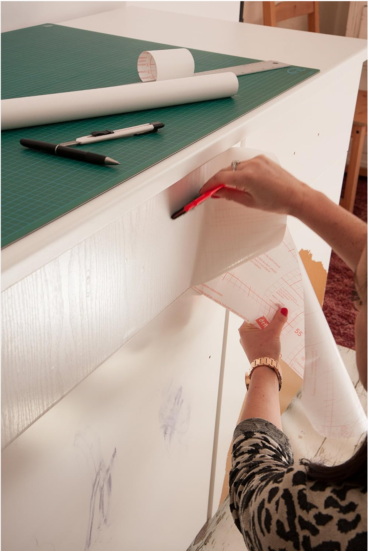
Image: A person applying the self-adhesive film to a surface, demonstrating the smoothing process.