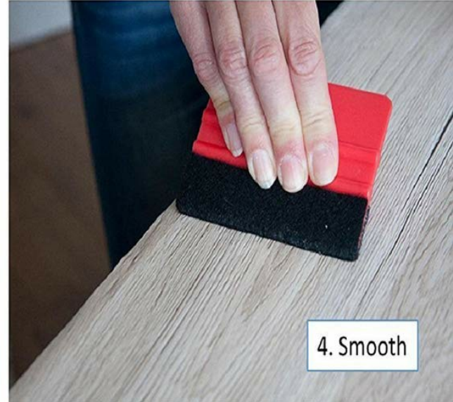
Image: A visual guide illustrating the four key steps: Measure, Cut, Peel, and Smooth.