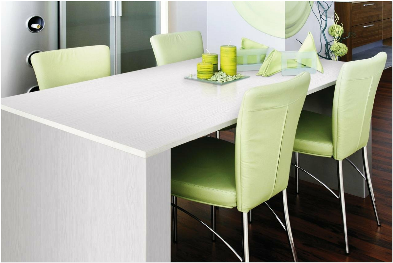
Image: A table surface covered with d-c-fix Whitewood film, demonstrating its use on furniture.