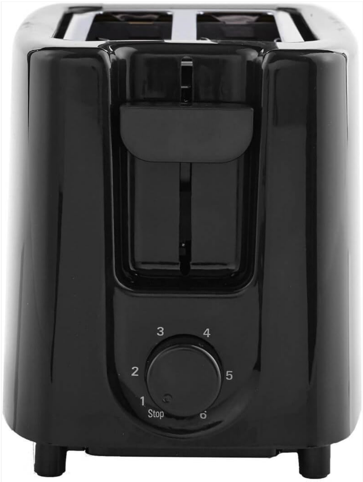
Image Description: Front view of the black Continental Electric CETT019 2-Slice Toaster, showing the two wide slots, the browning control dial, and the lever.