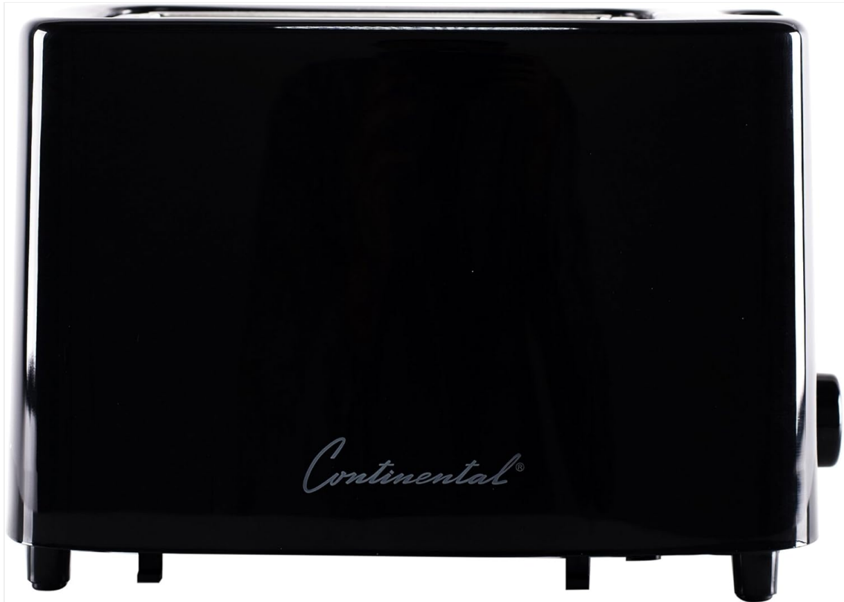
Image Description: Close-up view of the toaster's side, highlighting the browning control dial with settings from 1 to 6 and the cancel button, along with the toast lever.