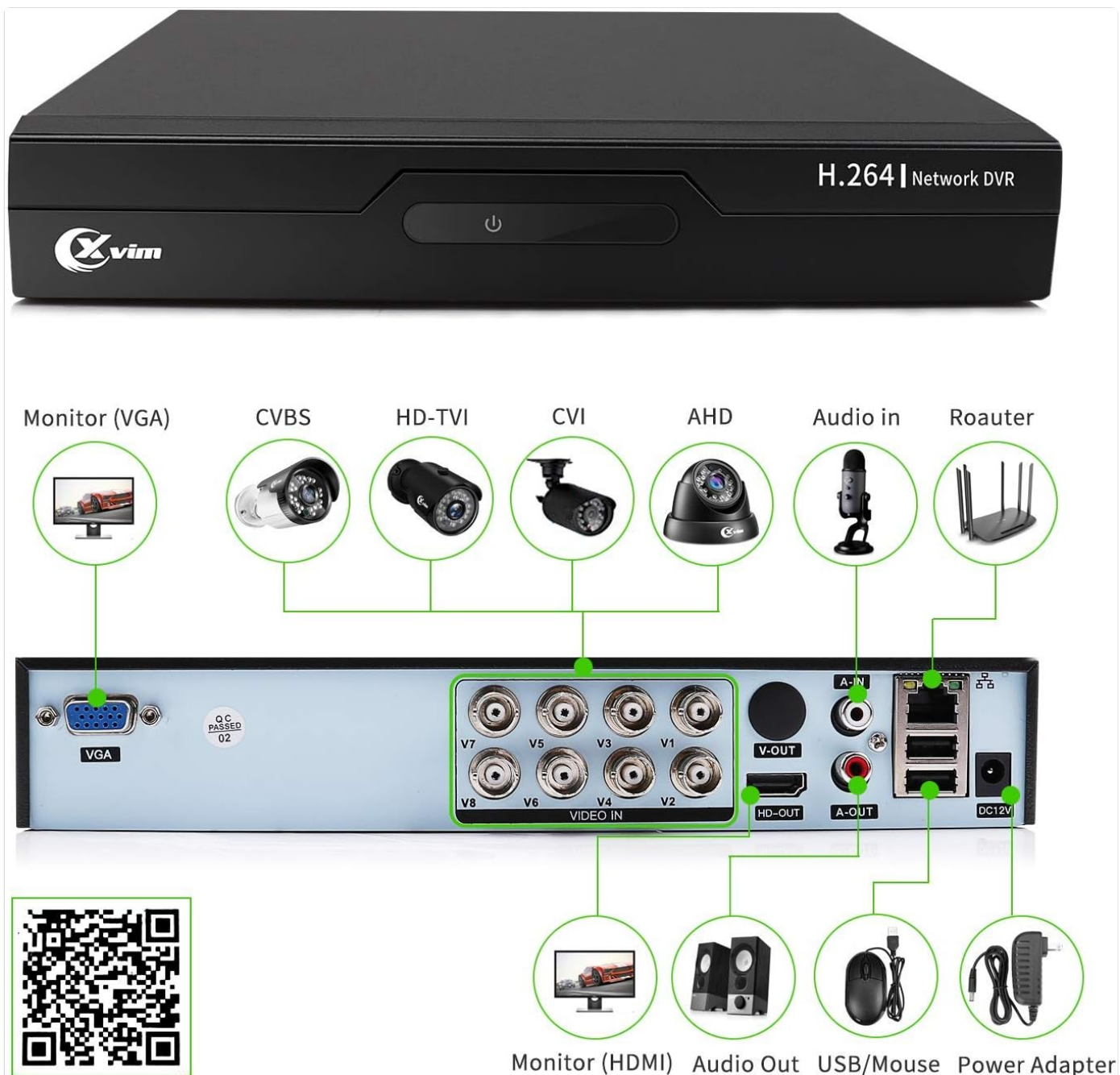
Image: Detailed view of the DVR's rear panel with labeled ports for cameras, audio, video output, and network connection.