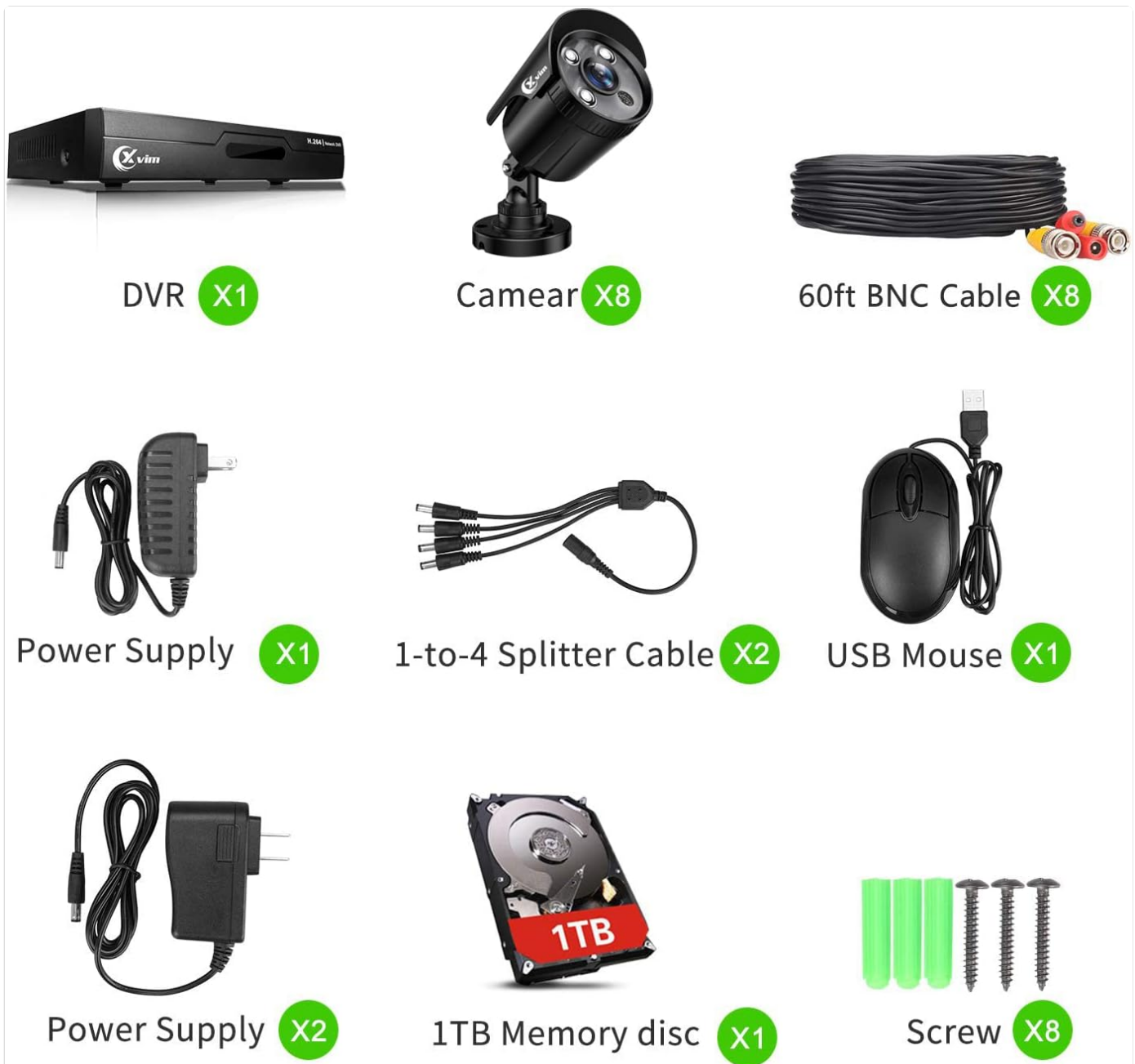
Image: All components included in the XVIM 8CH 1080P Wired Security Camera System package.