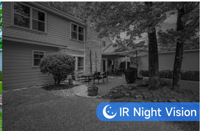
Image: Examples of camera placement in indoor (kitchen, living room) and outdoor (doorway, courtyard) settings.