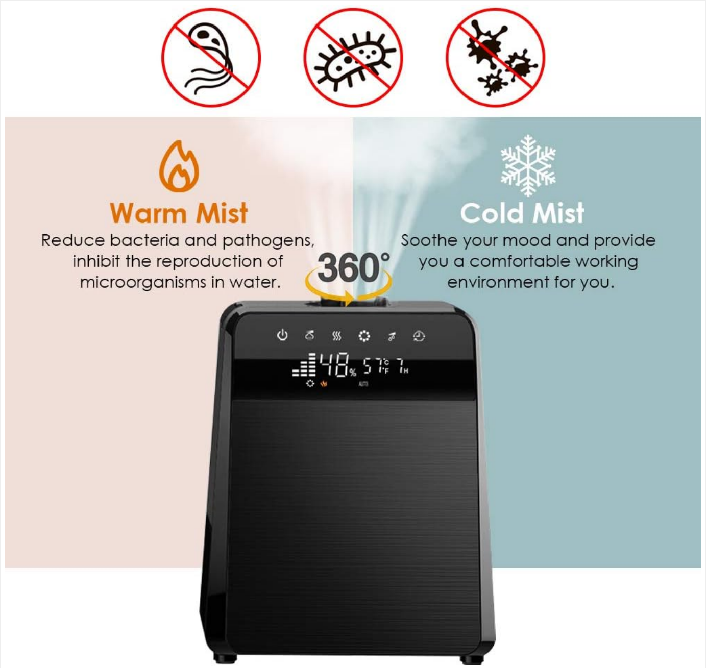
Figure 4.2: Warm and Cool Mist Functionality. This image highlights the humidifier's ability to produce both warm and cool mist, with a 360-degree rotatable nozzle for optimal mist direction.