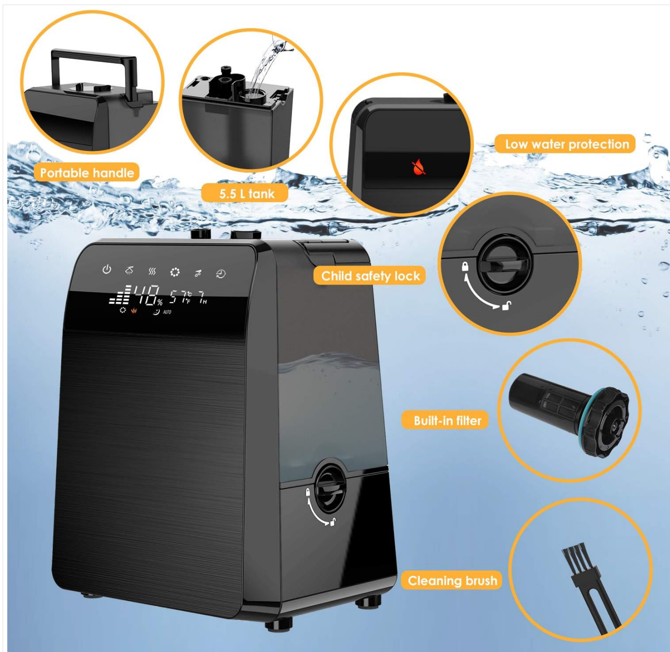
Figure 2.1: Humidifier Components. This image illustrates the various parts of the humidifier, including the portable handle for easy transport, the large 5.5-liter water tank, the low water protection sensor, a child safety lock mechanism, the built-in water filter, and the included cleaning brush.