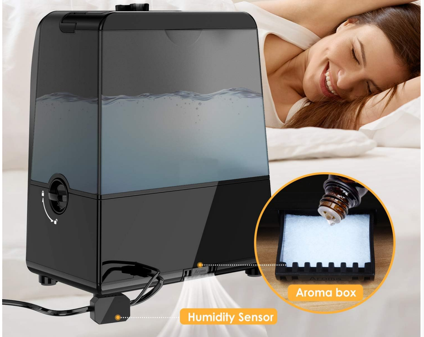
Figure 4.4: Adding Essential Oils. This image demonstrates how to add essential oils to the humidifier by placing drops onto the pad within the designated aroma box, located at the back of the unit.

Add essential oil drops to the aroma box for a relaxing touch of aromatherapy through your mist.