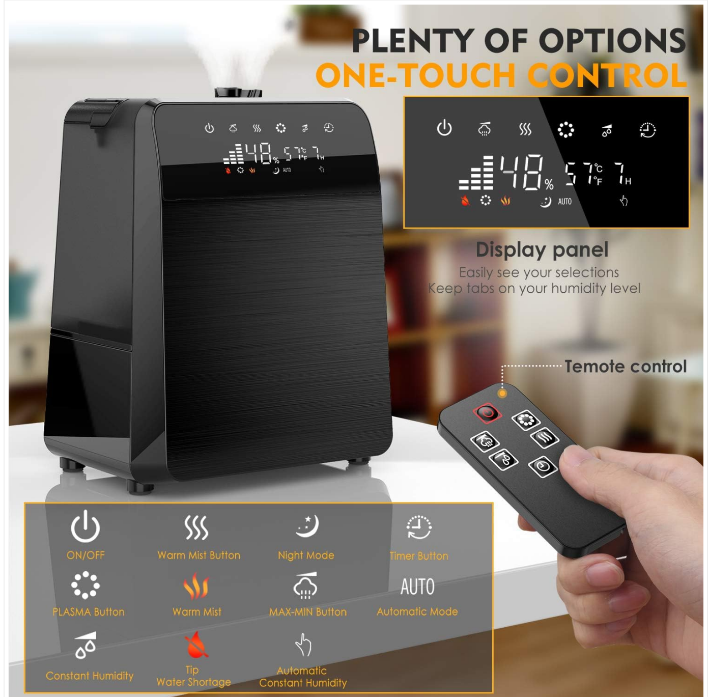
Figure 4.1: Control Panel and Remote Control. This image displays the humidifier's LED touch control panel and the accompanying remote control, highlighting buttons for power, mist settings, warm mist, night mode, timer, and automatic humidity control.

Plug the humidifier into a standard 120V AC outlet. The LED display will illuminate.