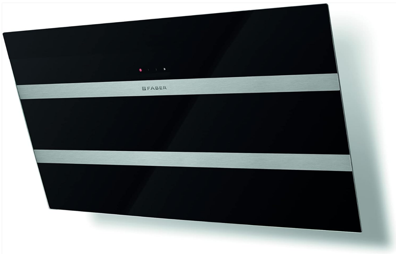
Figure 1: Front view of the FABER STEELMAX 800 Inclined Decorative Hood.

The FABER STEELMAX 800 is an 80cm inclined decorative hood, designed with stainless steel and black glass. It features advanced extraction capabilities and user-friendly controls to enhance your kitchen environment.