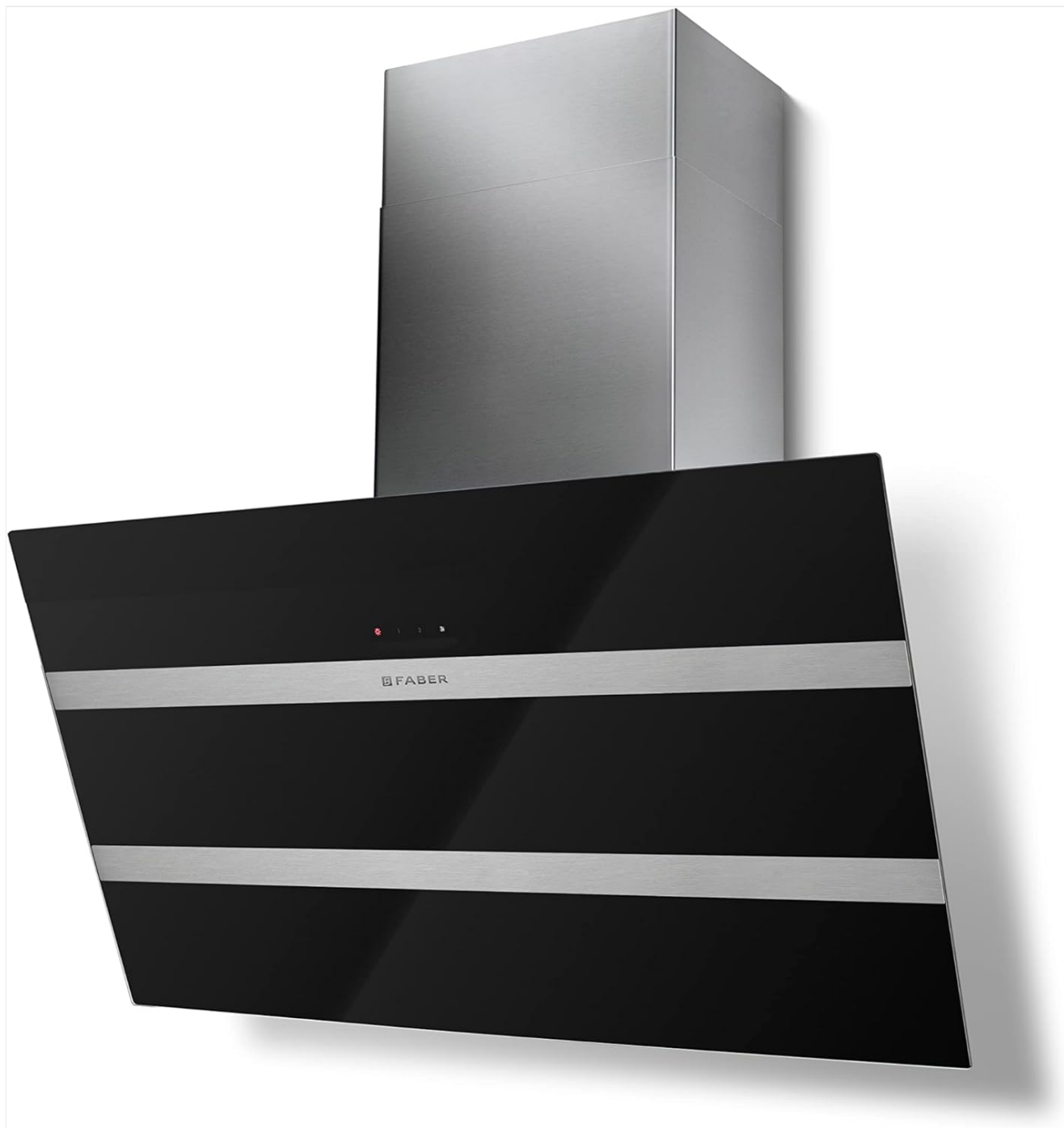
Figure 3: The hood shown with its stainless steel chimney installed.