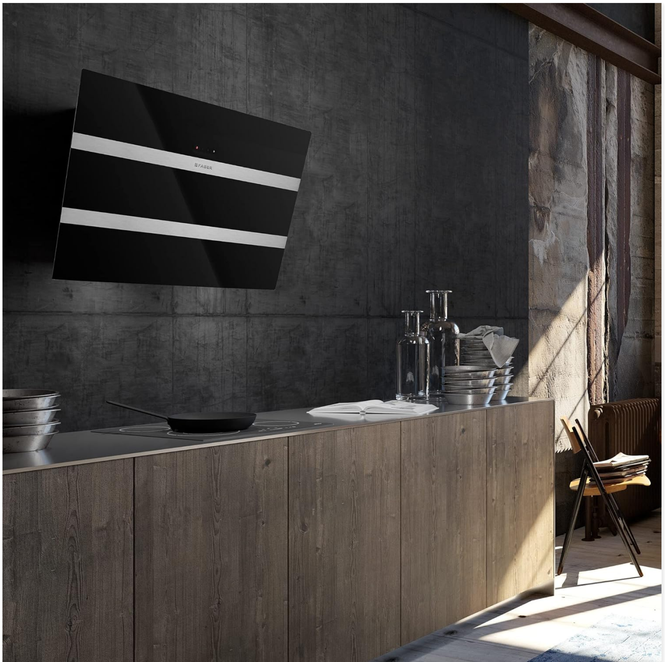
Figure 2: The FABER STEELMAX 800 hood seamlessly integrated into a kitchen setting.