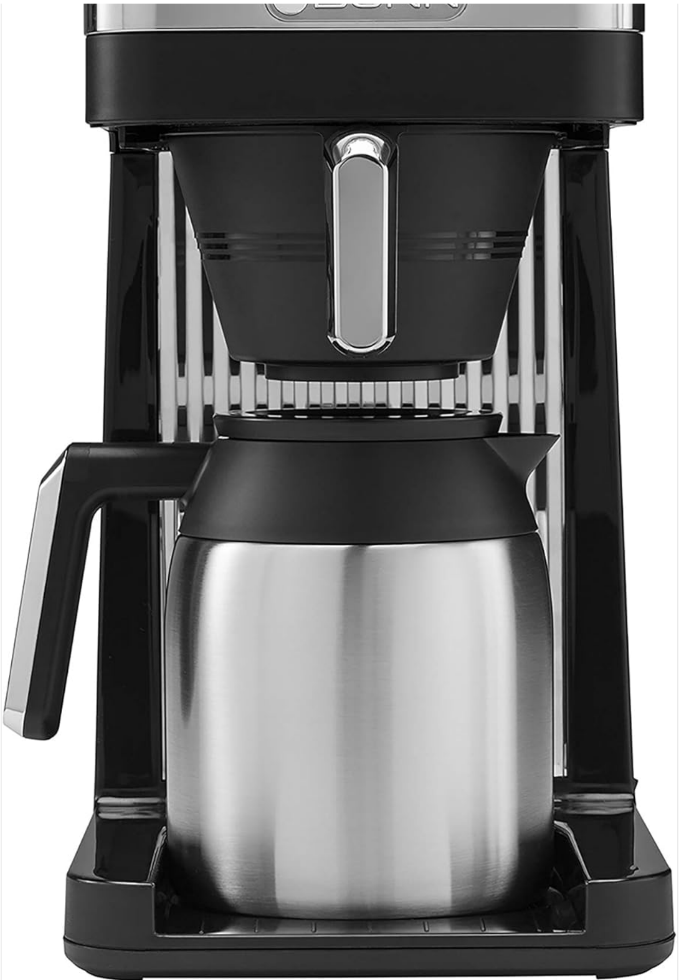
Figure 2.1: Front view of the BUNN CSB3TD Coffee Maker, showing its sleek design and stainless steel thermal carafe.