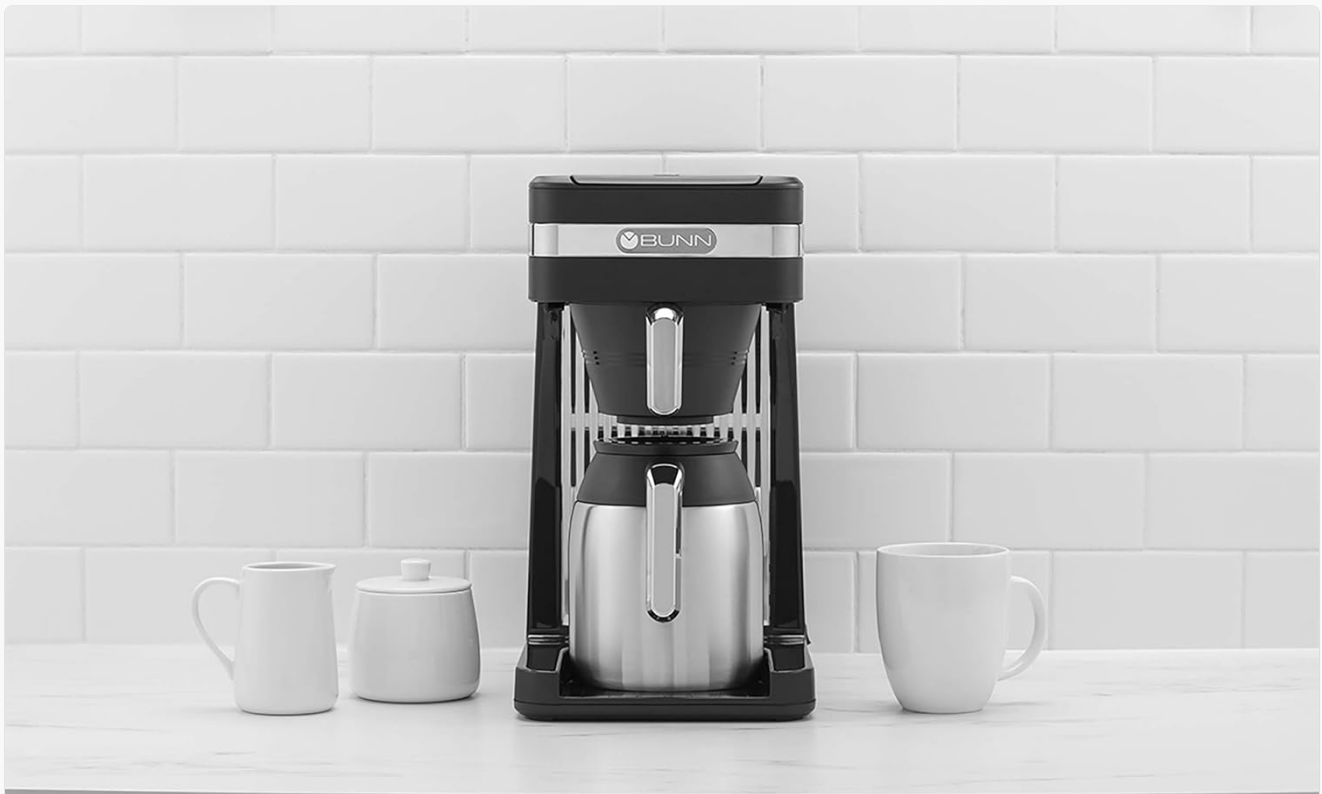
Figure 4.1: Proper handling of the thermal carafe for cleaning and serving.