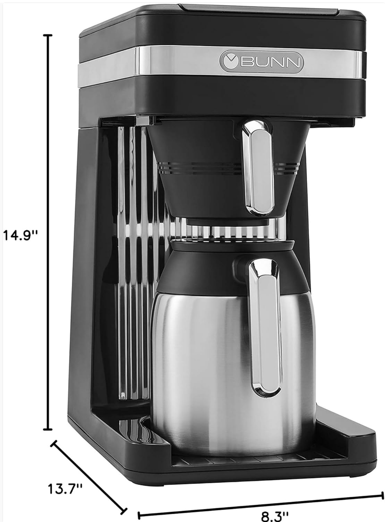
Figure 6.1: Product dimensions for the BUNN CSB3TD coffee maker.