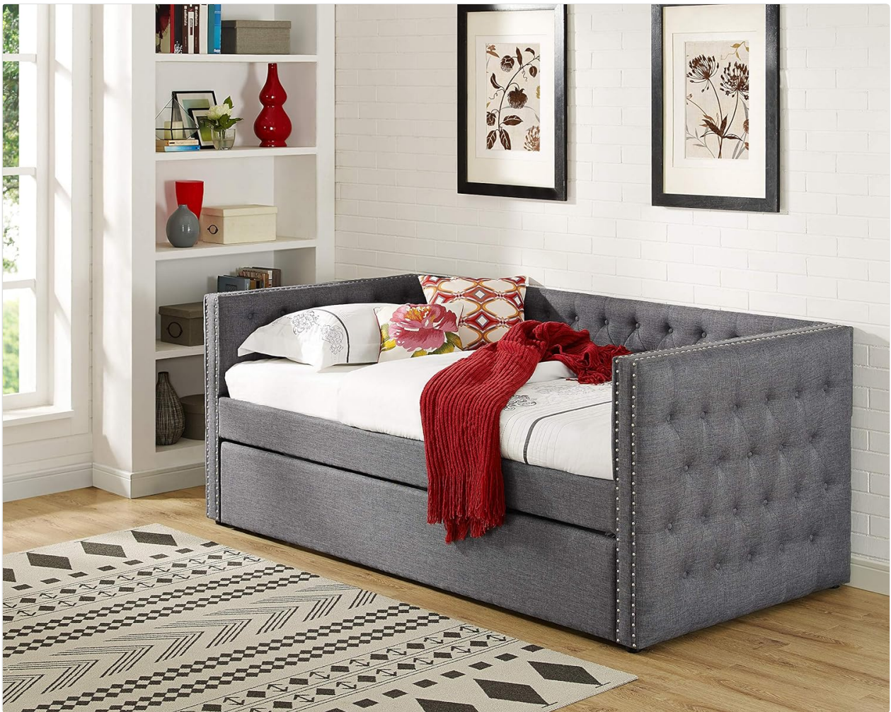
Figure 3.1: Fully assembled Laura Tufted Daybed with Trundle in Grey.