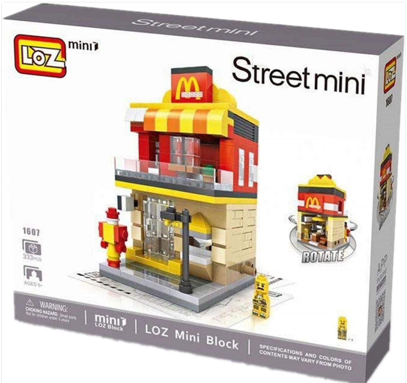
Image 3.1: The product packaging for the LOZ Mini Block Street Mini Series Fast Food Burger Building Set, Model 1607.