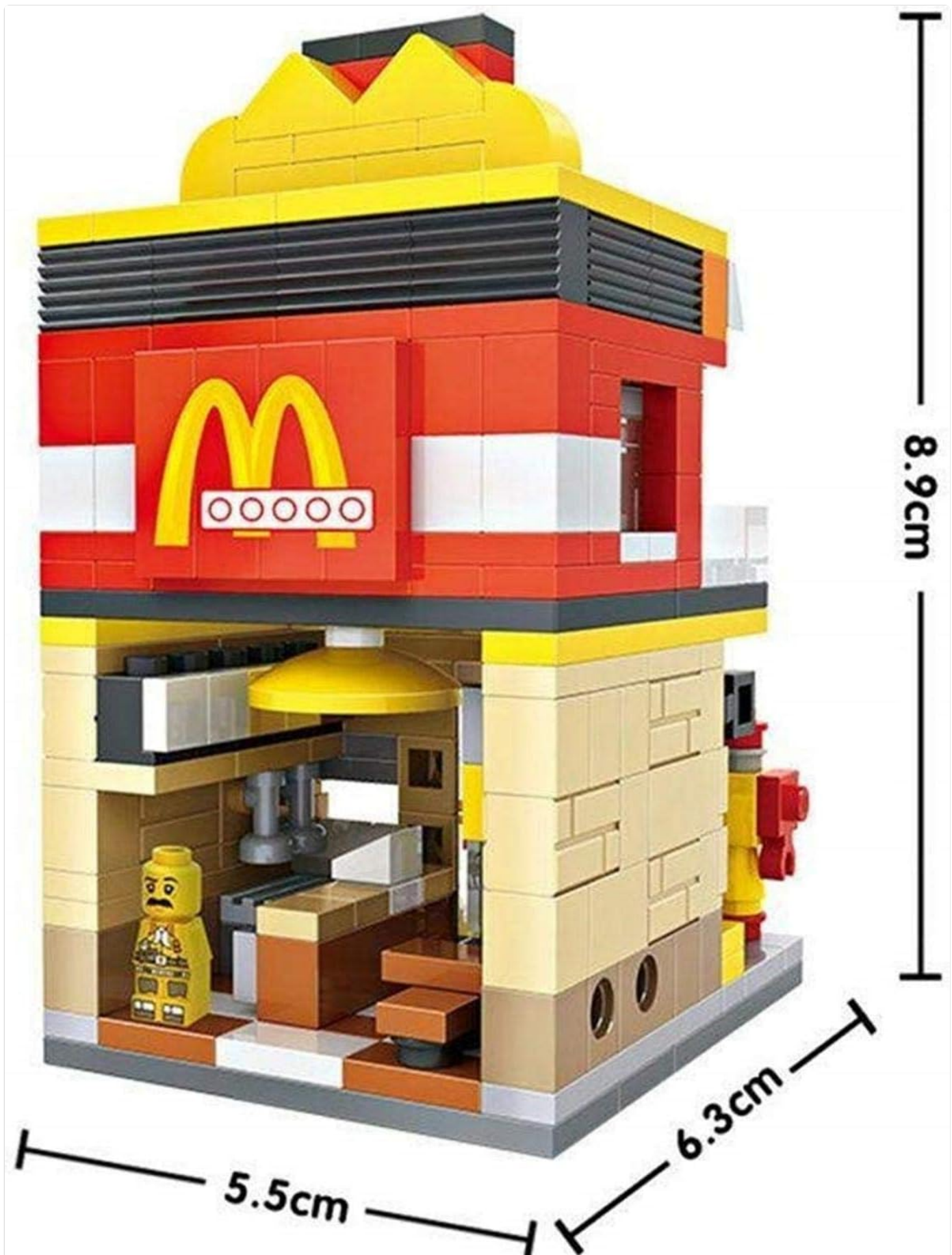
Image 4.1: A detailed view of the assembled Fast Food Burger restaurant, showing its dimensions.