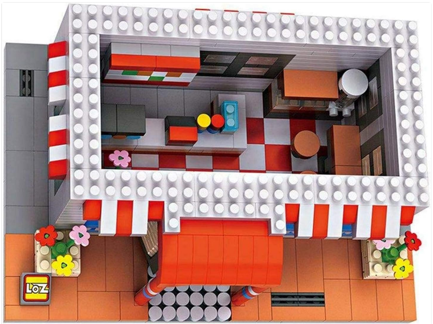
Image 4.2: An aerial view showcasing the interior layout of the Fast Food Burger restaurant model.