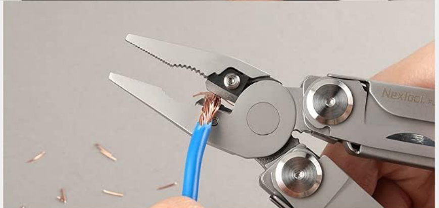
Image 4.1.1: Demonstrates the use of needle-nose pliers, standard pliers, and wire cutters on various materials.

YG8硬質合金（硬度> HRA86）、直径2.5mm のBVR電線の切断に使用 できます。