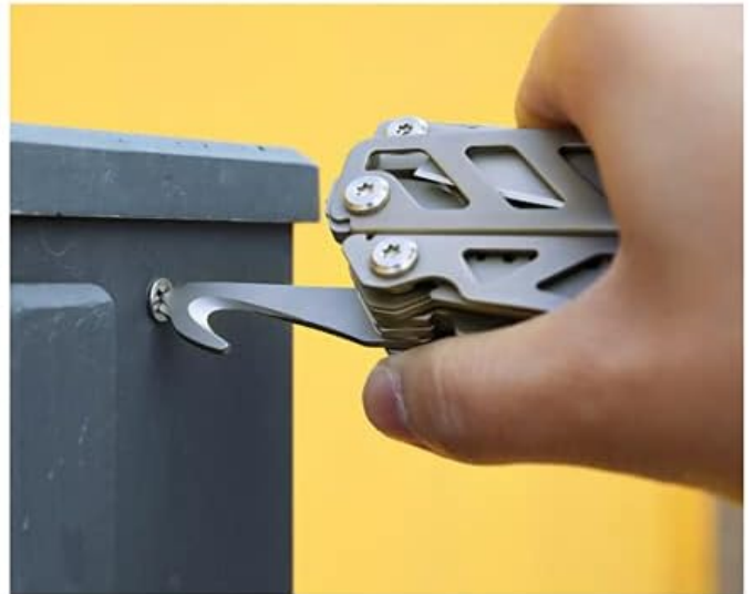
Image 4.4.1: Shows the can opener, glass breaker, and Phillips screwdriver in use.