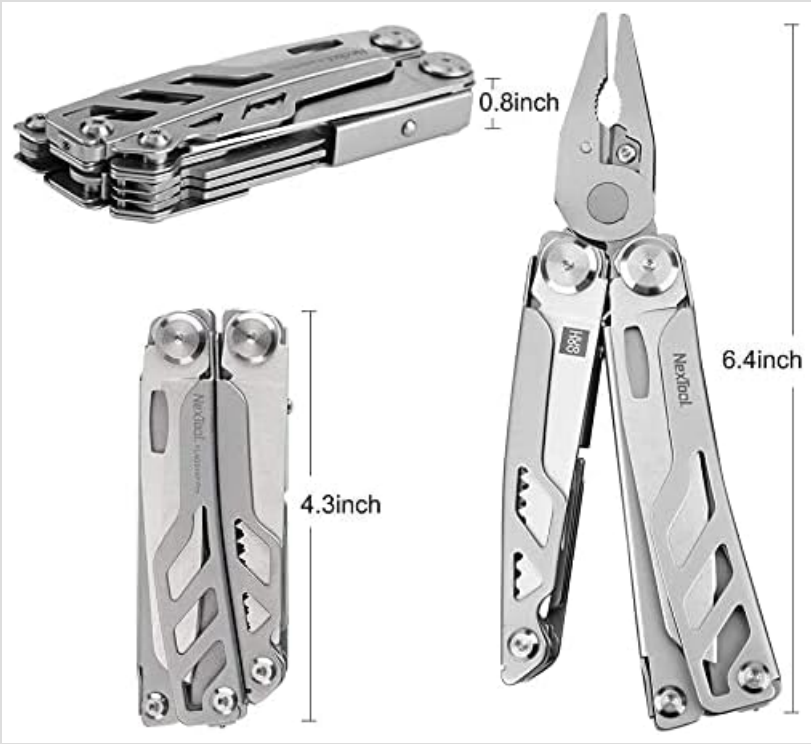
Image 3.1: Product dimensions, showing the multi-tool folded and open with measurements.