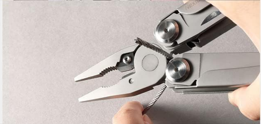
Image 4.1.2: Shows the hard wire cutter and thick wire cutter in action.

30Cr13ステンレス鋼（硬度：> HRC50）、直径2.5mmの鋼線の切断に使用できます。