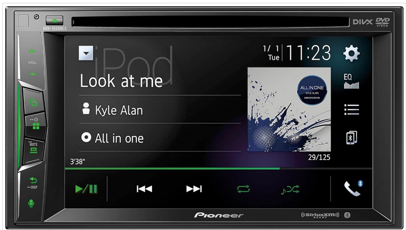
Image: The Pioneer AVH-1550NEX screen showing a music playback interface, likely from an iPod or USB source. It displays album art, song title, artist, and playback controls (play/pause, skip tracks).