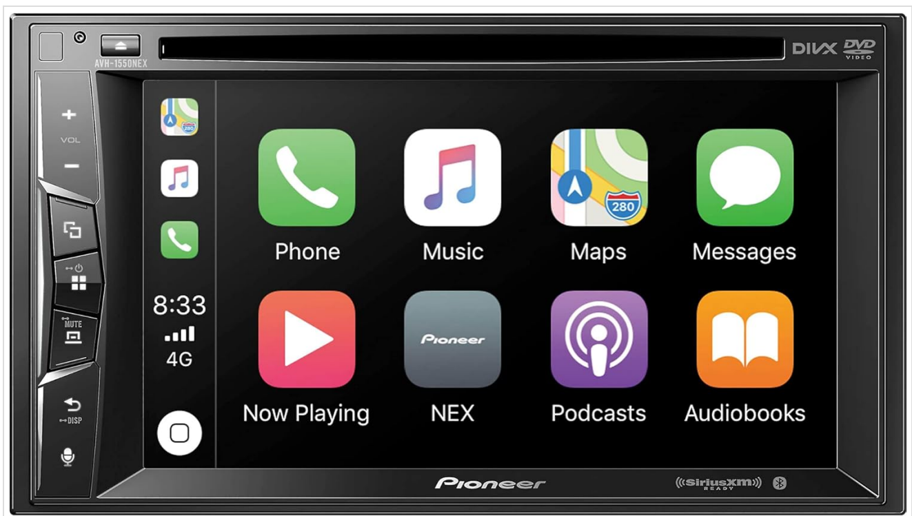
Image: The Pioneer AVH-1550NEX screen showing the Apple CarPlay interface. Icons for Phone, Music, Maps, Messages, Now Playing, NEX, Podcasts, and Audiobooks are clearly visible, indicating seamless iPhone integration.