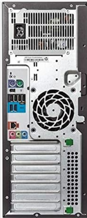
Figure 2: Rear view of the HP Z420 Workstation, illustrating the various I/O ports including USB, audio, Ethernet, and video outputs.