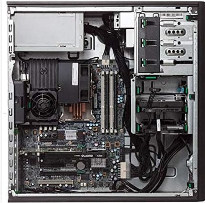
Figure 3: Internal view of the HP Z420 Workstation, highlighting the motherboard, RAM slots, and drive bays, which should be kept clear of dust.