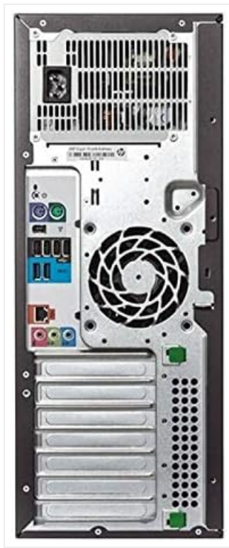
Figure 2: Rear panel of the HP Z420 Workstation, showing various ports for connectivity.