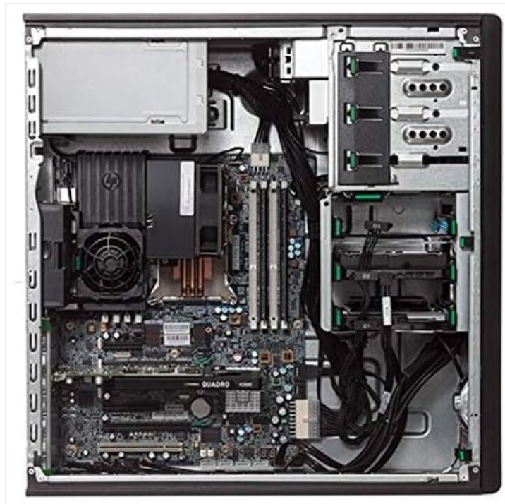
Figure 3: Internal view of the HP Z420 Workstation, showing the motherboard, RAM slots, and drive bays.