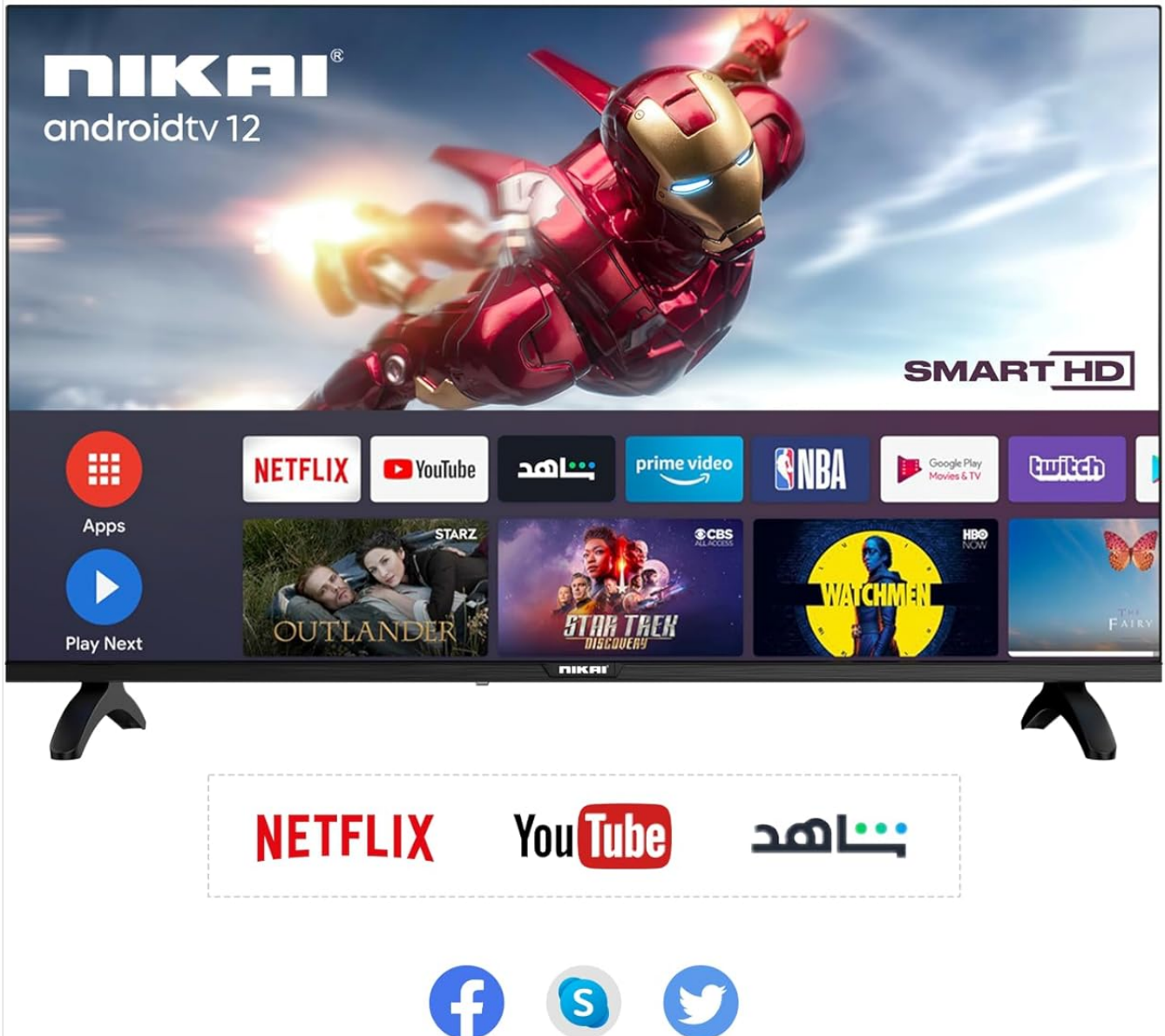
Figure 5.1: Smart TV Interface with Applications

Why go out when you have it all at home? Enjoy Netflix, Prime Video, YouTube, and web browsing.