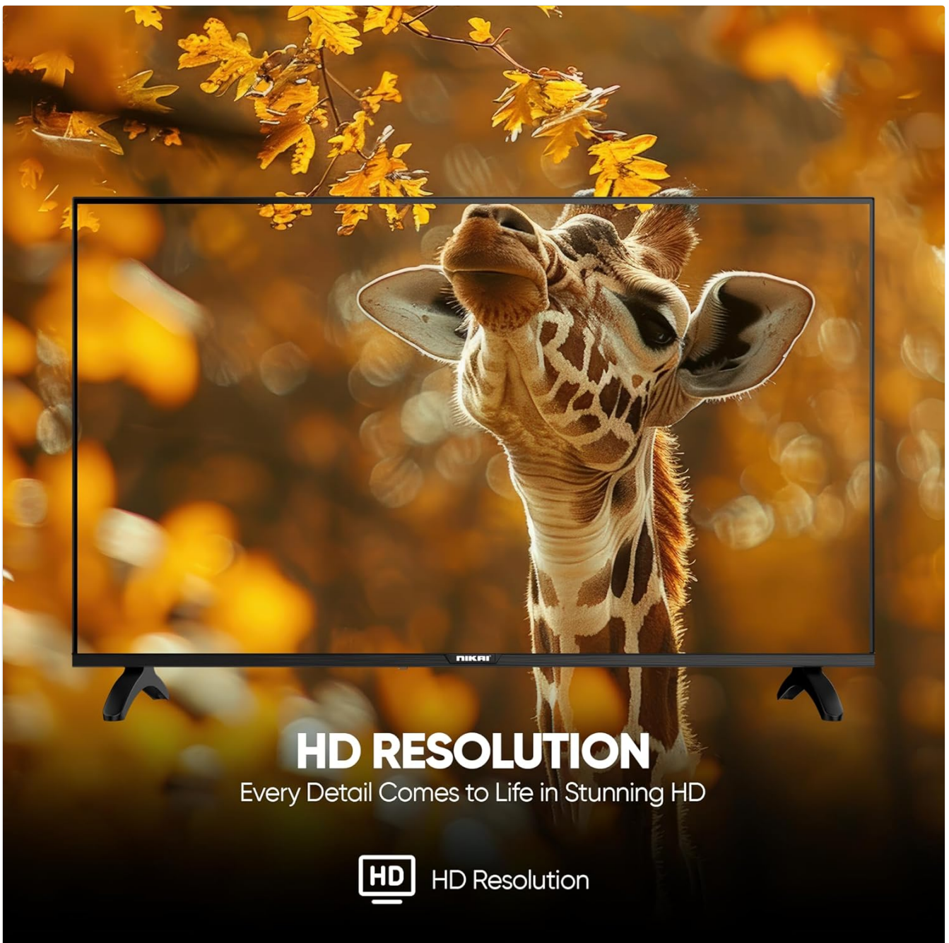
Figure 5.2: High Definition Visual Quality