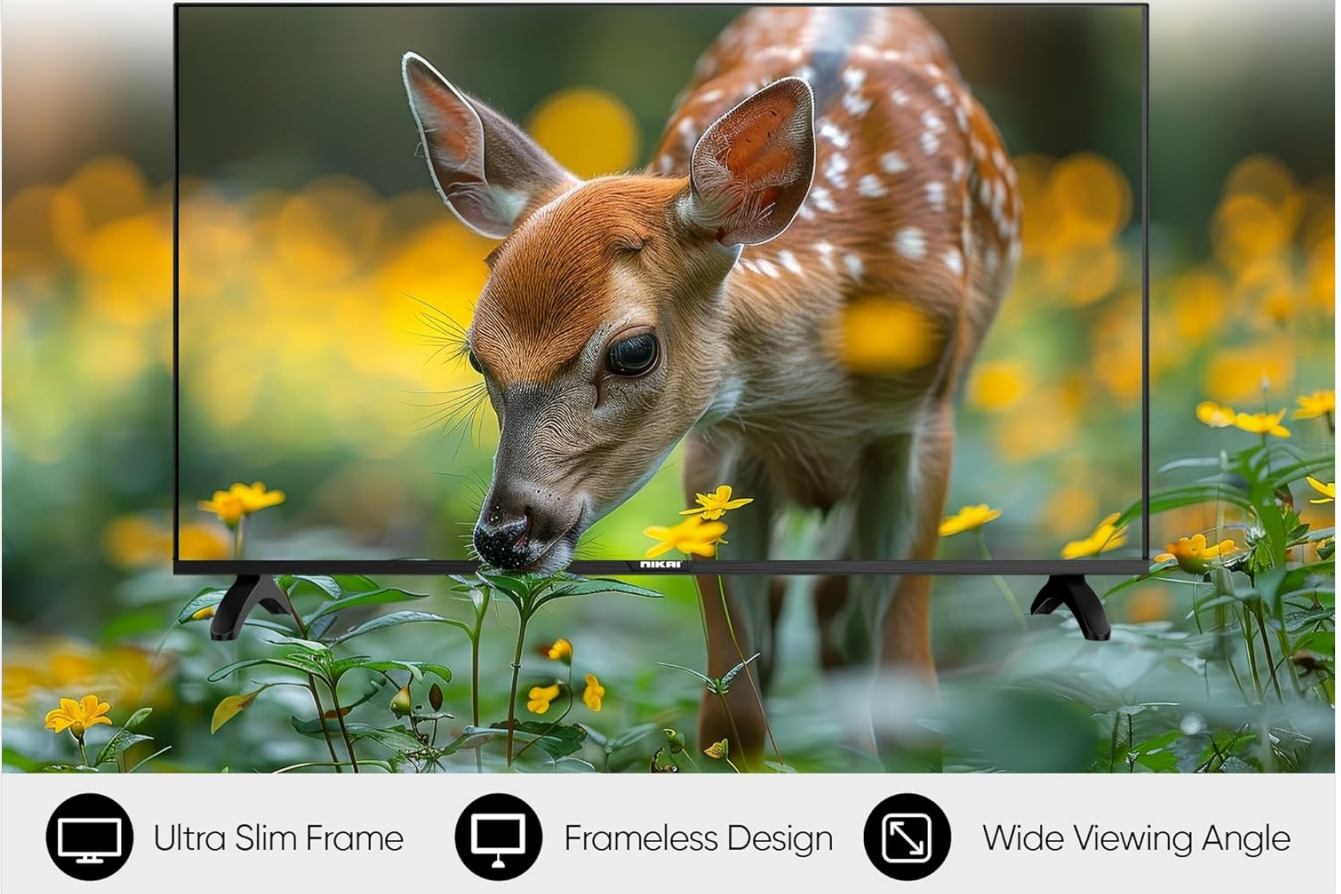
Figure 1.2: Sleek and Bezel-Free Design

Experience frameless elegance with our Ultra Slim Android TV, a seamless blend of style and technology.