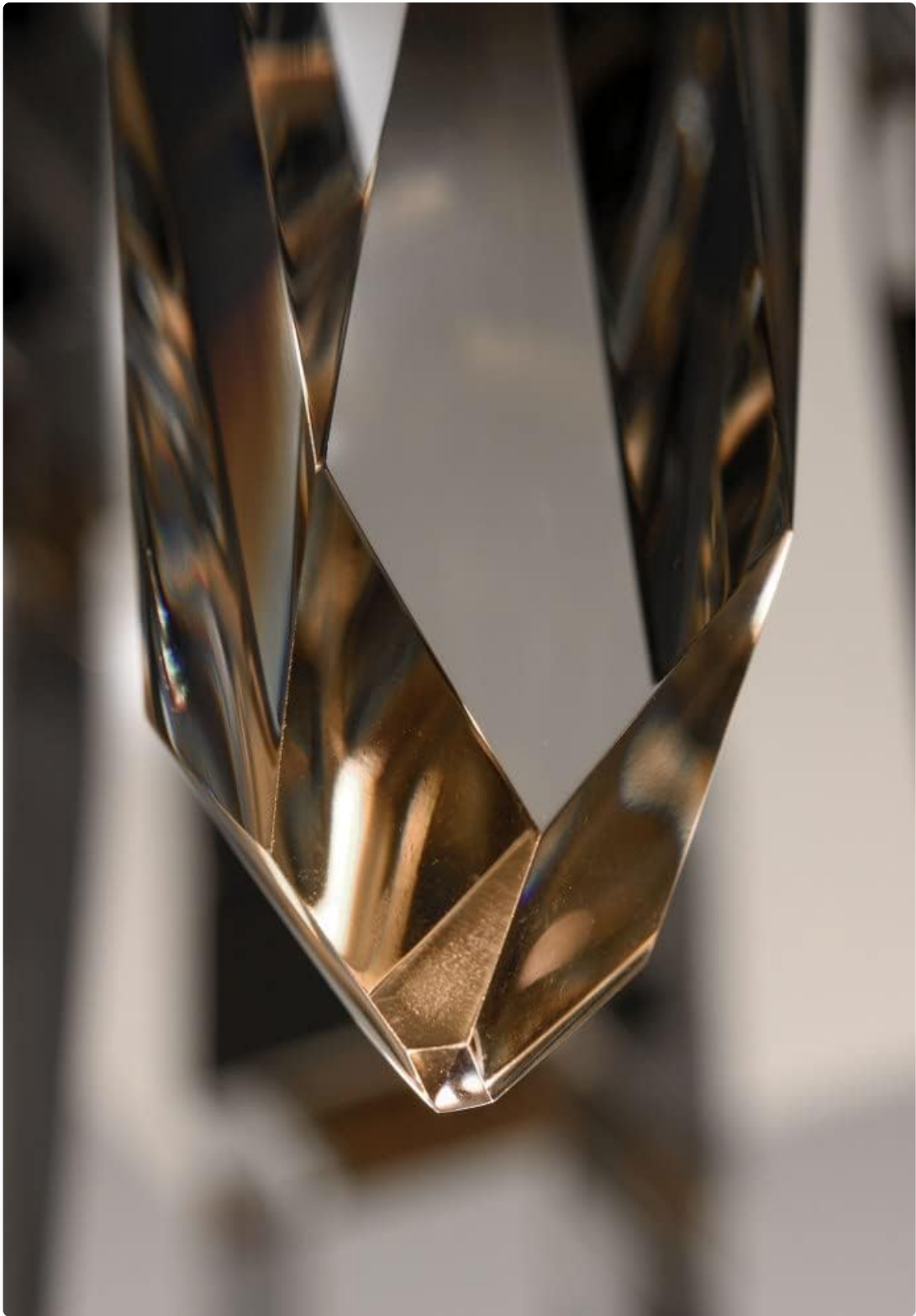
Figure 5.1: A detailed view of the clear beveled crystal stalactites, highlighting the intricate facets that diffuse light.