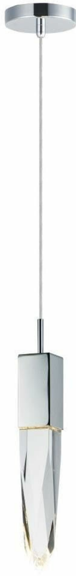
Figure 1.1: ET2 Quartz E31242-20PC LED Mini Pendant Light, showcasing its illuminated crystal design.