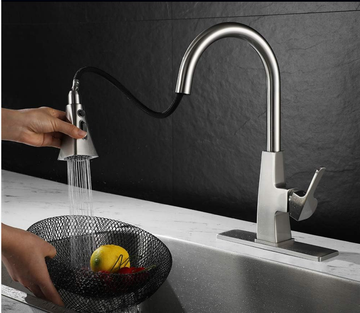
Figure 6: Faucet in sprayer mode.