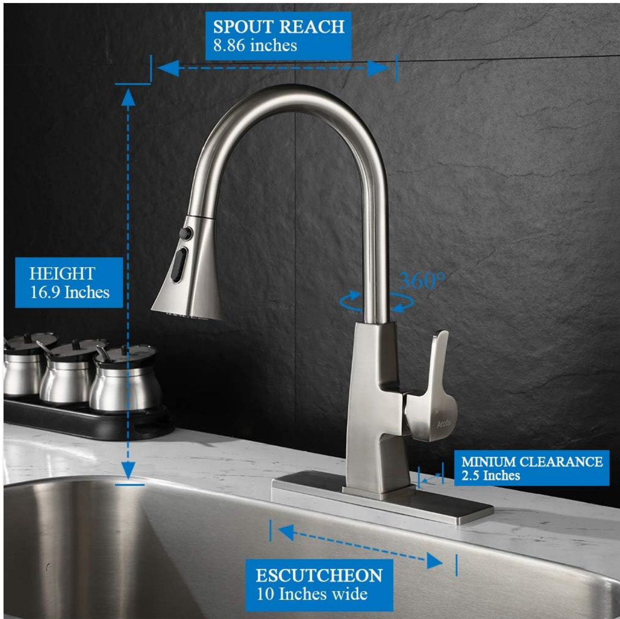
Figure 1: Arofa A03LY Faucet with key dimensions.