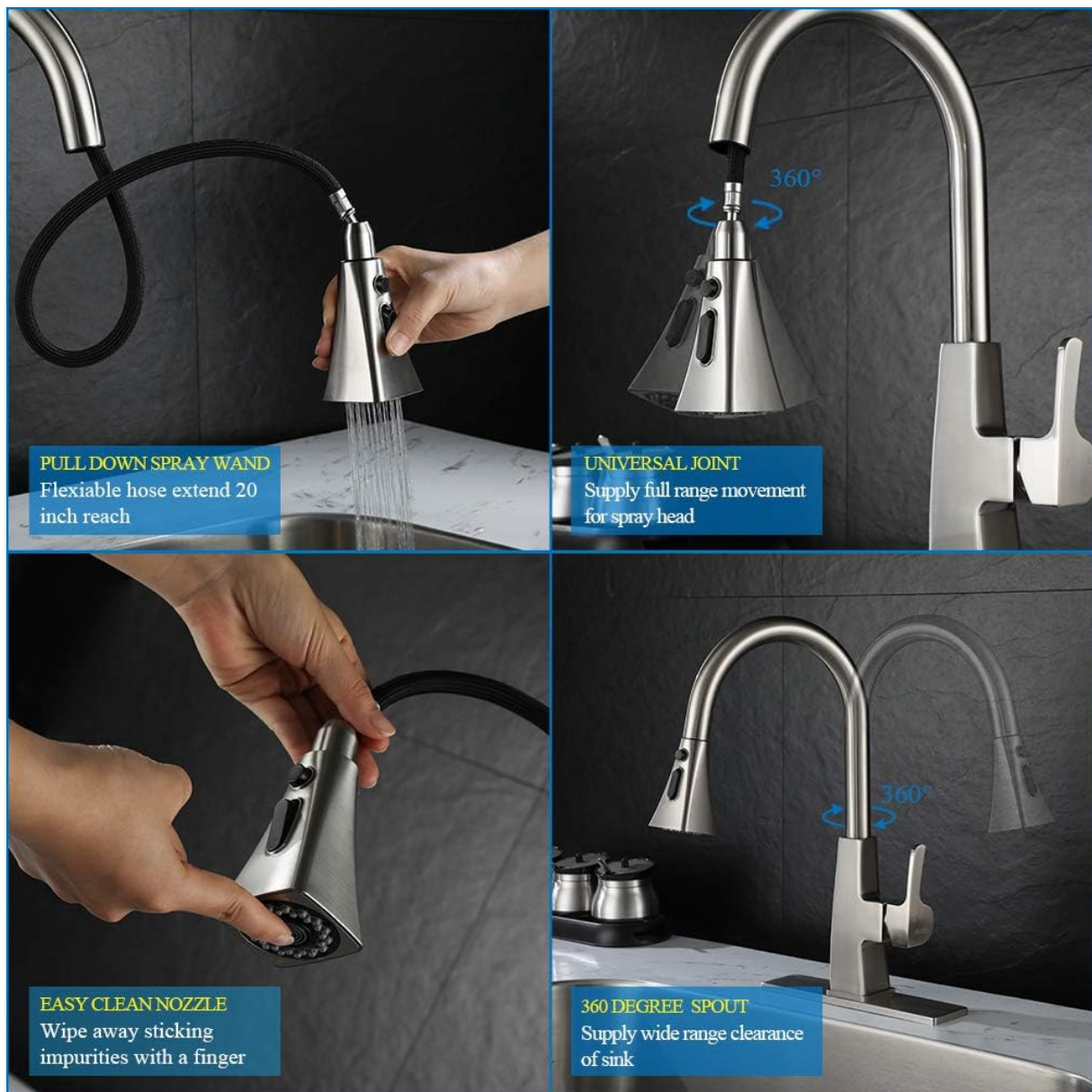
Figure 4: Sprayer head features and movement.