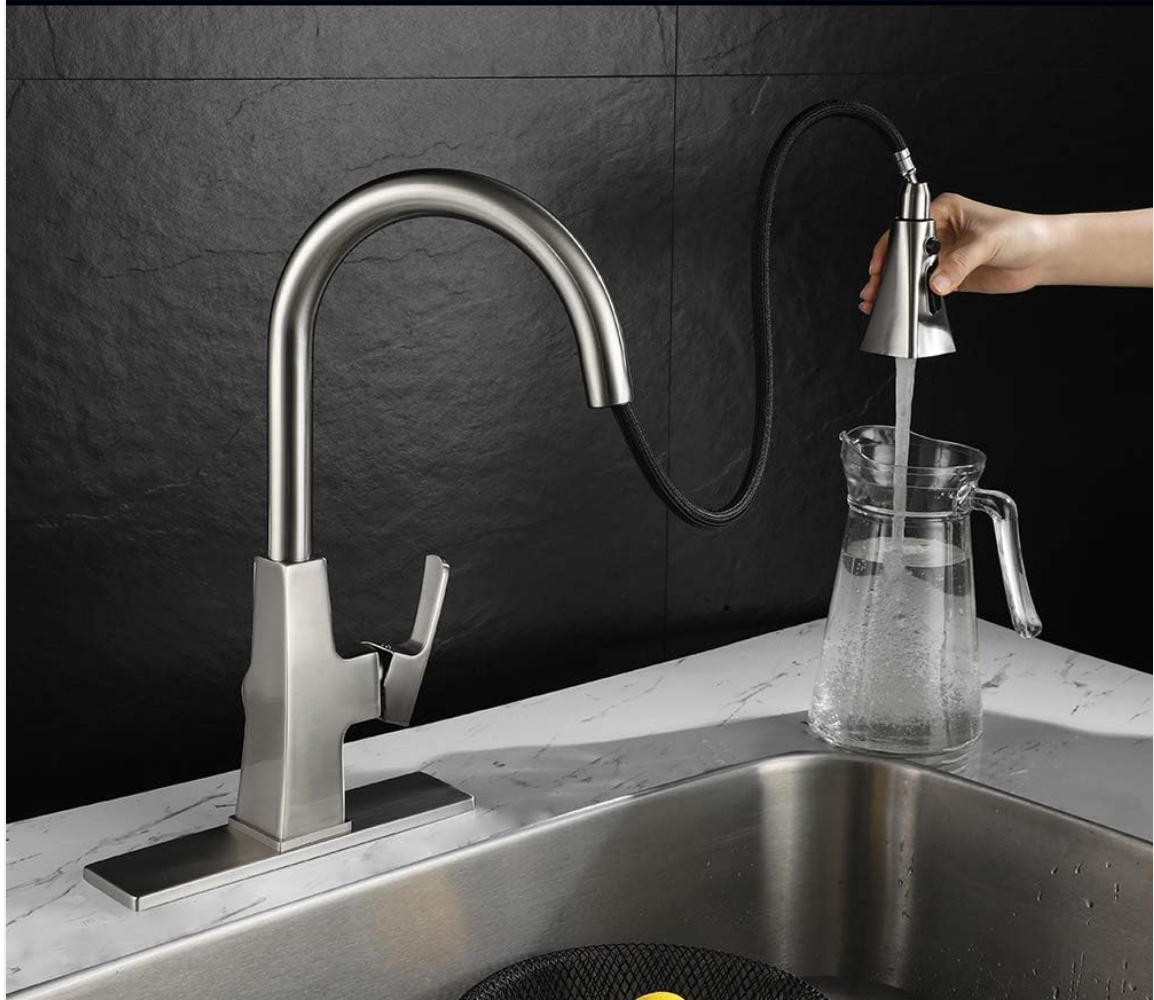
Figure 5: Faucet in stream mode.