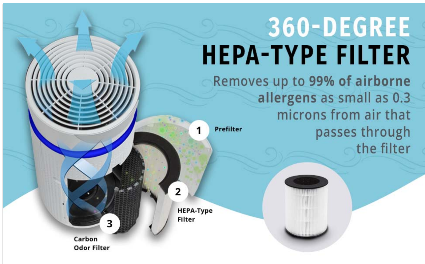
Image: Visual representation of the filter's compatibility with HoMedics TotalClean Tower Air Purifiers, models AP-T20 and AP-T20WT.