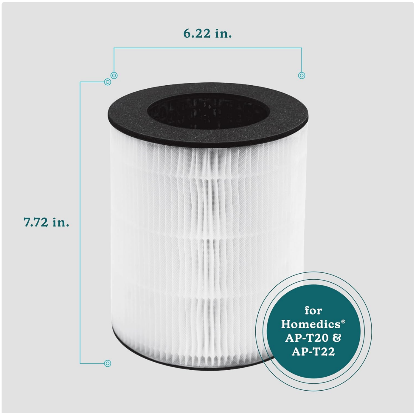
Image: Technical drawing illustrating the dimensions of the replacement filter for accurate fit.