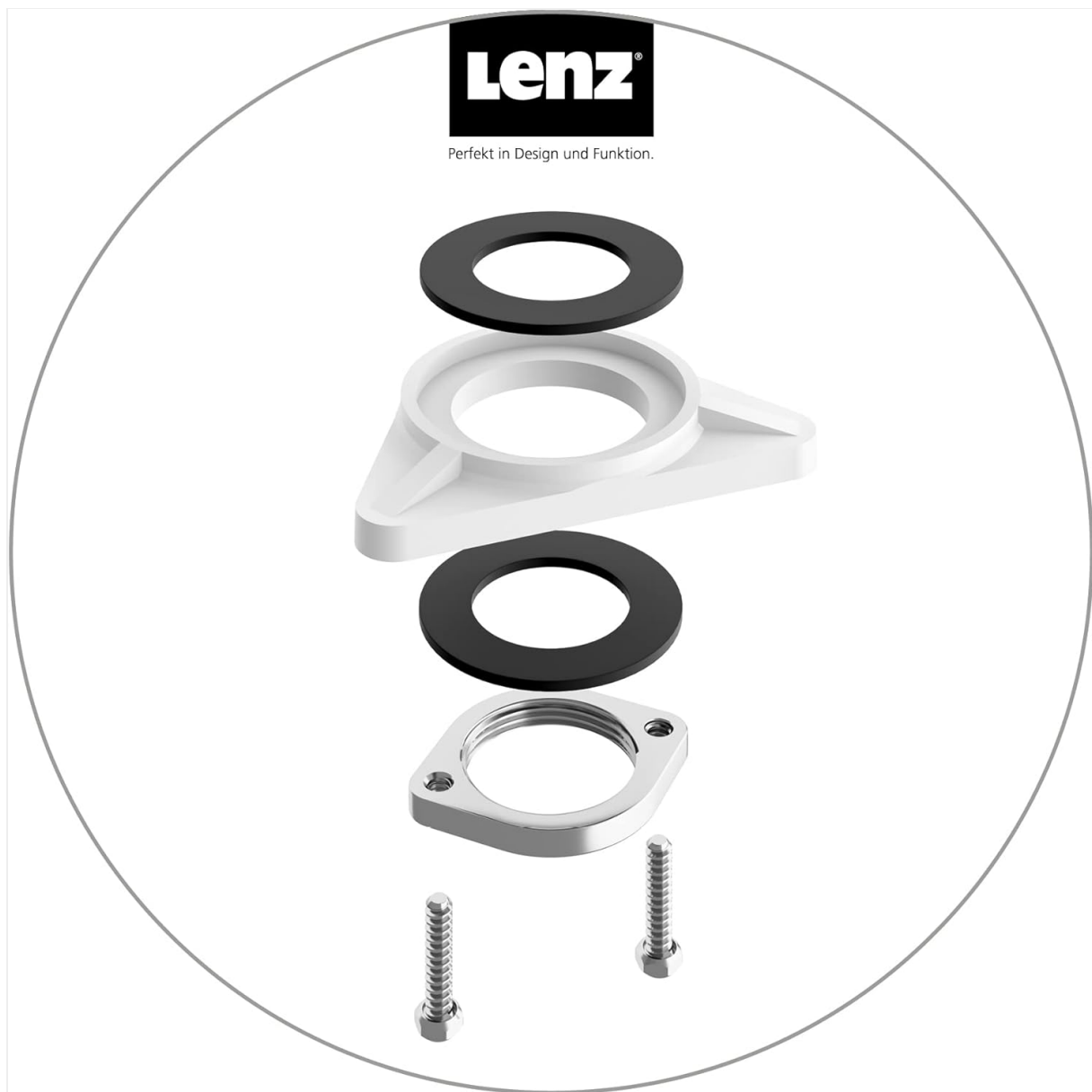
Figure 1: Exploded view of the mounting hardware, including gaskets, mounting plate, and screws.