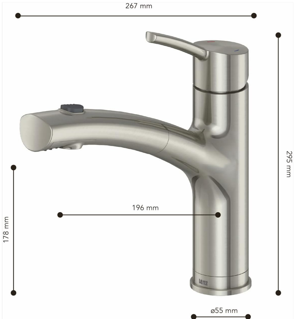
Figure 3: Key dimensions of the Lenz Nexo 2 kitchen faucet.