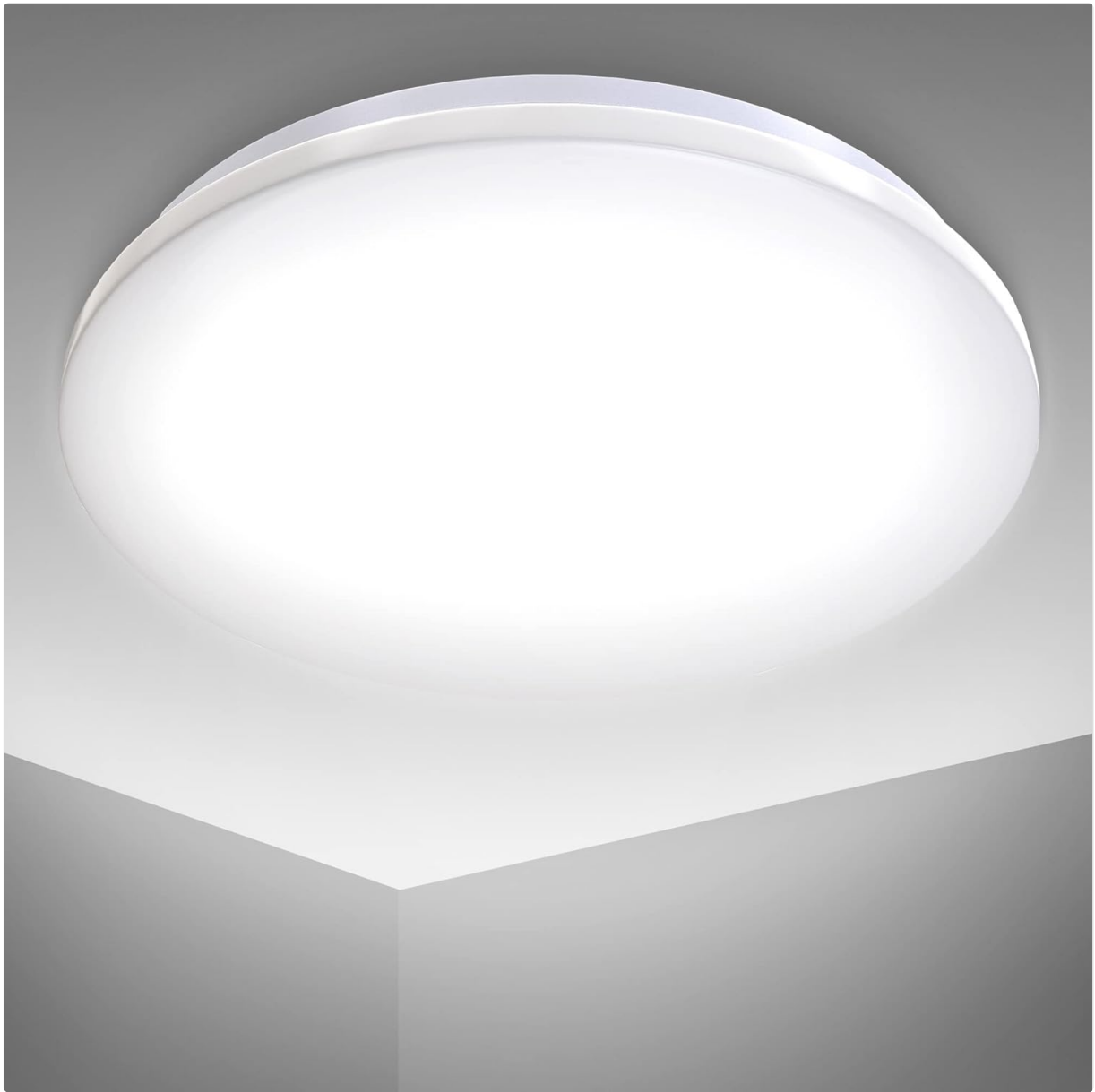
Image 1.1: B.K.Licht LED Ceiling Light BKL1178 installed on a ceiling, emitting a bright, neutral white light.