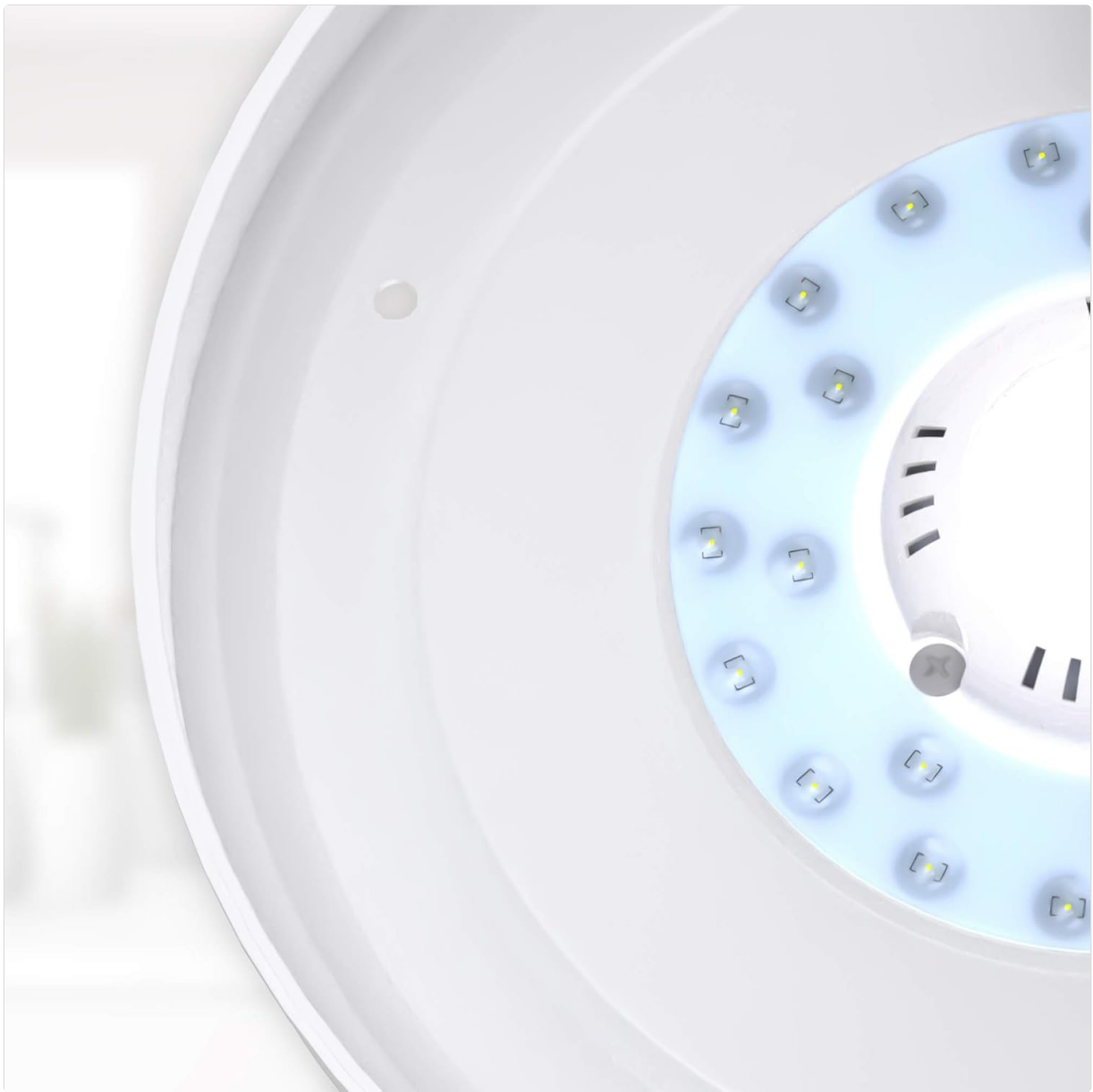
Image 3.2: Close-up view of the integrated LED module and internal wiring area.