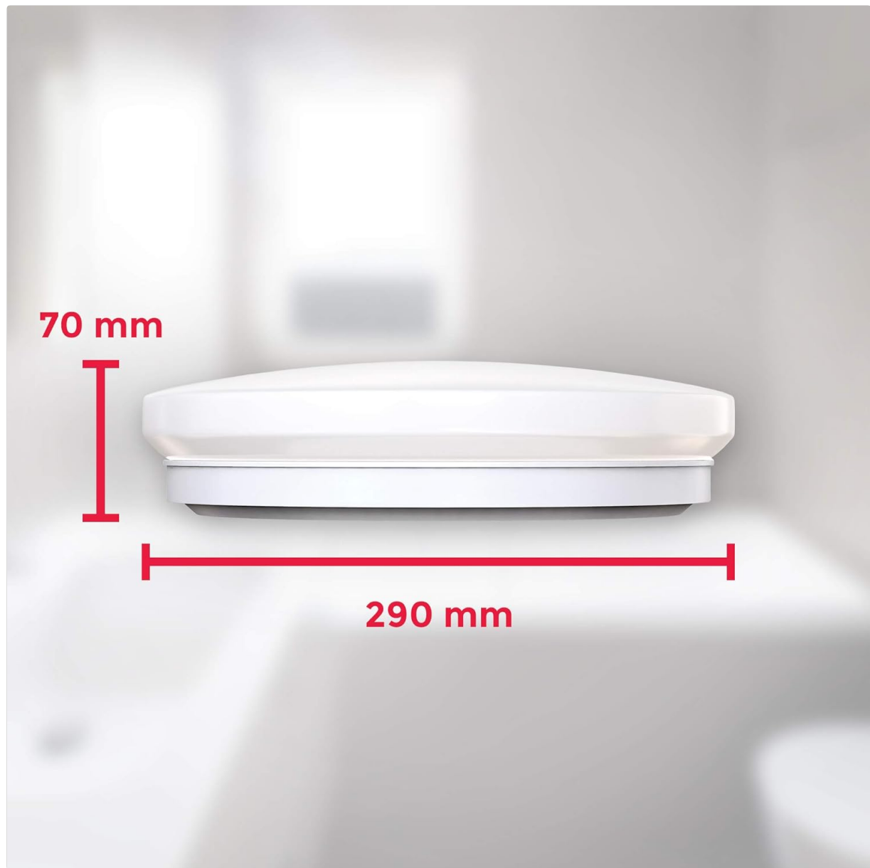
Image 3.1: Dimensions of the B.K.Licht LED Ceiling Light (290mm diameter, 70mm height).