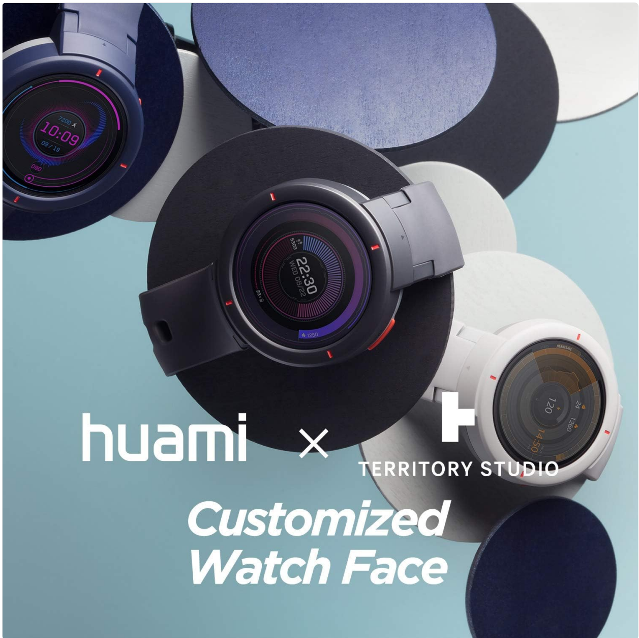
Figure 6: Customized Watch Faces