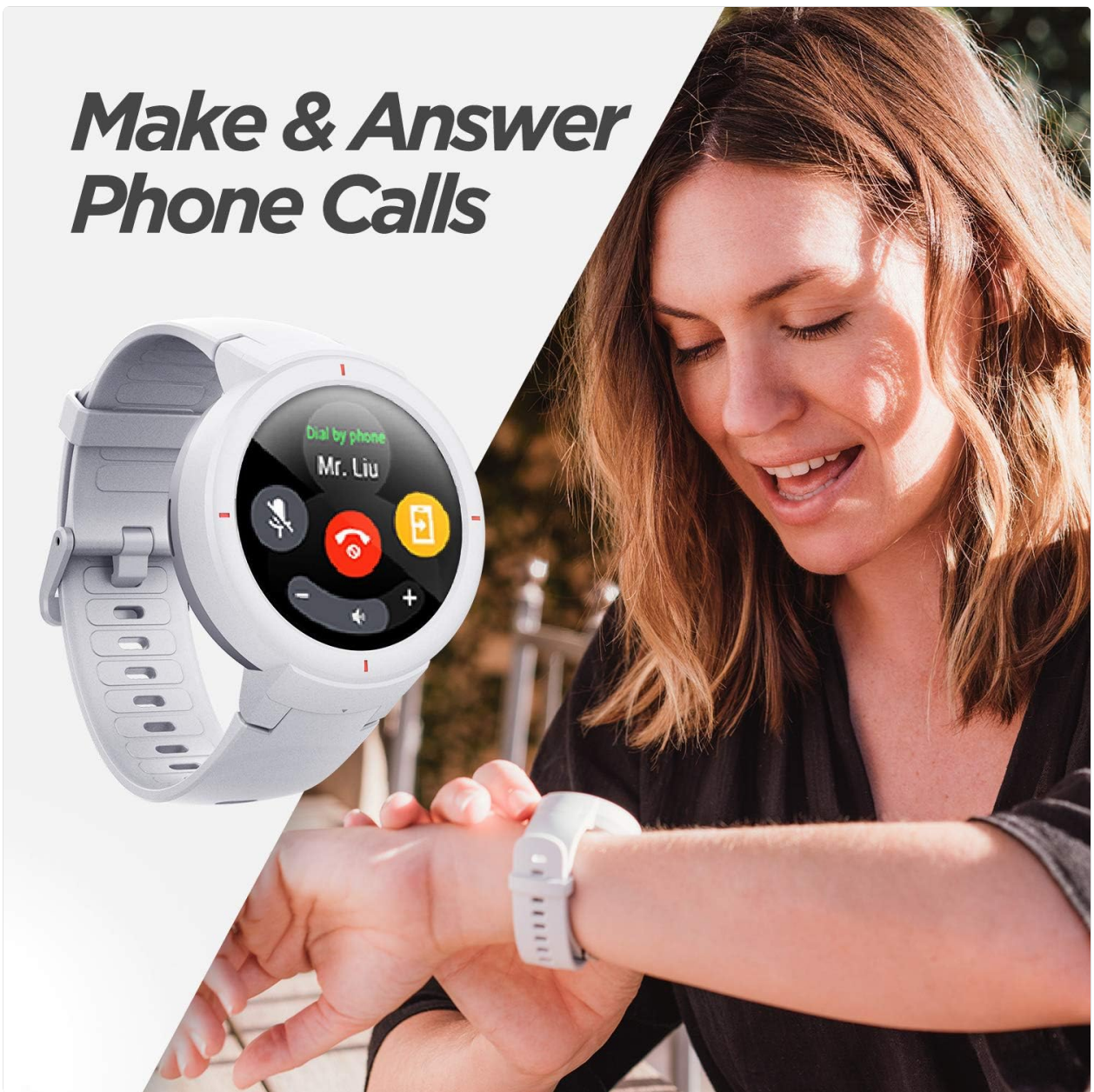
Figure 3: Call Functionality