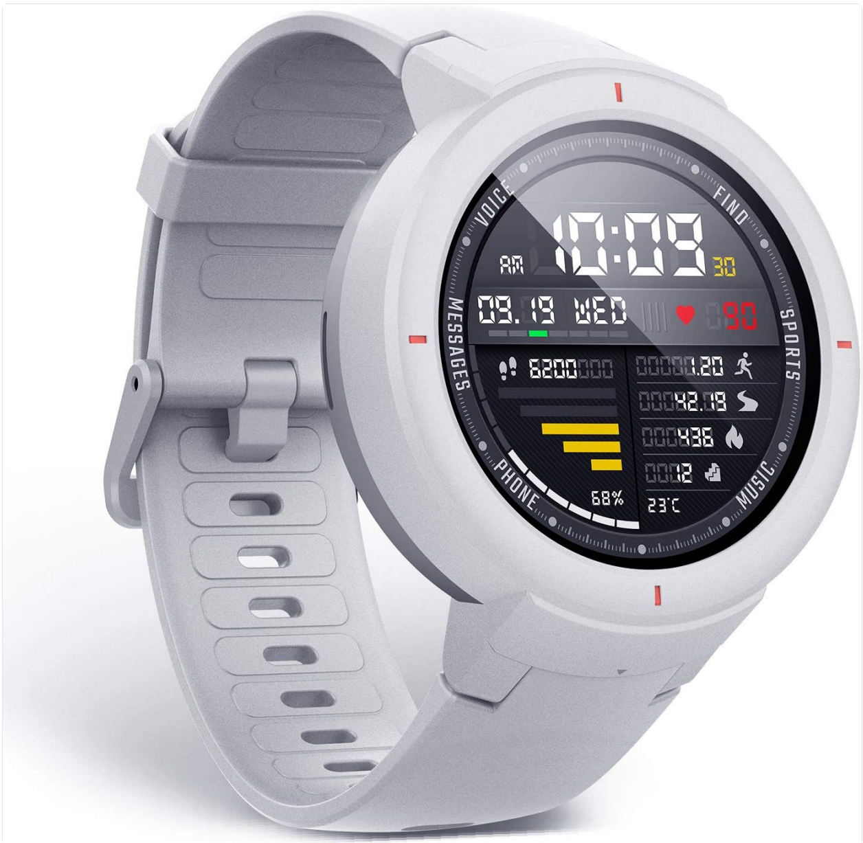
Figure 1: Amazfit Verge Smartwatch, White