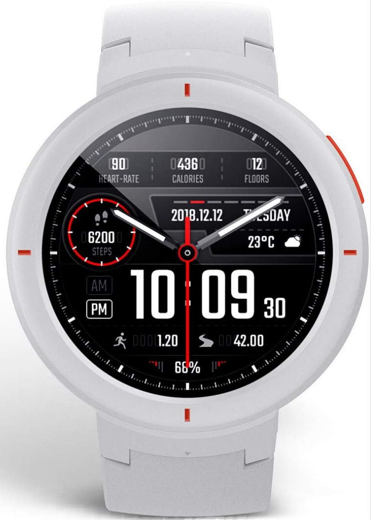
Figure 2: 1.3-inch AMOLED Display