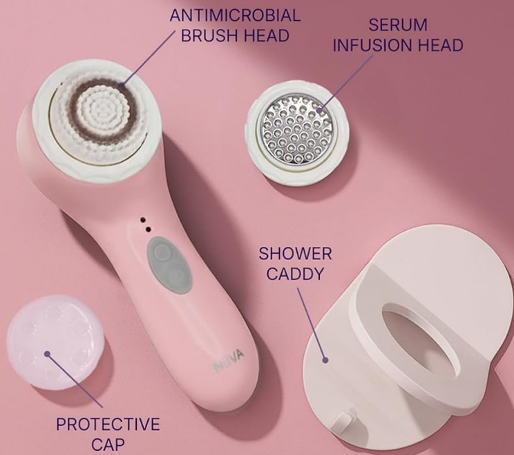
Image: All components included with the Spa Sciences NOVA device.