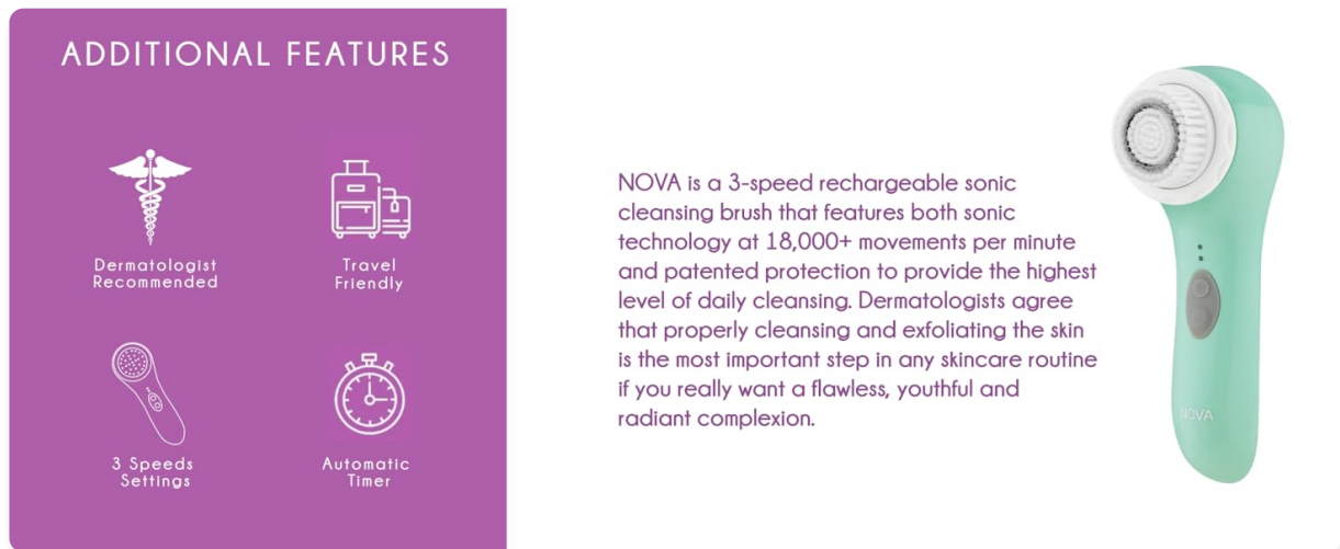
Image: Key features of the Spa Sciences NOVA device.