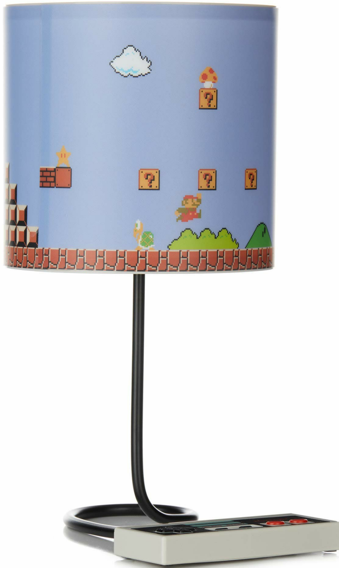
Image: The Paladone Nintendo Super Mario Bros Lamp, featuring a Super Mario level design on the lampshade and an NES controller base.