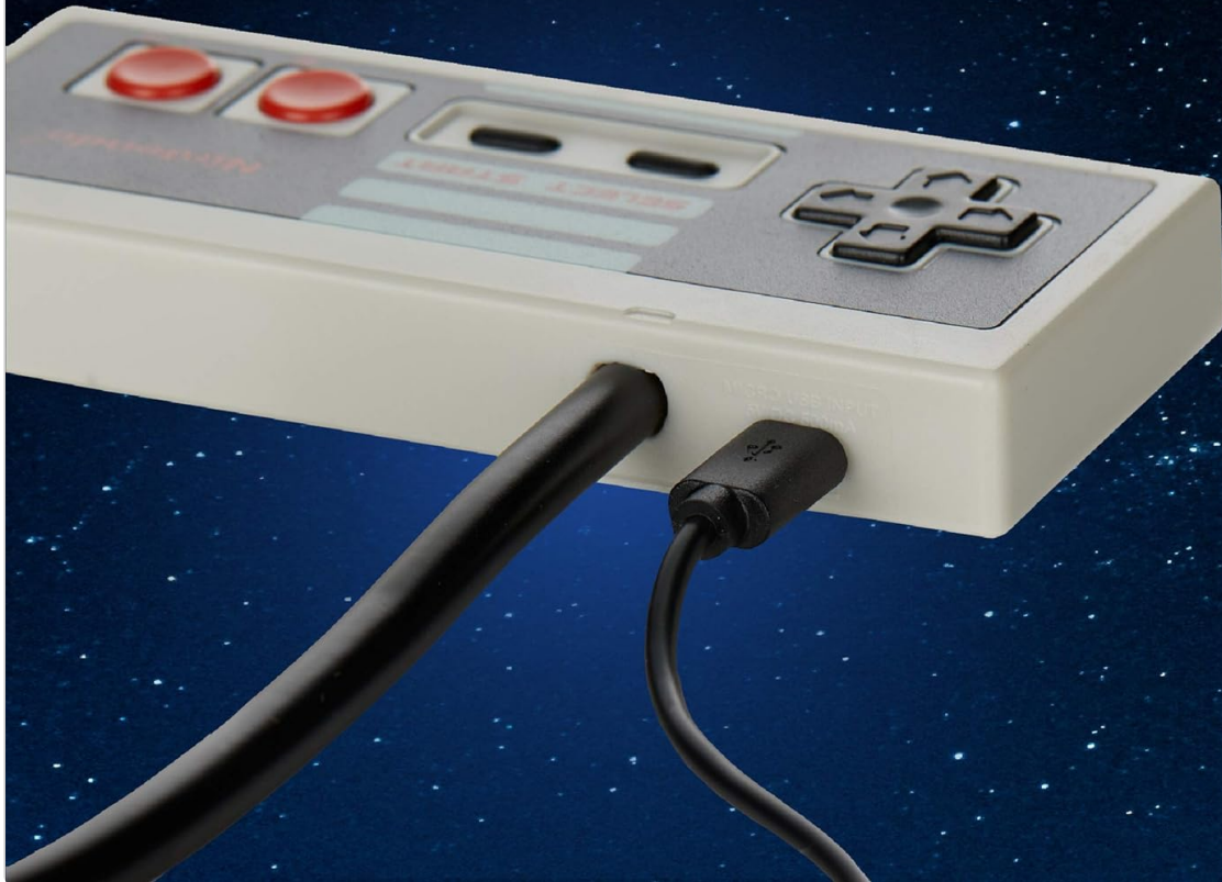
Image: Close-up of the NES controller base showing the Micro USB input port and the connected USB cable. Text on the image indicates "60" Micro USB Included. Wall Adapter NOT Included."