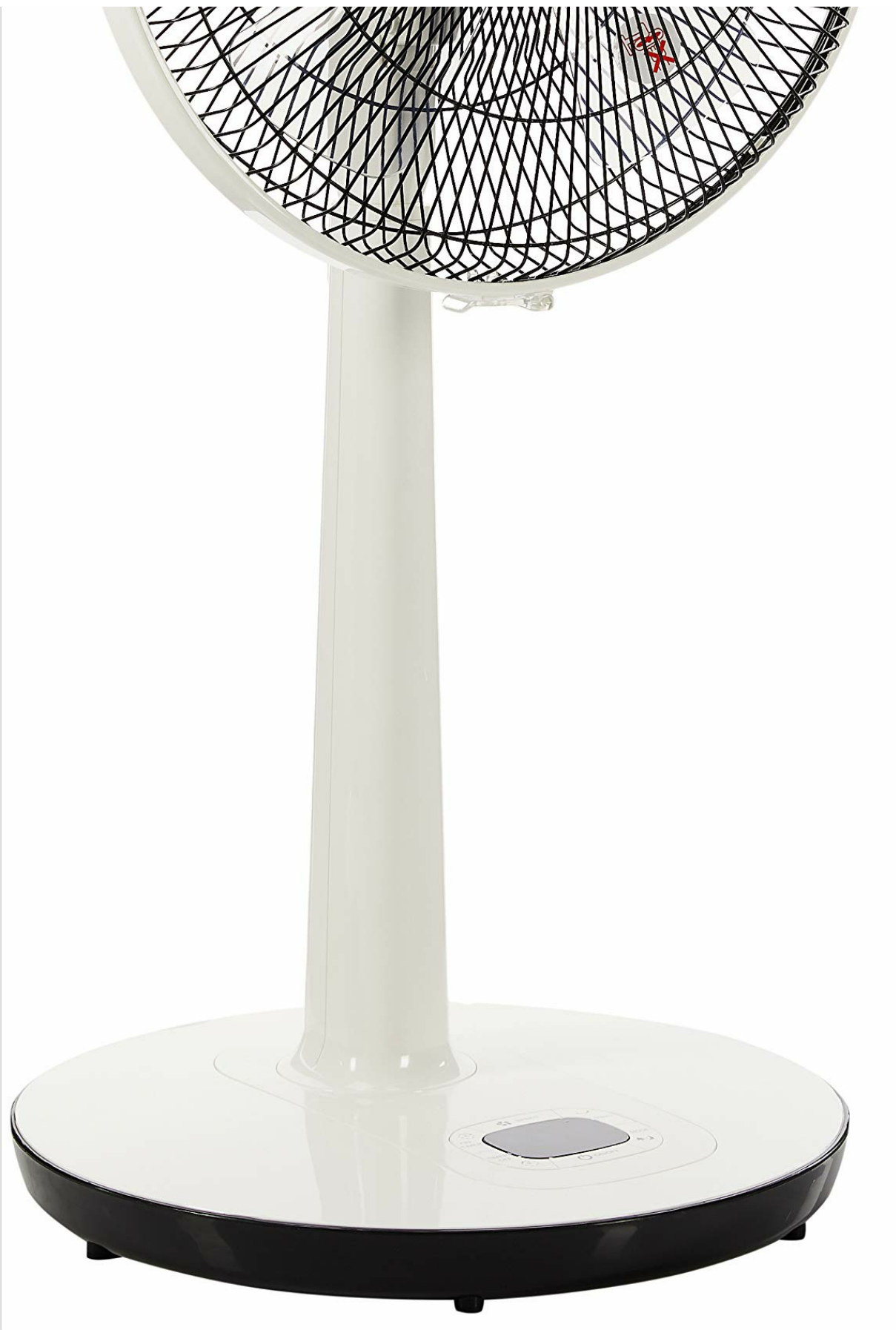
Figure 1: MISTRAL MLF3508R Slide Fan (Front View)

This image shows the MISTRAL MLF3508R 14-inch Slide Fan from the front. It features a white body, a circular fan head with a protective grille, and a stable black base. The fan is designed for floor placement and offers adjustable height.