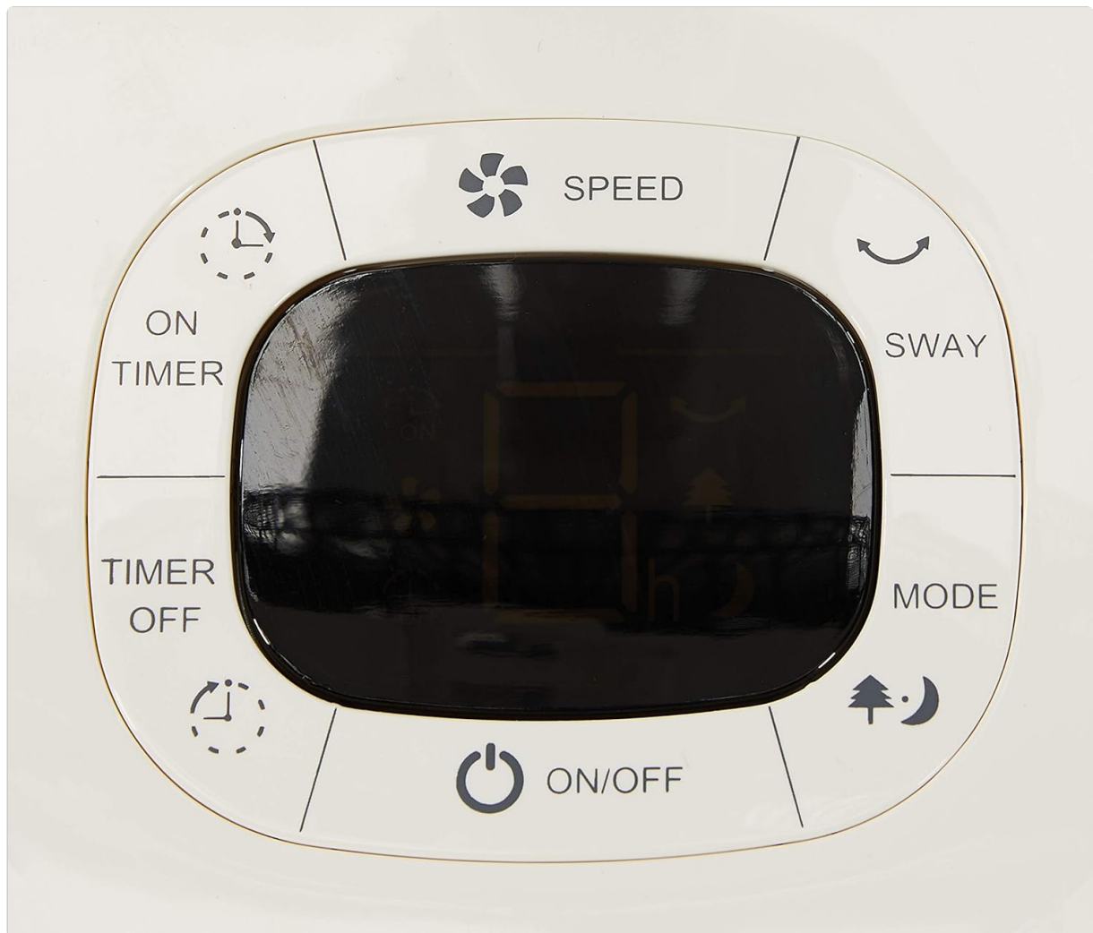
Figure 3: Fan Control Panel

This image displays a detailed view of the control panel located on the fan's base. It features a central digital display and touch-sensitive buttons for various functions including power, speed, oscillation (sway), mode selection, and timer settings.