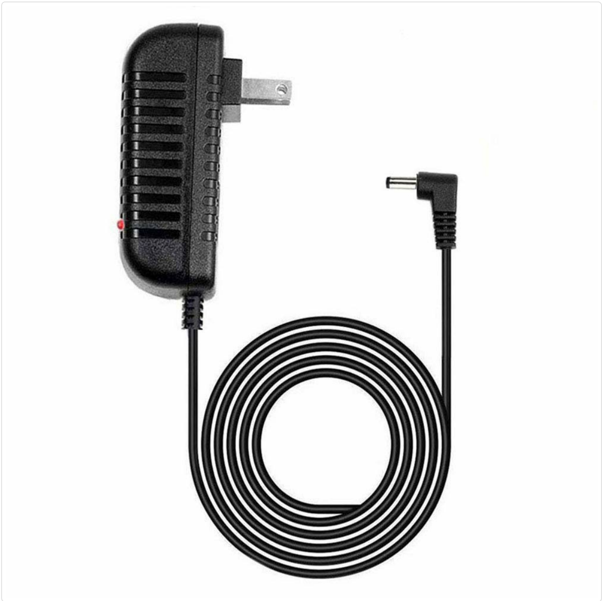
Image: The GUY-TECH AC Adapter, showing the main unit, power cord, and standard wall plug. This adapter provides power to compatible devices.