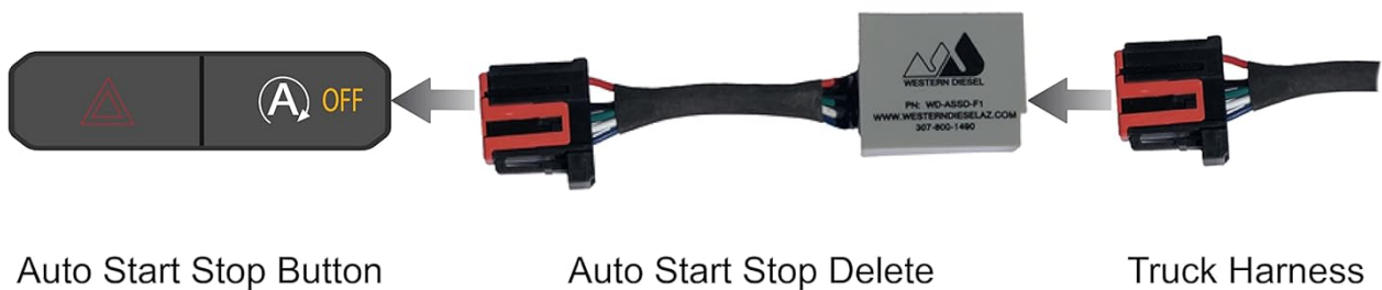
Image: Diagram illustrating the connection points: the Auto Start Stop Button connects to the Auto Start Stop Delete module, which then connects to the Truck Harness.

Auto Start Stop Delete installs between the button and the truck harness