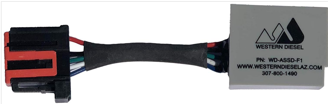
Image: The Auto Start Stop Delete/Disable/Eliminator module, showing its compact design and connectors.