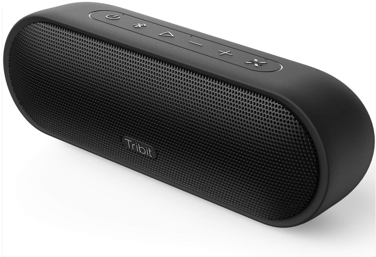
Figure 2: Top Controls and Indicators

The top panel features intuitive buttons for power, volume, playback, and special sound modes.