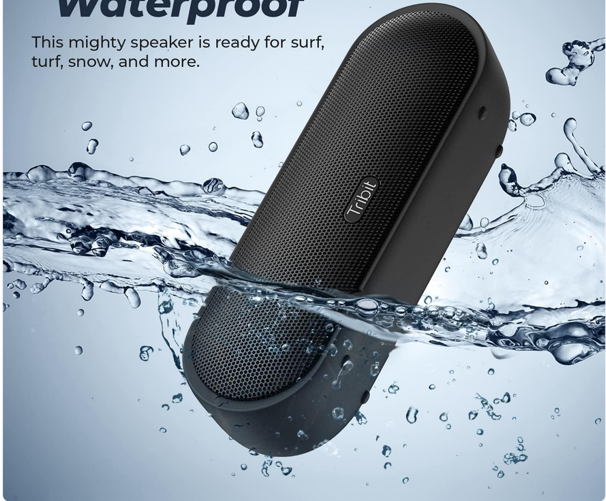
Figure 6: IPX7 Waterproof Rating

This mighty speaker is ready for surf, turf, snow, and more.