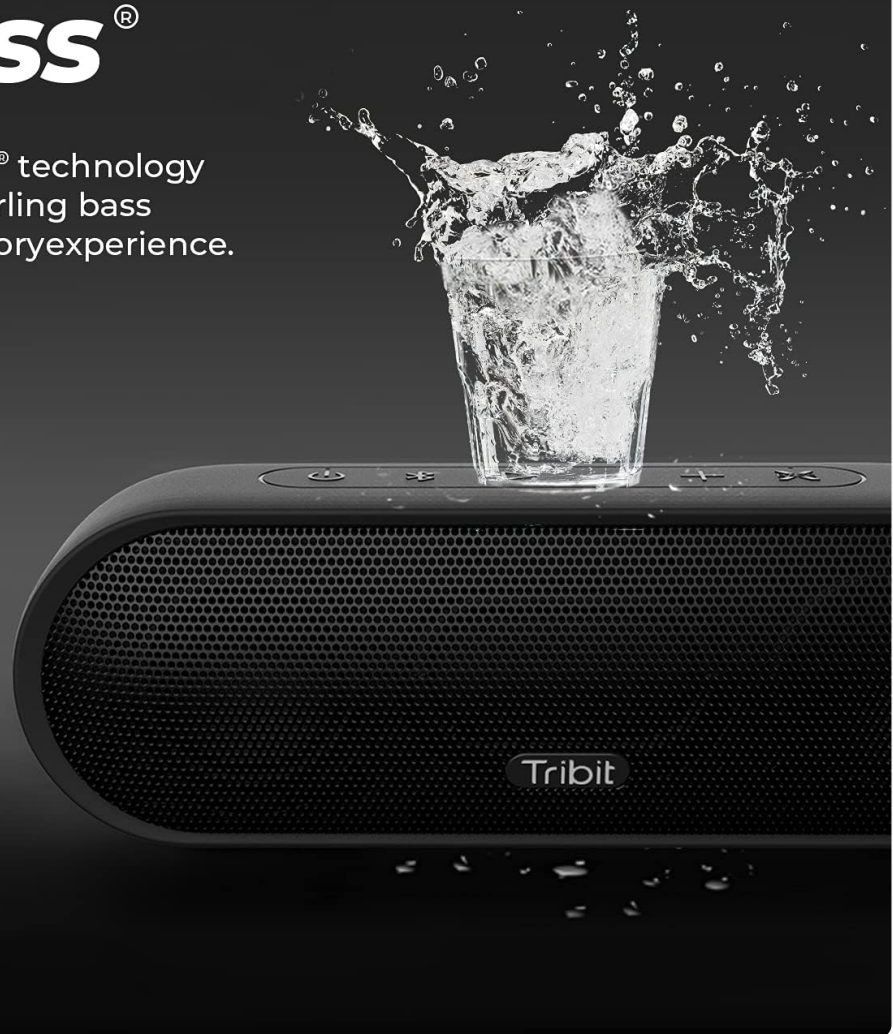
Figure 5: XBass Feature

Powerful XBass® technology provides toe-curling bass for a multi-sensory experience.