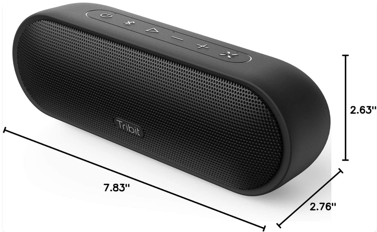
Figure 3: Speaker Dimensions and Side View