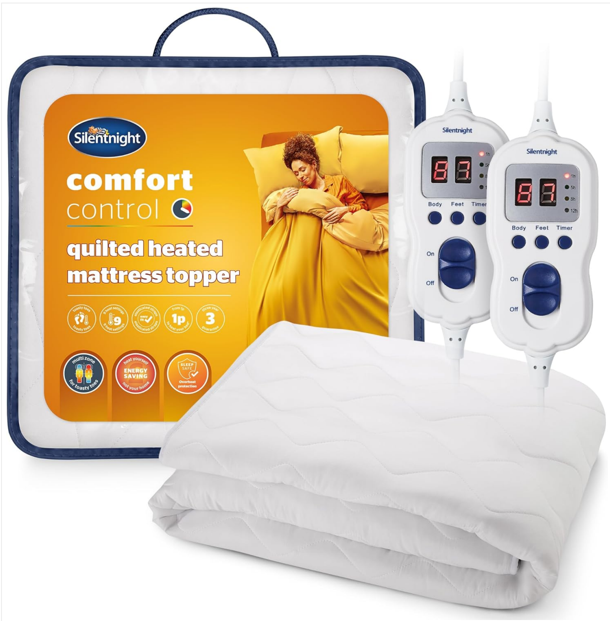
Image 1: Product Overview. The Silentnight Comfort Control Quilted Heated Mattress Topper, King Size, shown with its two independent controllers. The topper features a soft quilted surface.