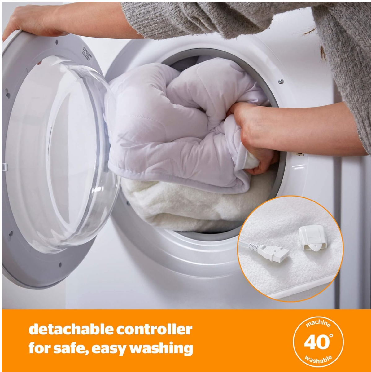
Image 8: Machine Washable. This image shows the heated mattress topper being placed into a washing machine, emphasizing its machine washable feature at 40°C, with an inset highlighting the detachable controller for safe cleaning.