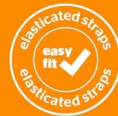
Image 4: Securing with Elastic Straps. This image demonstrates how the elastic straps are used to provide a secure fit, keeping the topper in place on the mattress.