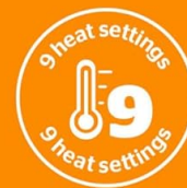
Image 5: Controller Detail. A close-up view of the control unit, illustrating the digital display, power switch, and buttons for adjusting body, feet, and timer settings. There are 9 heat settings available.

choose from 9 heat settings so you can control your comfort