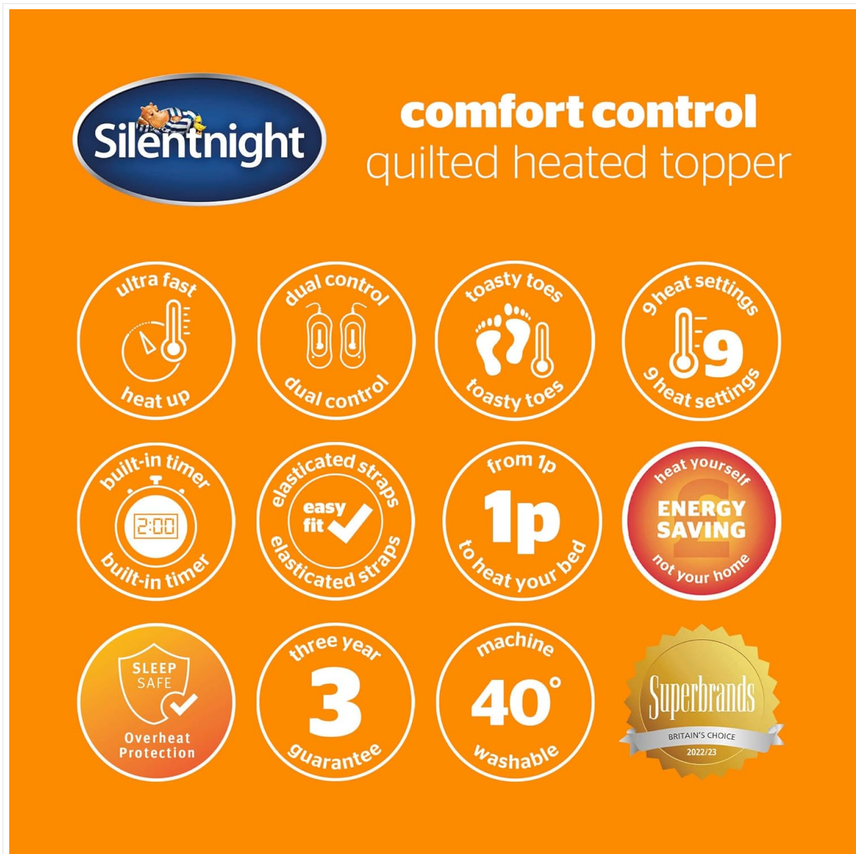
Image 3: Feature Overview. A visual summary of the key features, including fast heat-up, dual control, multi-zone heating, nine heat settings, built-in timer, elastic straps, energy efficiency, machine washability, overheat protection, and a 3-year guarantee.