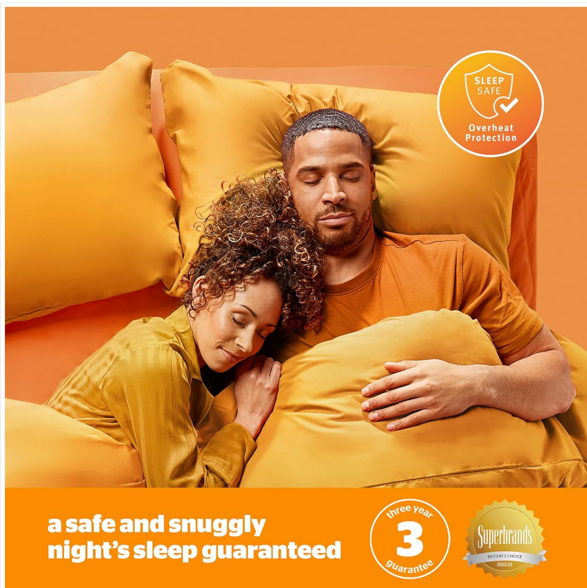
Image 2: Safety Features. This image highlights the "Sleep Safe" and "Overheat Protection" features, ensuring a secure and comfortable night's sleep.