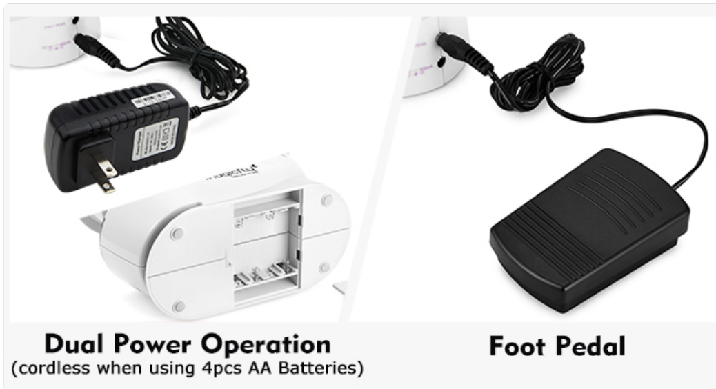
Image: Illustration of the dual power options: using the power adapter for continuous operation or 4 AA batteries for portable use.