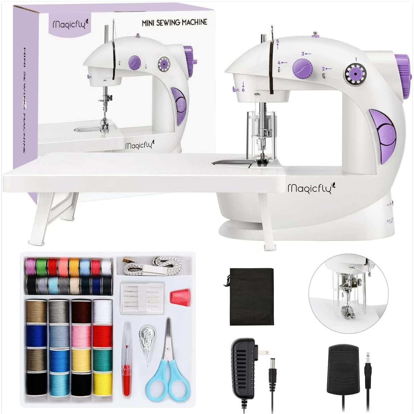
Image: The complete package contents, including the sewing machine, extension table, power adapter, foot pedal, and a comprehensive sewing accessory kit.