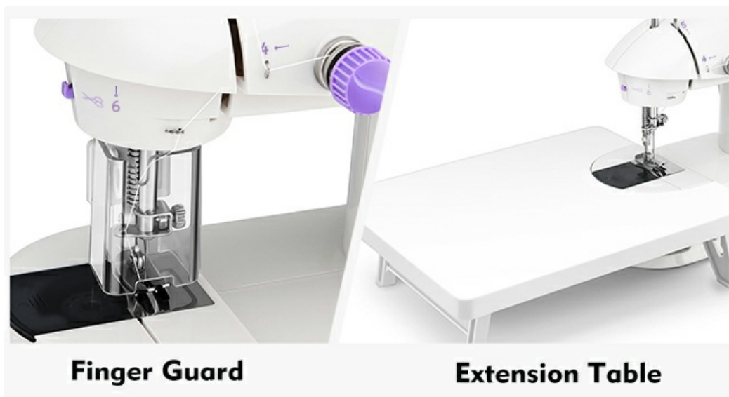
Image: The extension table provides a larger work surface for various sewing projects, easily attaching to the main unit.