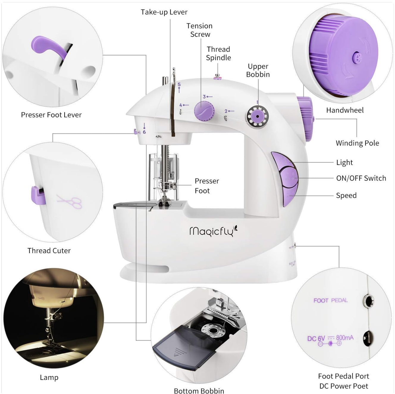
Image: A detailed diagram illustrating the key components of the sewing machine, including the take-up lever, tension screw, thread spindle, upper bobbin, handwheel, winding pole, light, ON/OFF switch, speed control, foot pedal port, DC power port, bottom bobbin, lamp, thread cutter, presser foot lever, and presser foot.