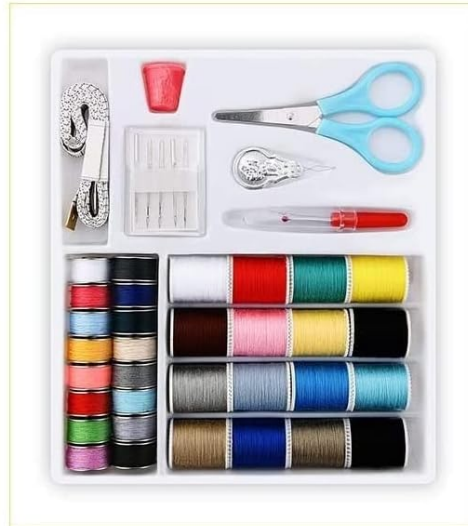
Sewing Accessory Set (42pcs)