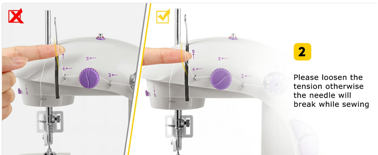
Image: Visual guide for correct upper threading. Incorrect threading can lead to thread breakage or jamming.

2 Please loosen the tension otherwise the needle will break while sewing