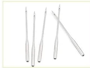
3 Sewing Needle Types