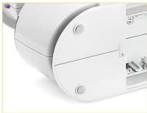
Anti-Slip Rubber Pad