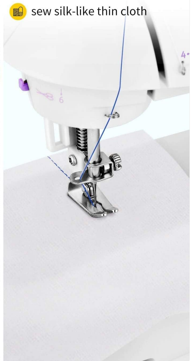
Image: The machine is capable of straight-line sewing on various fabric thicknesses, from multi-layered cloth to delicate silk-like materials.