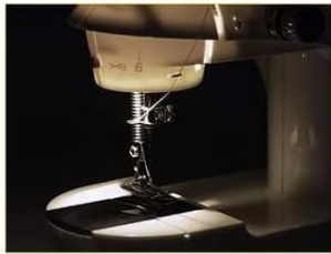
Built-in Sewing Light