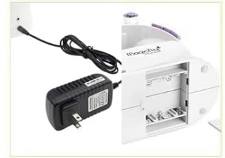
Dual Power Operation