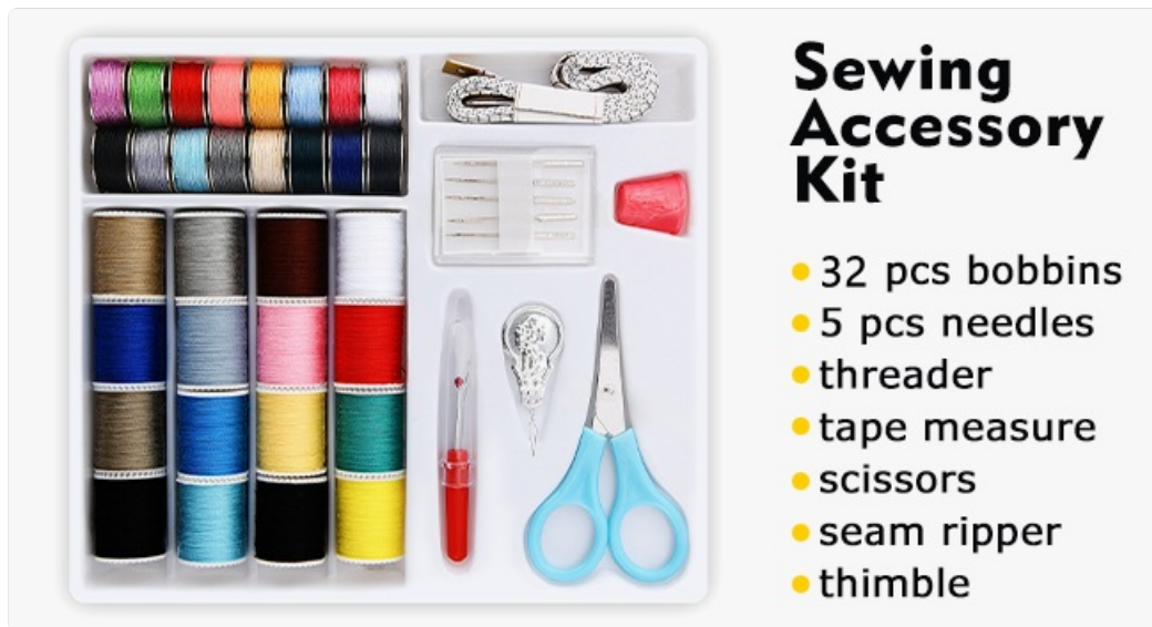
Image: A closer look at the included sewing accessory kit, featuring 32 bobbins, 5 needles, threader, tape measure, scissors, seam ripper, and thimble.