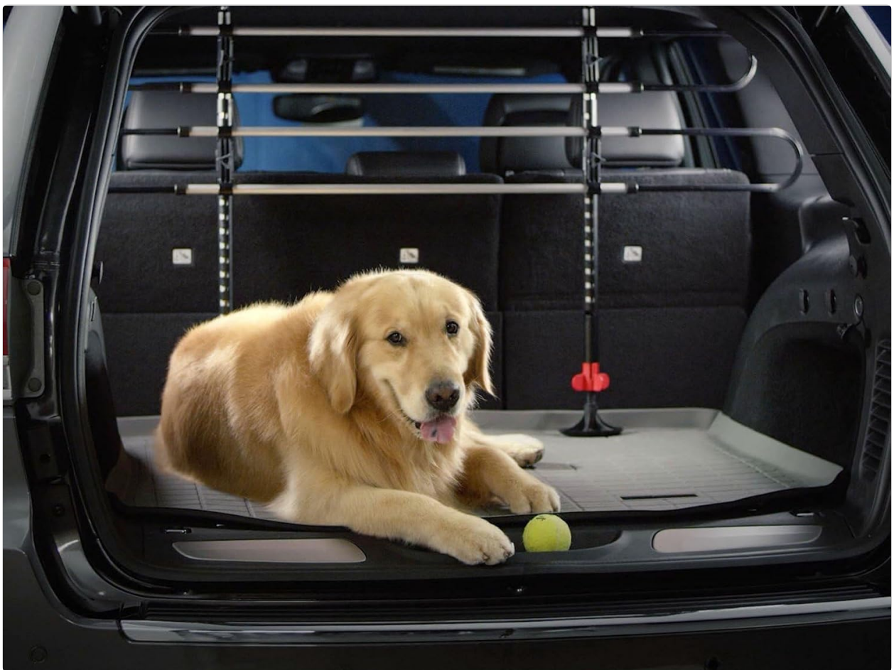
Image 3.4: Dog comfortably resting on the Cargo Liner. This image illustrates the liner's suitability for pet transport, providing a stable and easy-to-clean surface for animals.