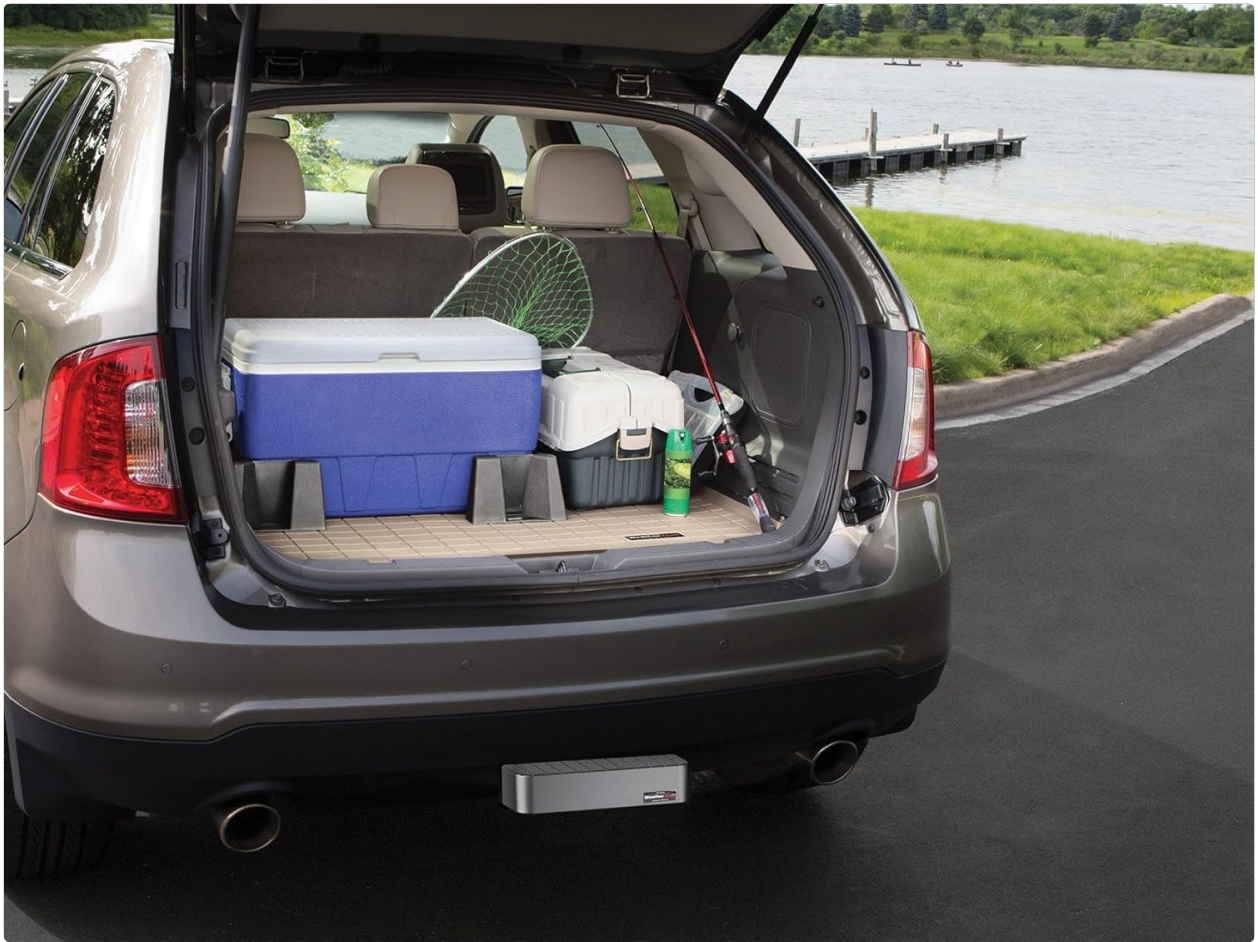
Image 2.2: Close-up of the Cargo Liner installation. This detailed view highlights the snug fit of the liner against the trunk's edges and the distinct WeatherTech logo, confirming proper installation.