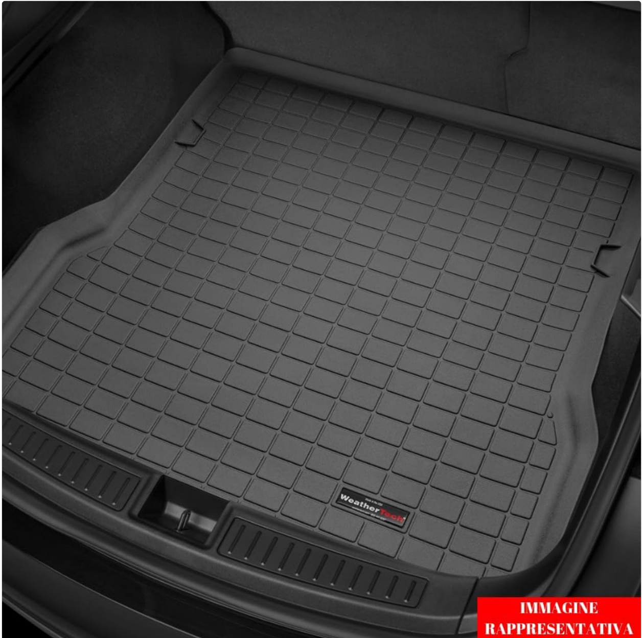
Image 2.1: Cargo Liner installed in a vehicle. This image shows the WeatherTech Cargo Liner precisely fitted into the trunk space of a vehicle, demonstrating its custom-molded shape and coverage.