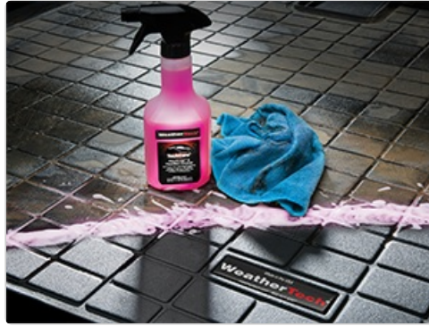
Image 4.1: Cleaning the WeatherTech Cargo Liner. This image shows a spray bottle and a cloth on the textured surface of the liner, demonstrating the ease of cleaning the durable TPE material.