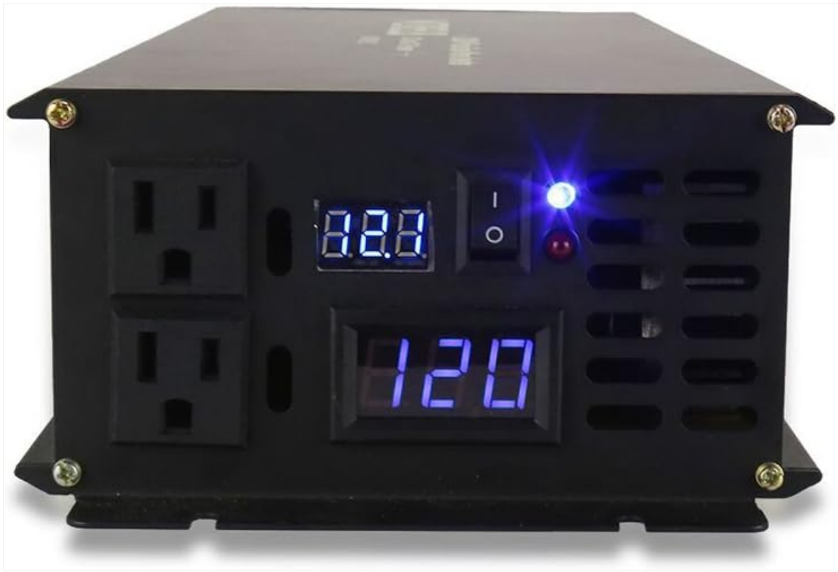
Image 4.1: Front panel of the inverter, showing the dual USA type outlets, power switch, and LED displays for DC and AC voltages.