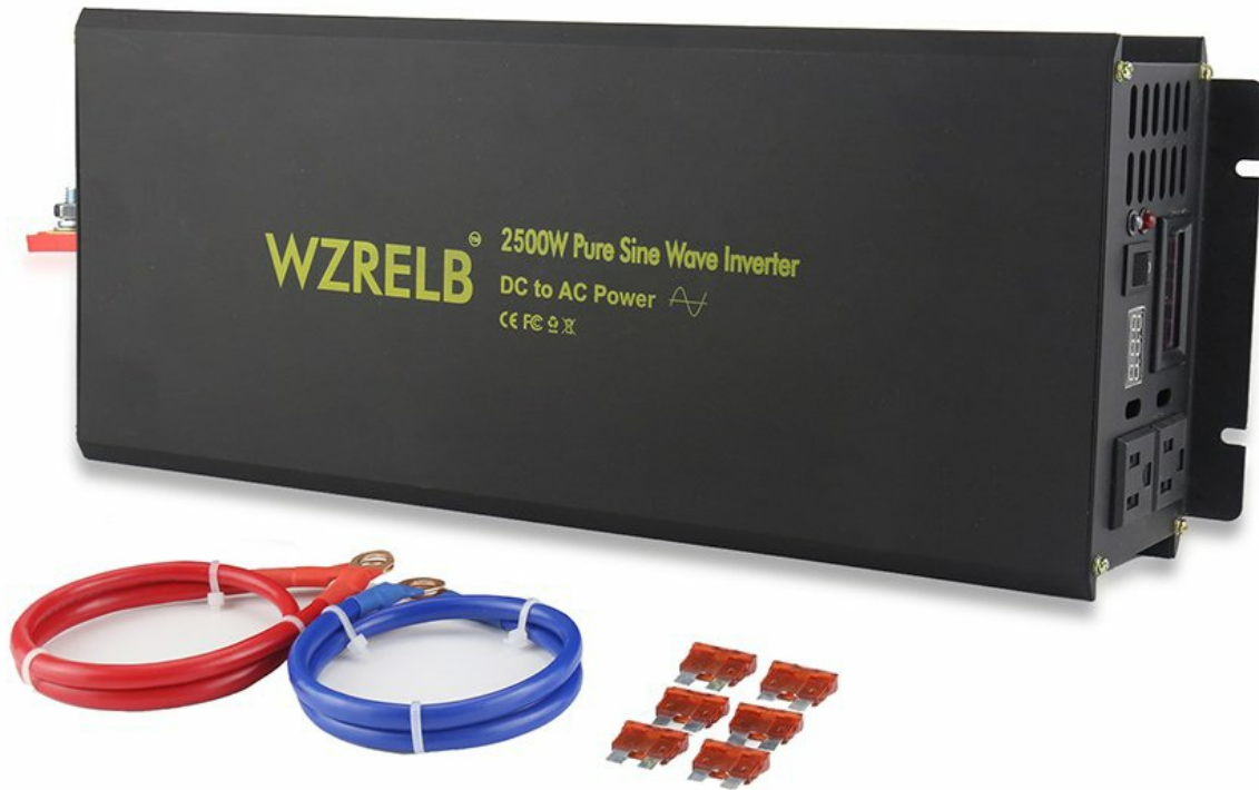
Image 1.1: WZRELB 2500W Pure Sine Wave Power Inverter, showing the overall unit with outlets and digital displays.